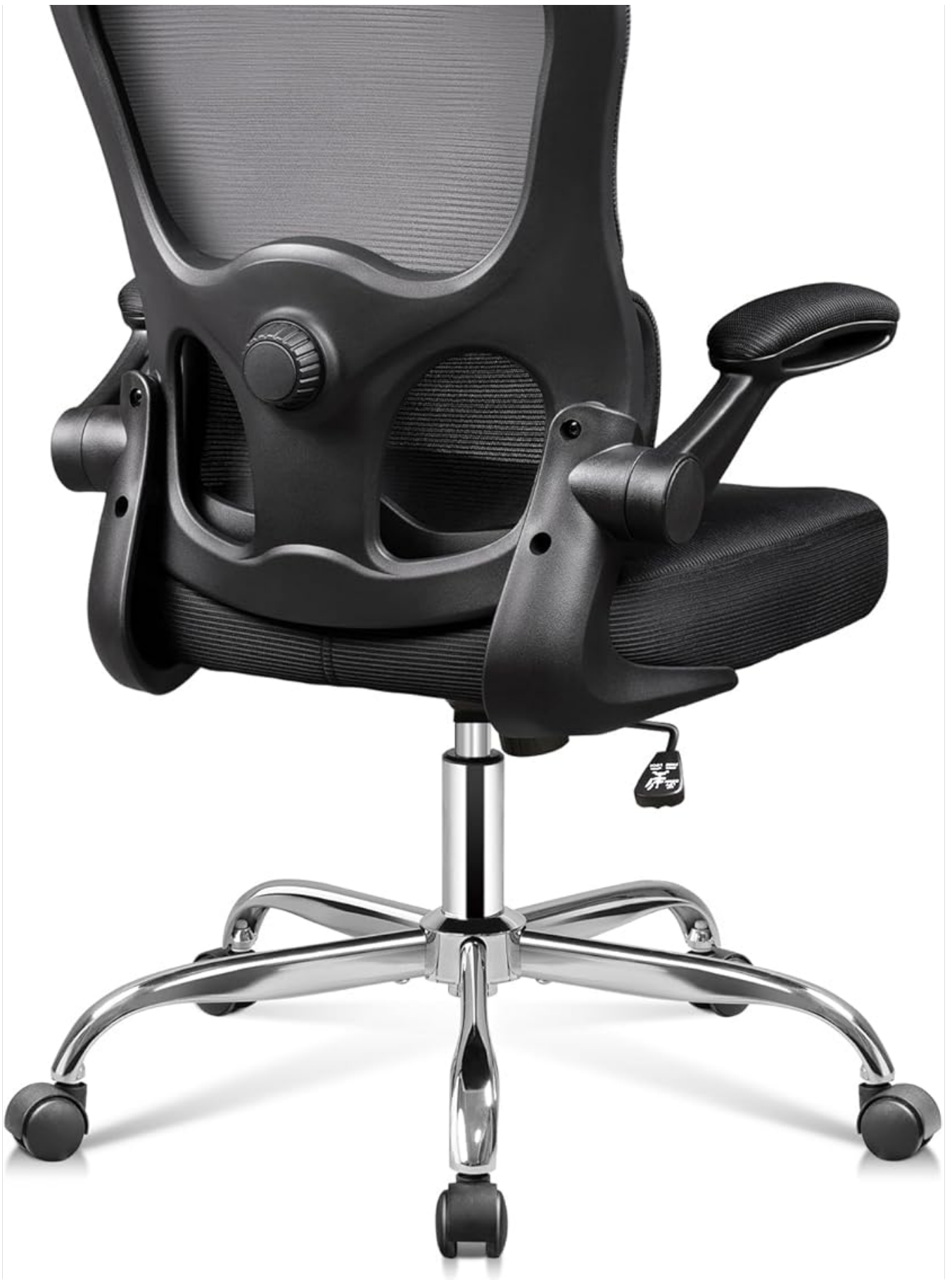
Figure 2: Back view of the DEVAISE Ergonomic Mesh Desk Chair, highlighting the mesh backrest and lumbar support mechanism.