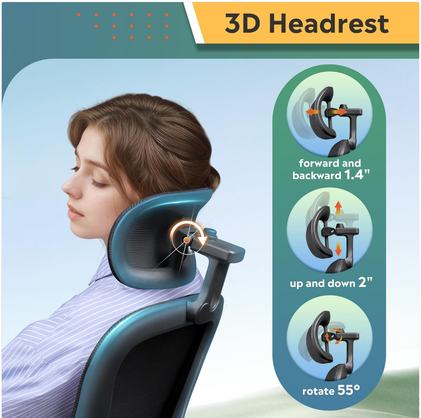
Figure 6: Illustrations of the 3D headrest's height, tilt, and rotation adjustments.