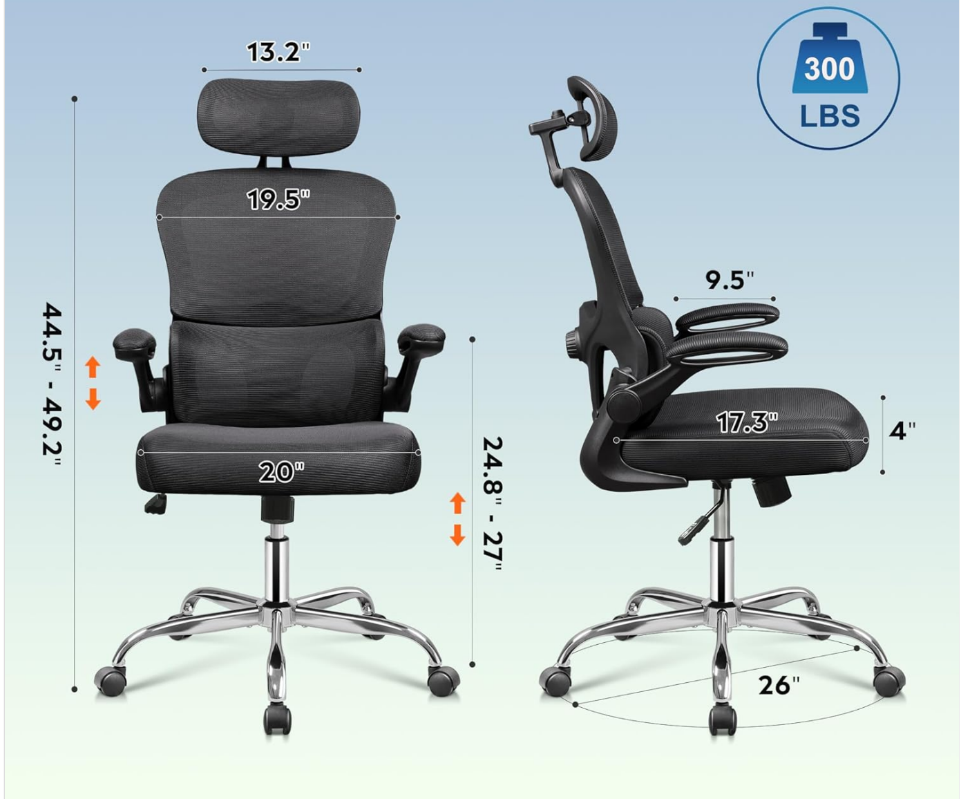
Figure 12: Detailed product dimensions and maximum weight capacity.