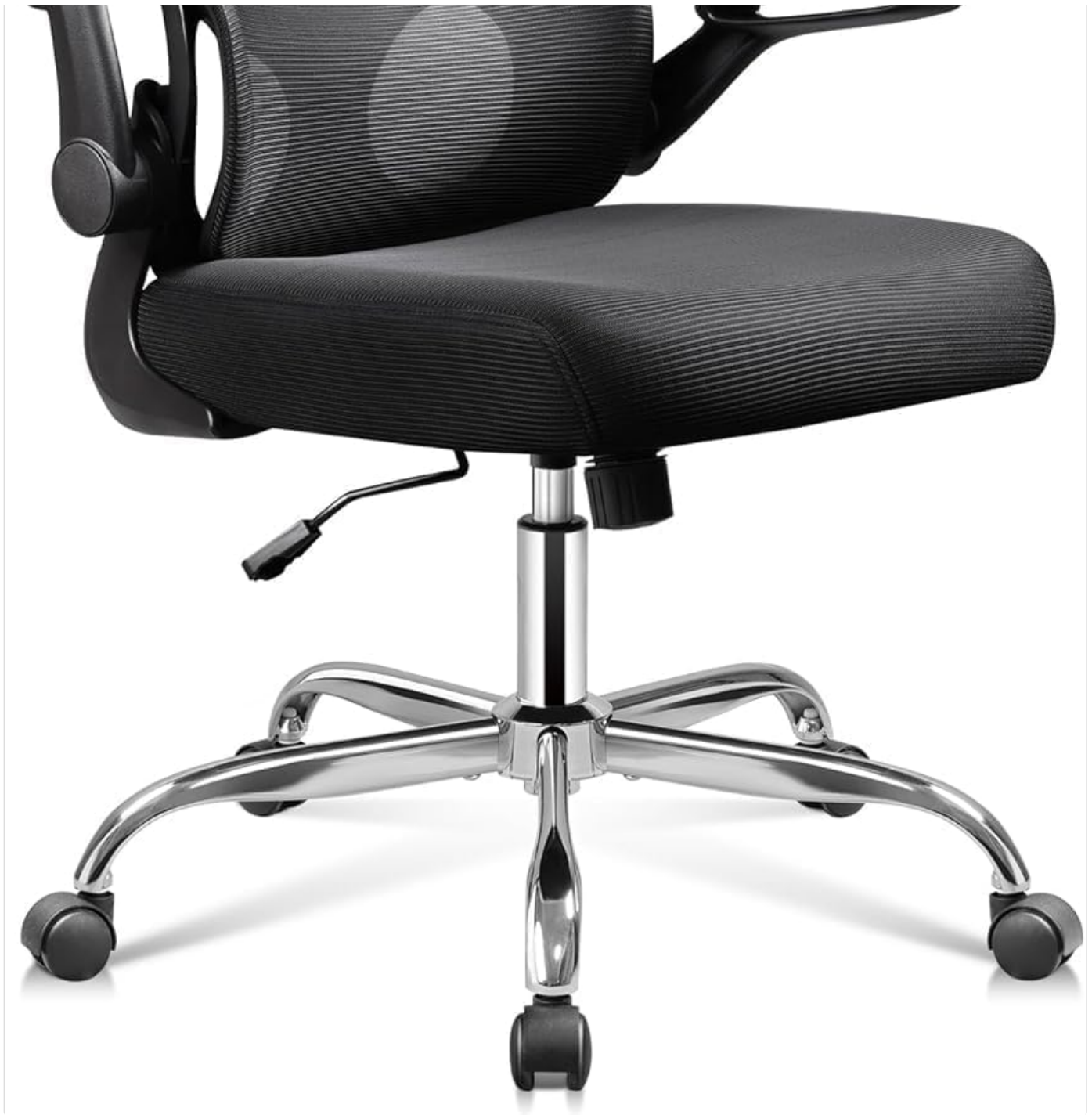
Figure 1: Front view of the DEVAISE Ergonomic Mesh Desk Chair.