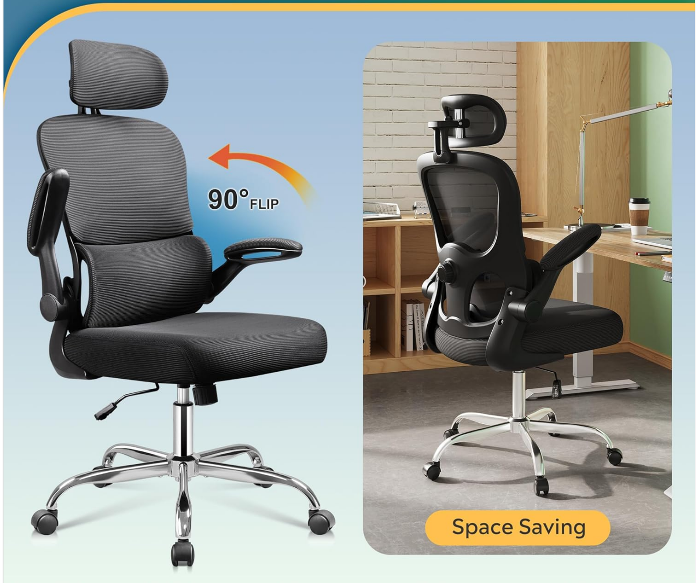
Figure 8: The chair demonstrating its 90-degree flip-up armrests for space-saving.