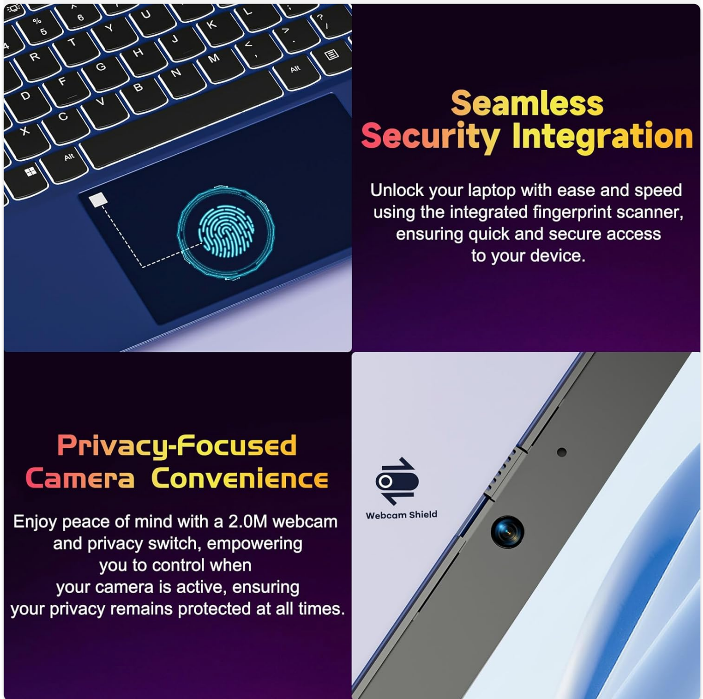
Image: Close-up of the laptop's touchpad showing the integrated fingerprint sensor for secure login, and the webcam with its privacy shield.

For enhanced security and convenient login, set up the integrated fingerprint reader. Navigate to Windows Settings > Accounts > Sign-in options and follow the prompts to register your fingerprints.