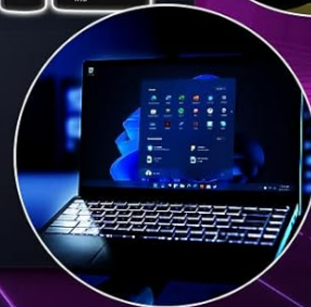
Image: The laptop's keyboard and touchpad, highlighting the backlit keys, integrated fingerprint sensor, and numeric keypad for effortless typing in various environments.