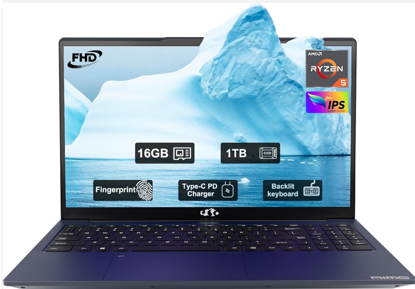
Image: The NIMO 15.6" FHD Business Laptop, showcasing its sleek design and key features like 16GB RAM, 1TB SSD, Fingerprint sensor, Type-C PD Charger, and Backlit keyboard.

Welcome to the user manual for your NIMO 15.6" FHD Business Laptop. This guide provides essential information for setting up, operating, maintaining, and troubleshooting your device. Please read this manual thoroughly to ensure optimal performance and longevity of your laptop.