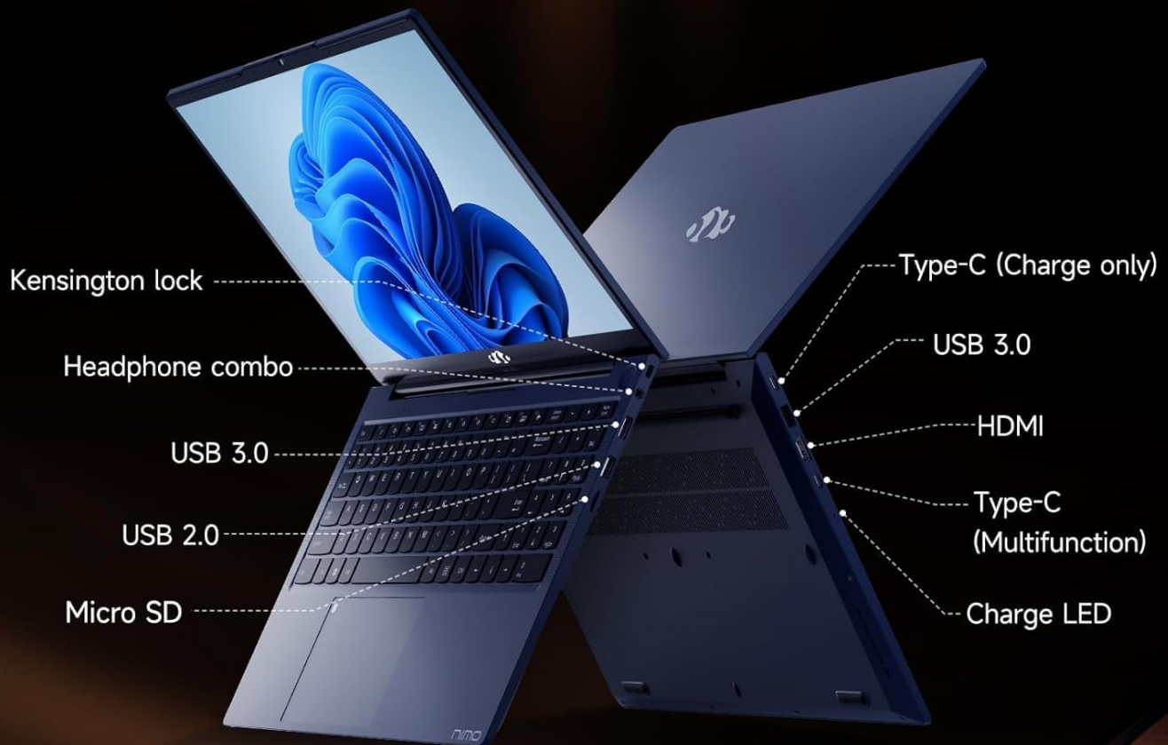
Image: Diagram showing the various ports on the NIMO laptop, including USB, HDMI, Type-C, headphone combo, Micro SD, and Kensington lock slot.