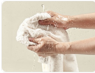
Image: Hands washing a plush cushion under running water, illustrating its machine-washable feature.