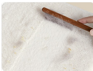
Image: A hand demonstrating how to clean the plush cushion with a comb to remove cat hair.