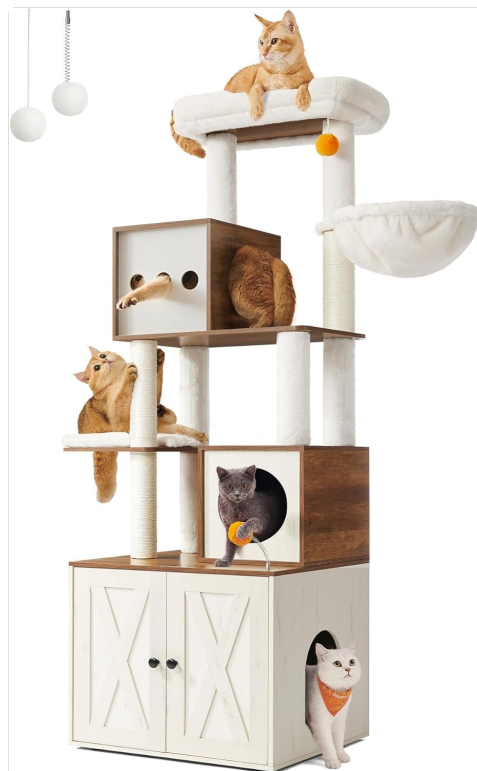
Image: The Feandrea Cat Tree in a home setting, showcasing its various levels and features with multiple cats interacting with it.