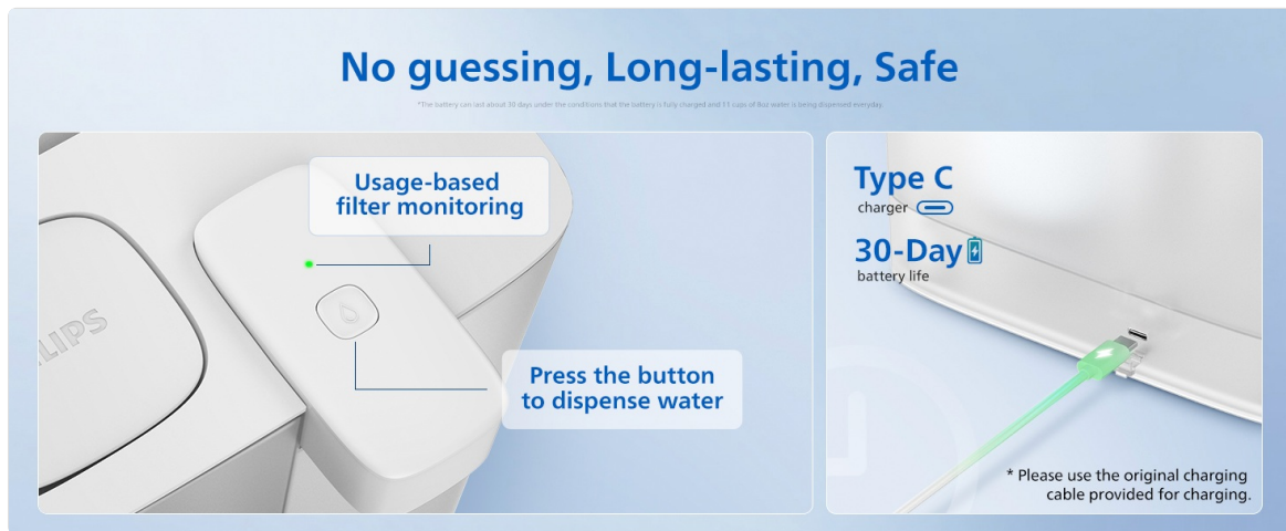
Image: Detailed explanation of the filter monitoring light indicators.