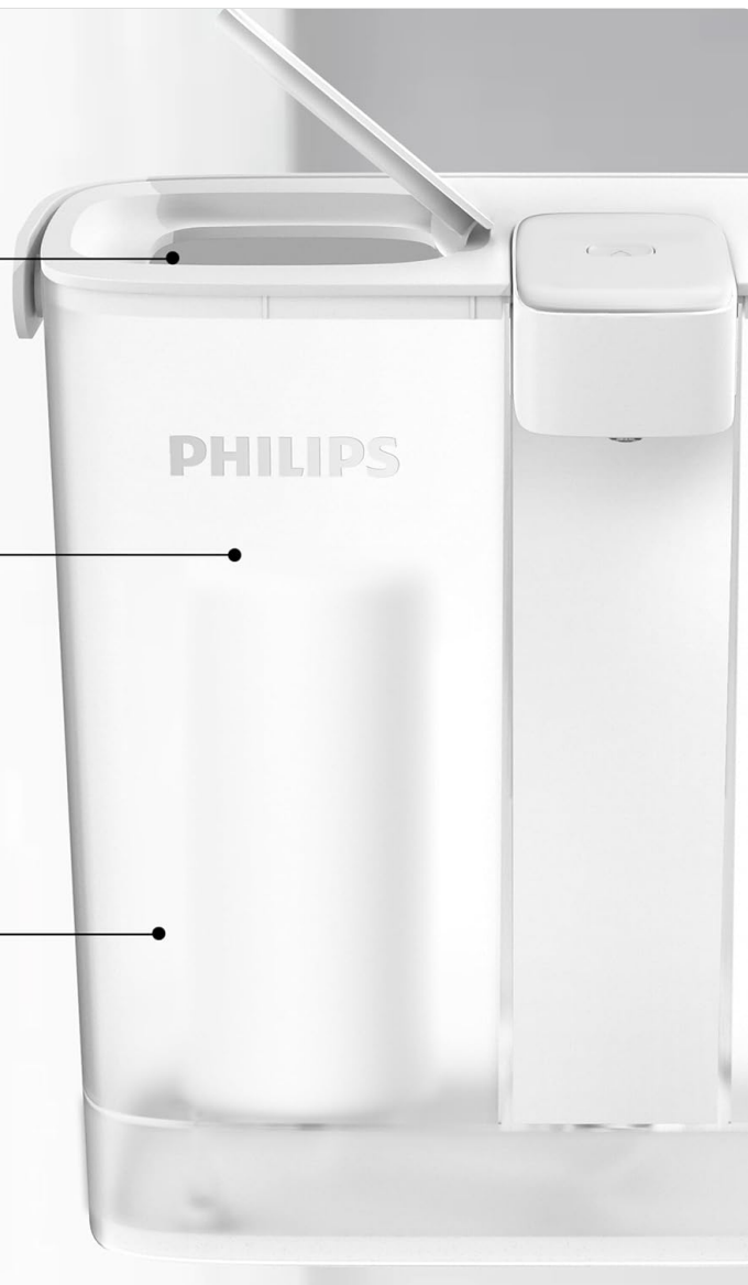
Image: Details of the pitcher's design, including the flip-top lid and BPA-free construction.