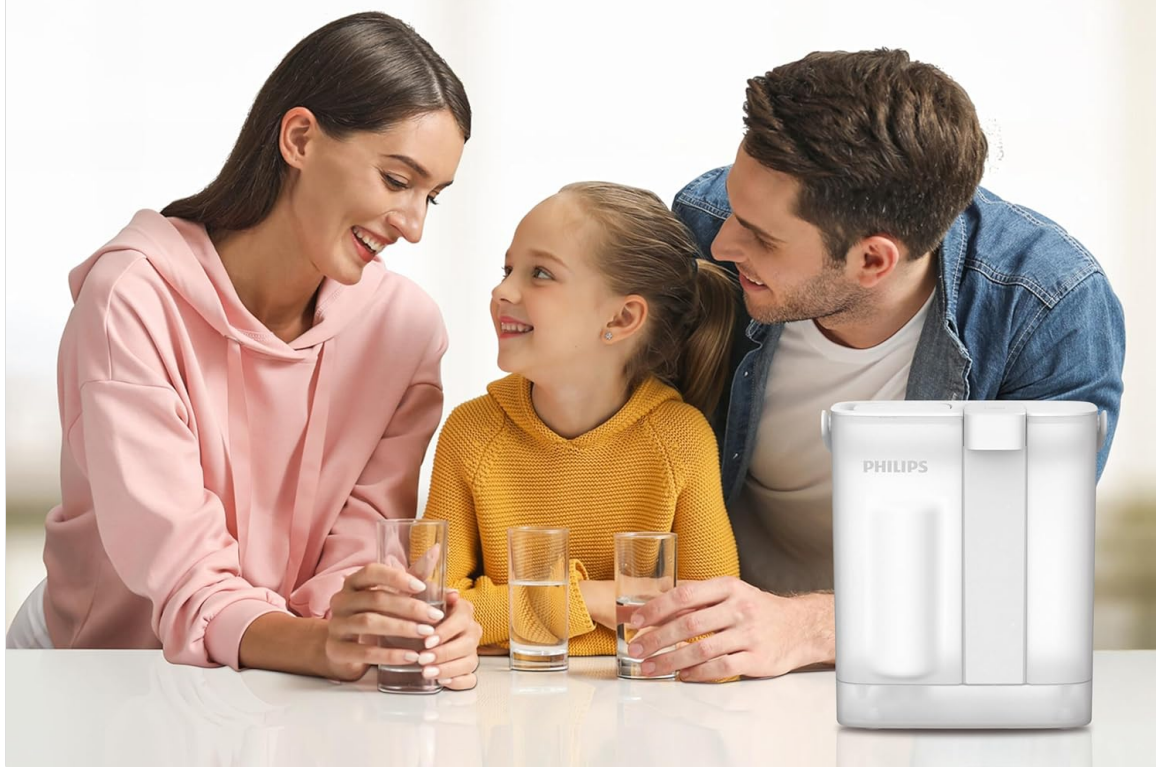
Image: The pitcher's large capacity is suitable for family use.