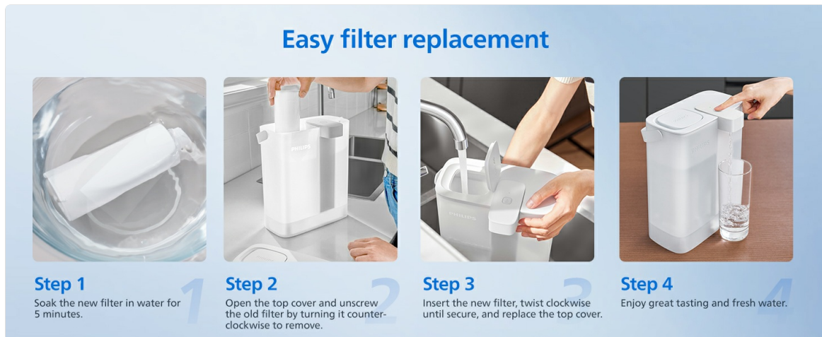
Image: Visual guide for easy filter replacement.

Video: Official Philips Water Filter Pitcher Charging Guide. This video demonstrates the proper way to charge the pitcher, ensuring the battery is ready for use.