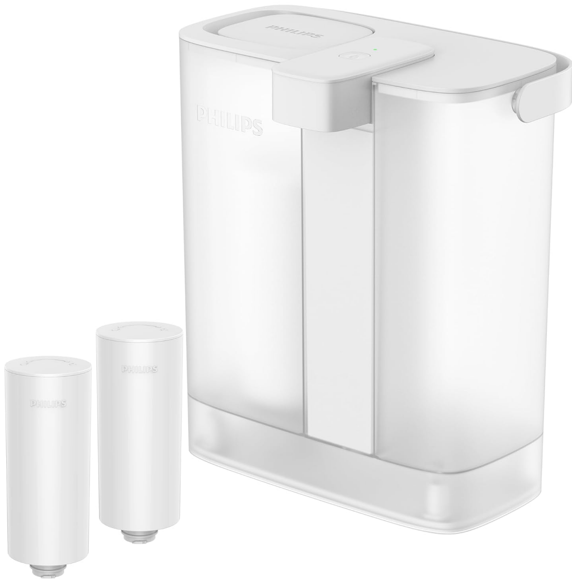
Image: The PHILIPS Water Filter Pitcher with two replacement filters.