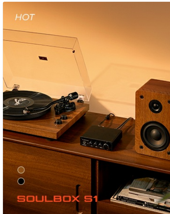
Image: A visual guide indicating support for 7-inch, 10-inch, and 12-inch vinyl records, along with the 33/45 RPM speed settings.