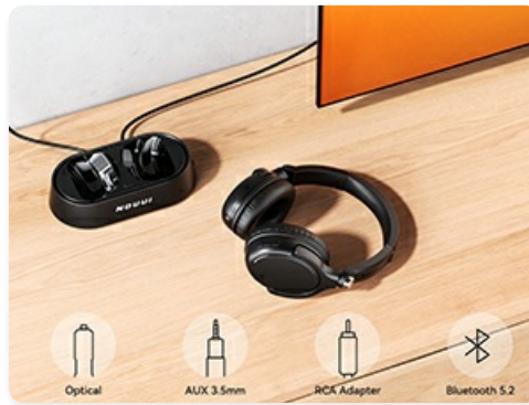
Image: Visual representation of the various audio input options for the transmitter.

Connect one end of the optical audio cable to the OPTICAL OUT port on your TV and the other end to the OPTICAL IN port on the transmitter. Ensure the protective caps are removed from the optical cable ends before insertion.