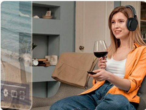
Image: Example of TV audio expert settings that may need adjustment for optimal performance.