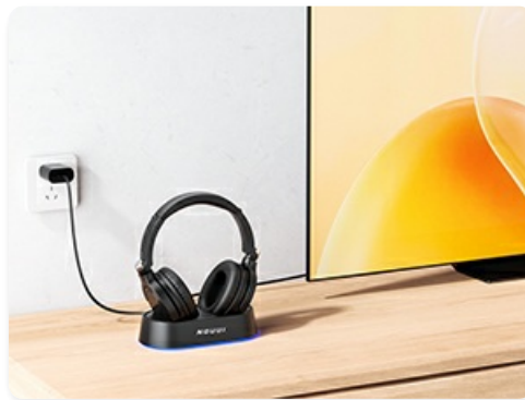
Image: The NOUUI headphones placed on their charging base, which is connected to a power source.

Before first use, fully charge the headphones. Place the headphones onto the transmitter charging base, ensuring the charging contacts align. The LED indicator on the headphones will show charging status. A full charge takes approximately 1.5 hours and provides up to 65 hours of use.