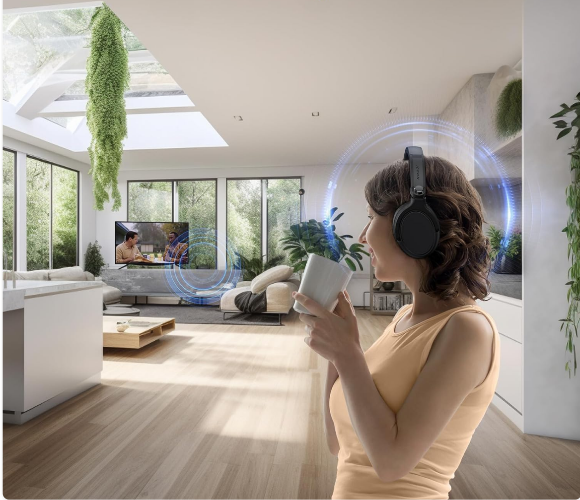
Image: The headphones provide a wide range, allowing movement without audio interruption or delay.

Enjoy ultra-low latency within extended 100ft / 30m range