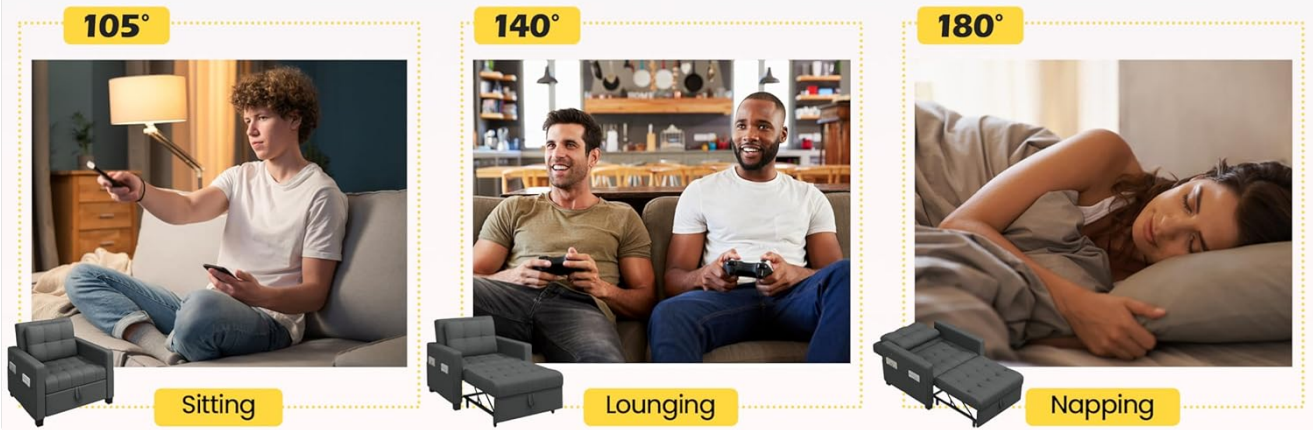
Figure 4.2: Three adjustable back positions.

This diagram visually explains how the backrest can be set to three different angles: 105 degrees for sitting, 140 degrees for lounging, and 180 degrees for napping or use as a bed.