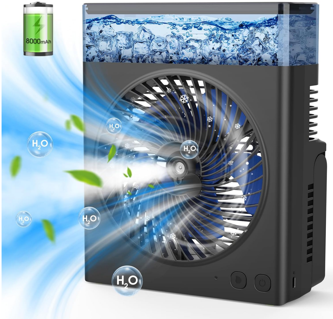
Figure 1: Front view of the Drchop P40 Misting Fan, illustrating its misting capability and compact design.