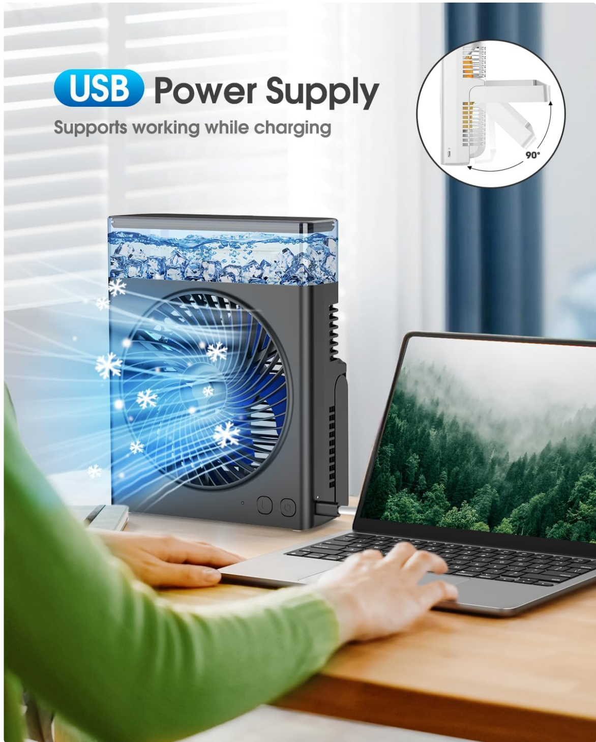
Figure 4: The fan connected via USB, demonstrating its ability to operate while charging.