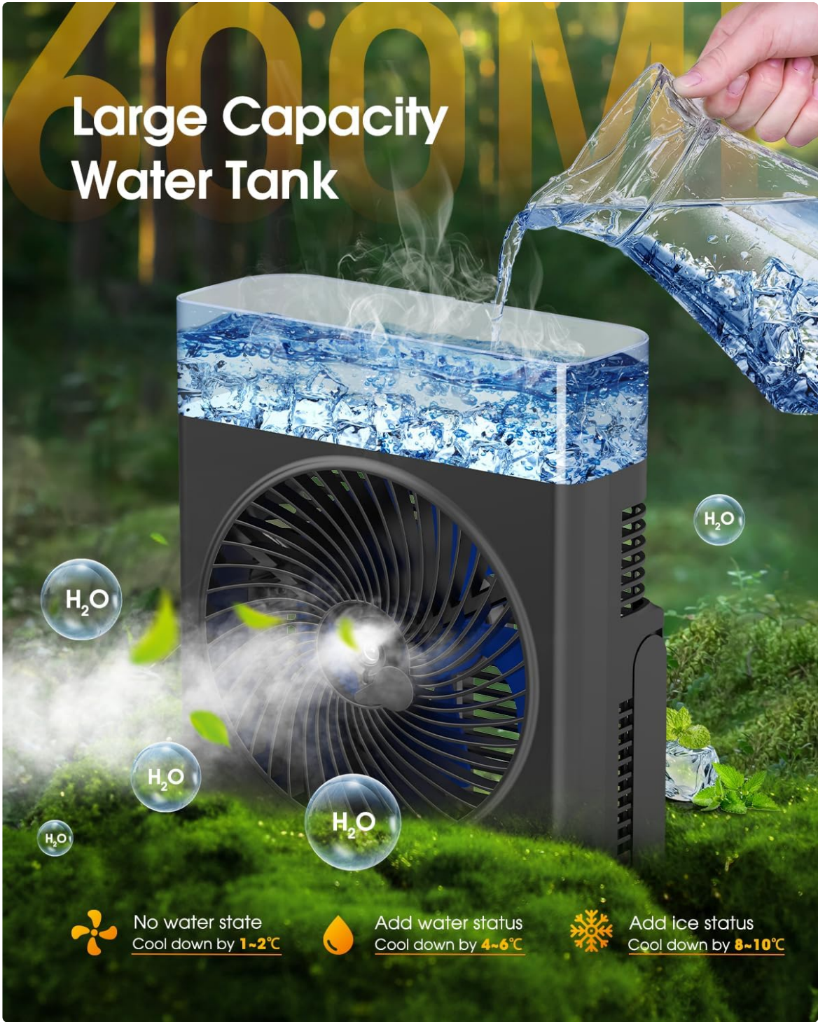
Figure 2: The 600mL large capacity water tank being filled, highlighting options for water or ice for enhanced cooling.