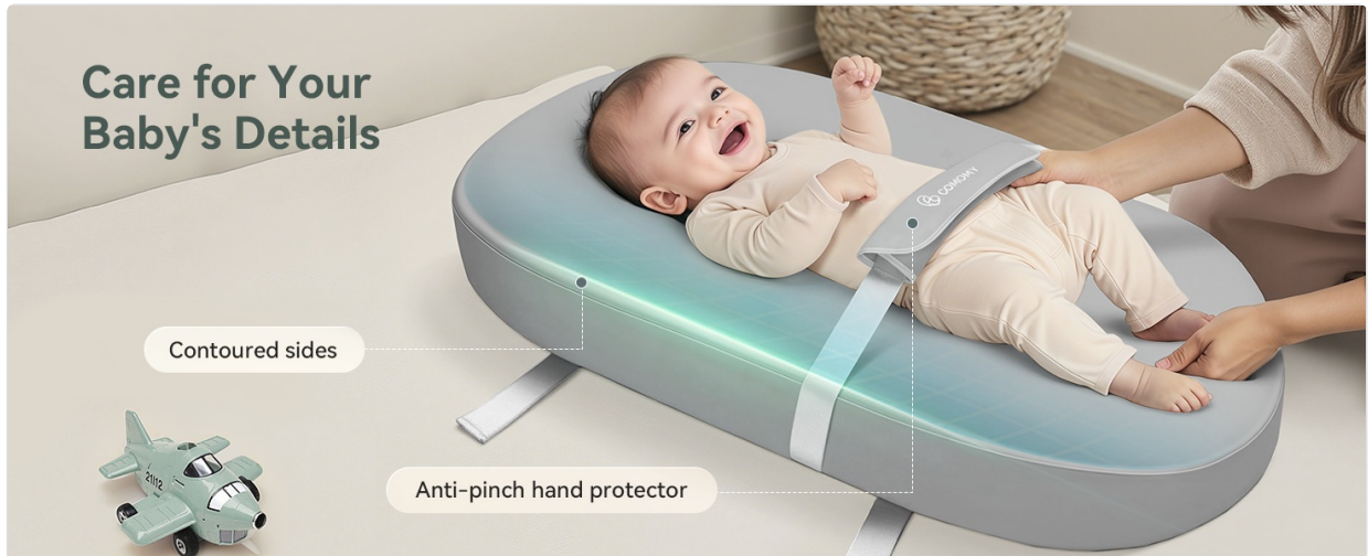
Text Description: A close-up view of the changing pad highlighting its contoured sides and an anti-pinch hinge protector, designed for baby's safety.