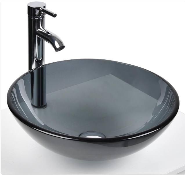
Image: A close-up of the Bluish Gray Glass Vessel Sink, showcasing its translucent material and modern design, paired with a chrome-finished faucet.