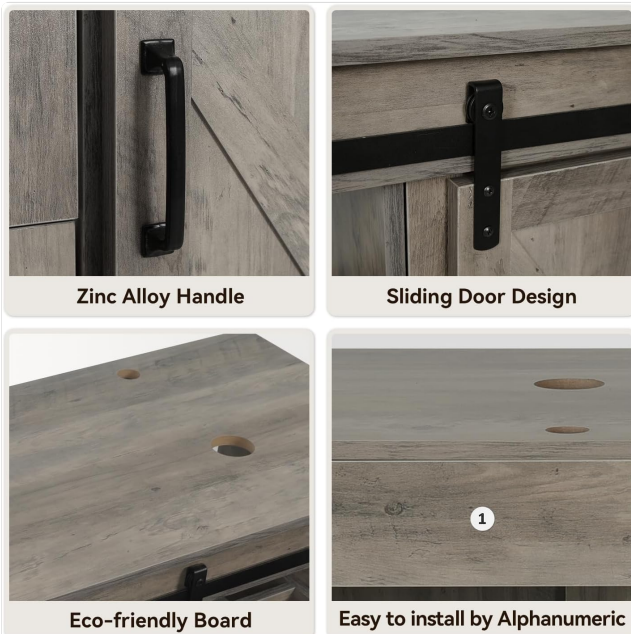
Image: Four detailed close-up images of the vanity. Top left shows the zinc alloy handle. Top right shows the smooth black rail and sliding barn door design. Bottom left shows the texture of the eco-friendly engineered wood board. Bottom right shows a detail with the number '1' indicating an alphanumeric installation step.