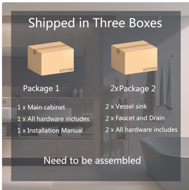
Image: Diagram illustrating the shipment of the vanity in three separate boxes. Package 1 contains the main cabinet, all hardware, and the installation manual. Package 2 (x2) contains the vessel sinks, faucets, drains, and associated hardware.