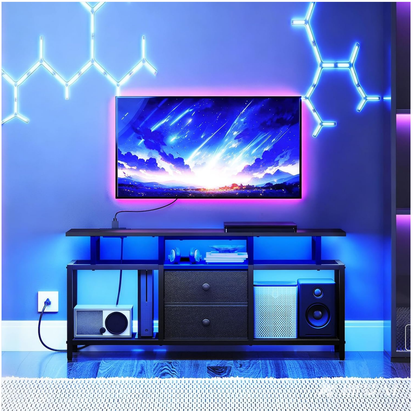
Image: The YATINEY TV Stand (Model DS03UDBB) with blue LED lighting, showcasing its design and storage capabilities for a television and various media devices.