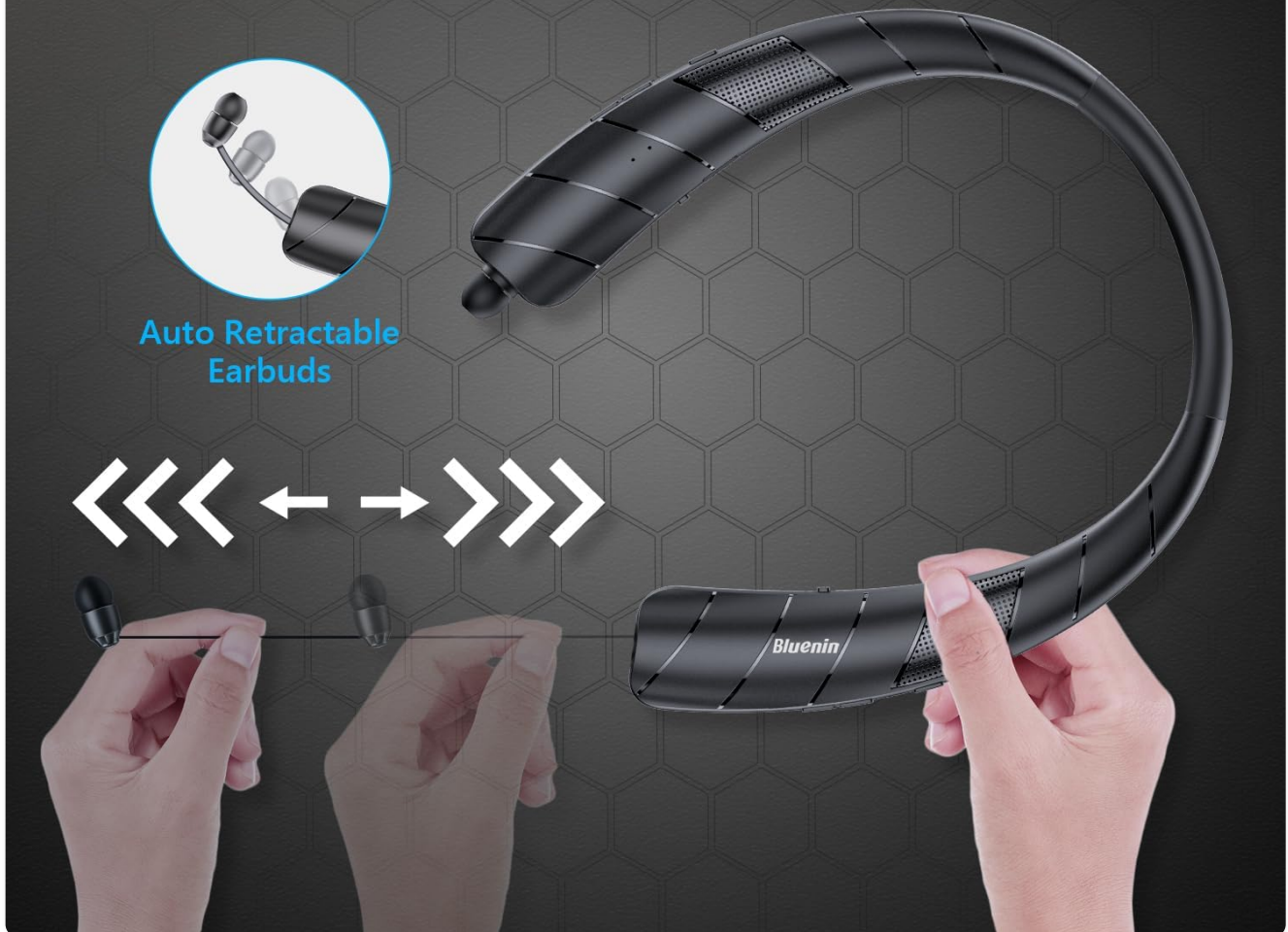
Image 4.2: Demonstration of the auto-retractable earbud mechanism.

5000+ Times Usage and Adjust Wire to the Length you Want