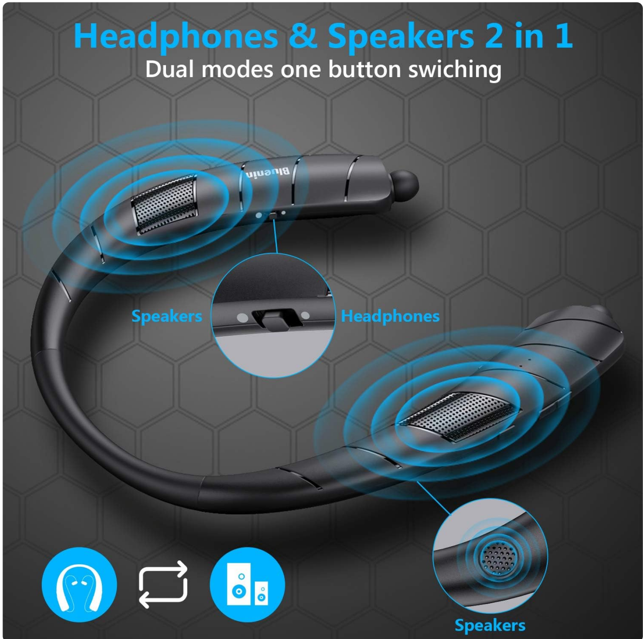
Image 4.1: Illustration of the 2-in-1 functionality, showing indicators for speaker and headphone modes.