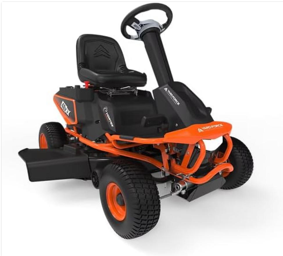
Image: The Yard Force 48V 38-Inch Electric Ride-On Lawn Tractor, showing its overall design and the location of the charging port cover.

Your browser does not support the video tag.