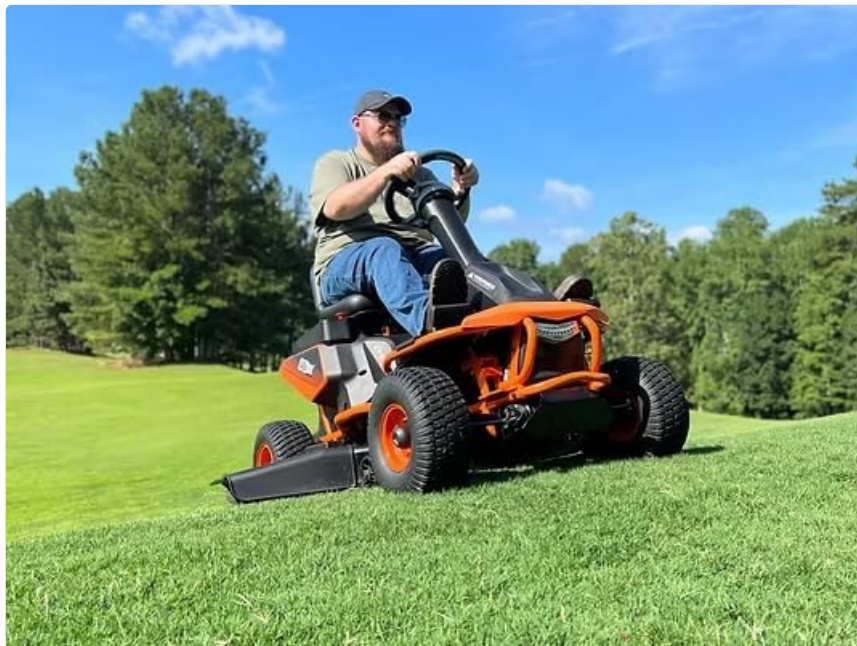
Image: A person operating the Yard Force lawn tractor, demonstrating its use for mowing a lawn, with an optional bagging kit attached.

Engage the forward or reverse gear using the selector. Release the parking brake and gently press the foot pedal to begin moving. For mowing, ensure the blades are engaged using the PTO (Power Take-Off) button. The mower supports mulching and side discharge functionalities.