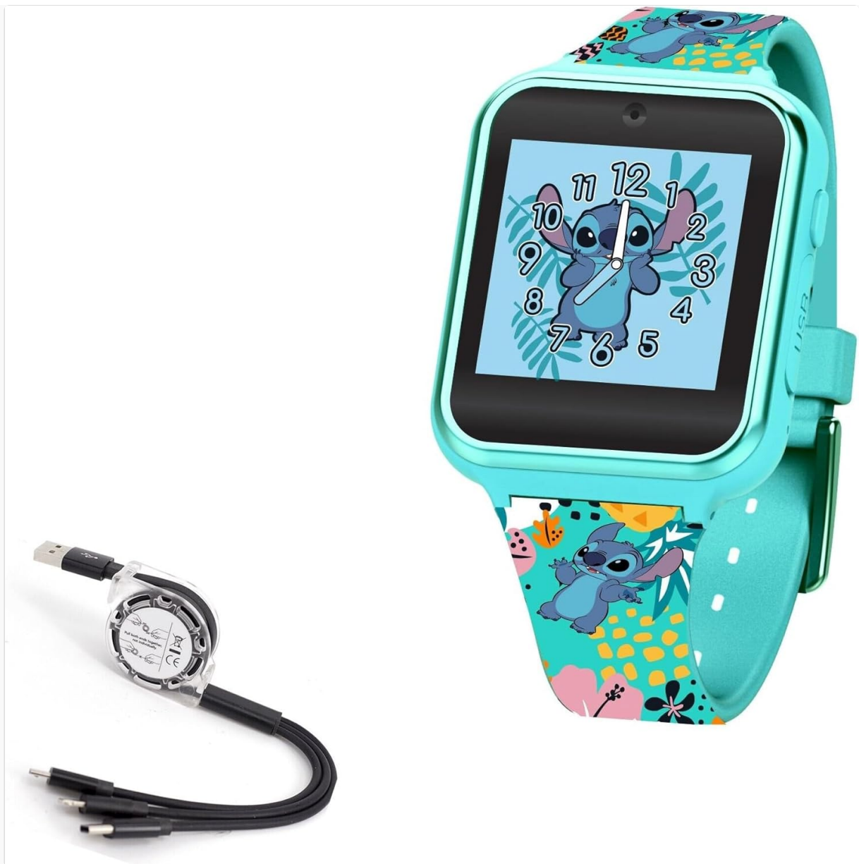
This image displays the BoxWave AllCharge miniSync Retractable USB Cable in its compact, retracted form, positioned alongside a smart watch to illustrate its intended use for charging and syncing various devices.