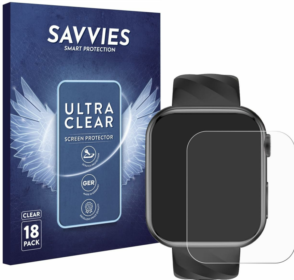
Image: Savvies screen protectors applied to a Marsyu MT500 smartwatch, demonstrating the precise fit.