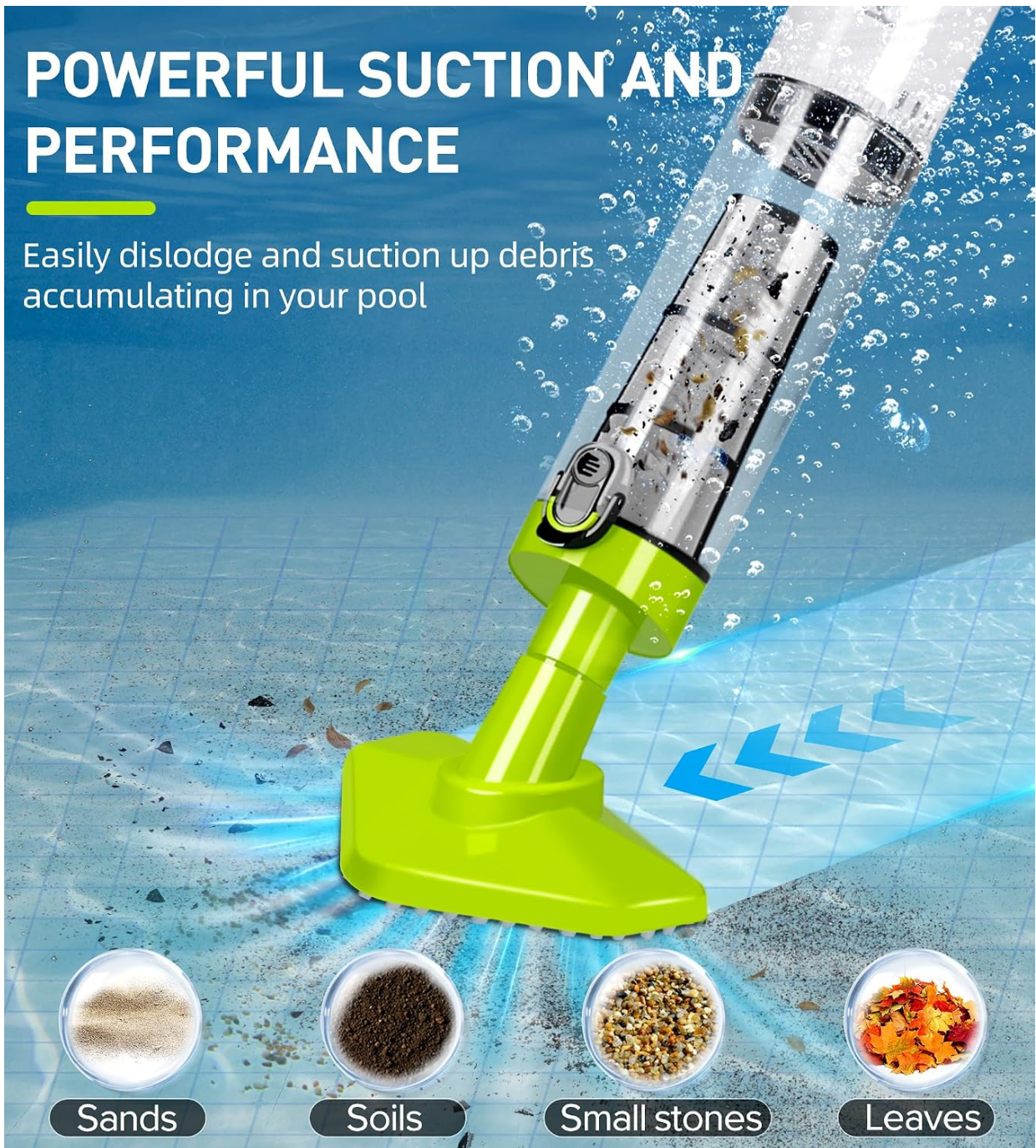
Figure 5: The KlrSwp 1822 vacuum in a pool, demonstrating its water-activated automatic start.

Easily dislodge and suction up debris accumulating in your pool