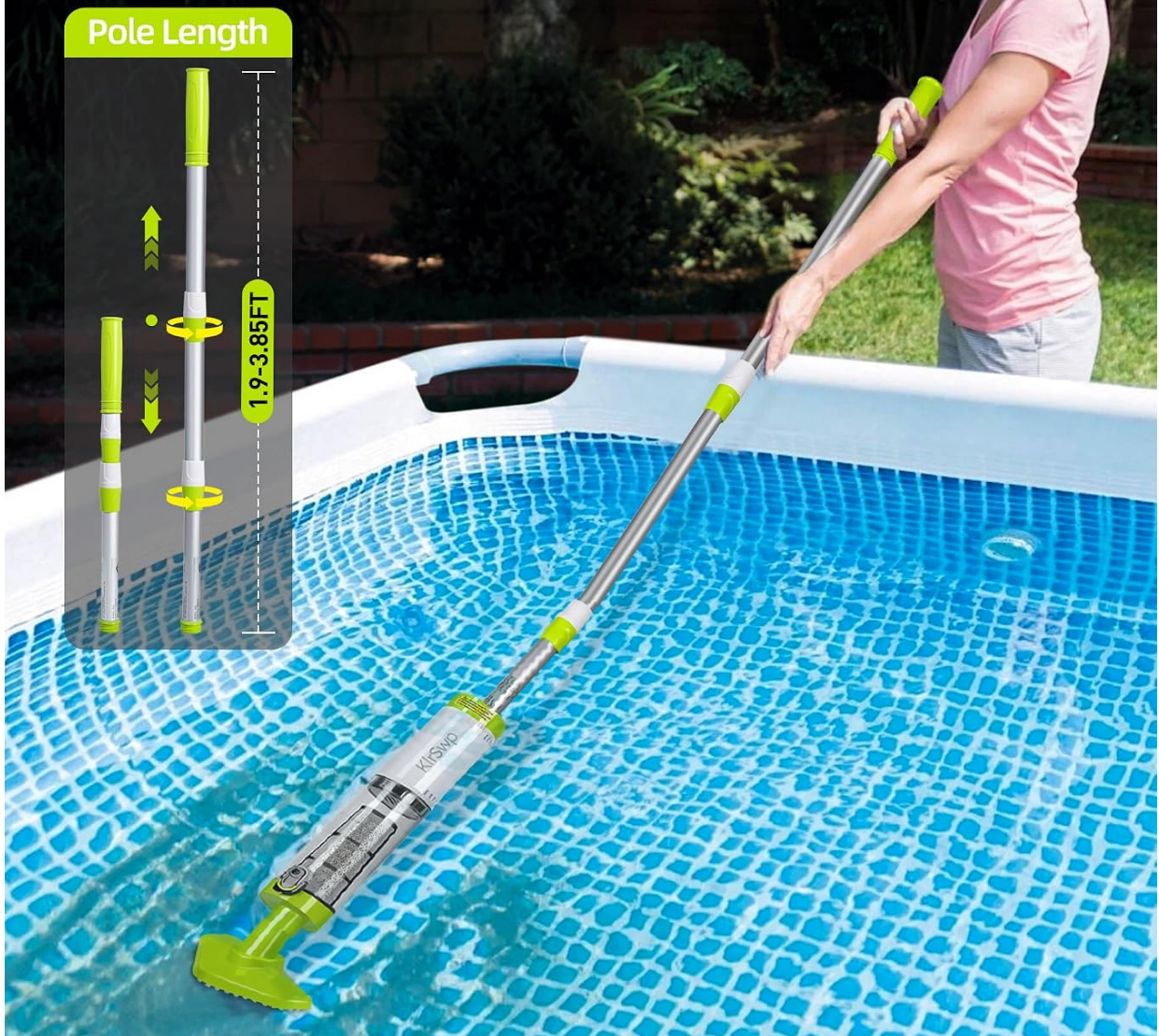
Figure 3: Demonstrating the adjustable length of the telescopic pole for flexible cleaning.

Adjust the length to providing flexibility for your pool cleaning