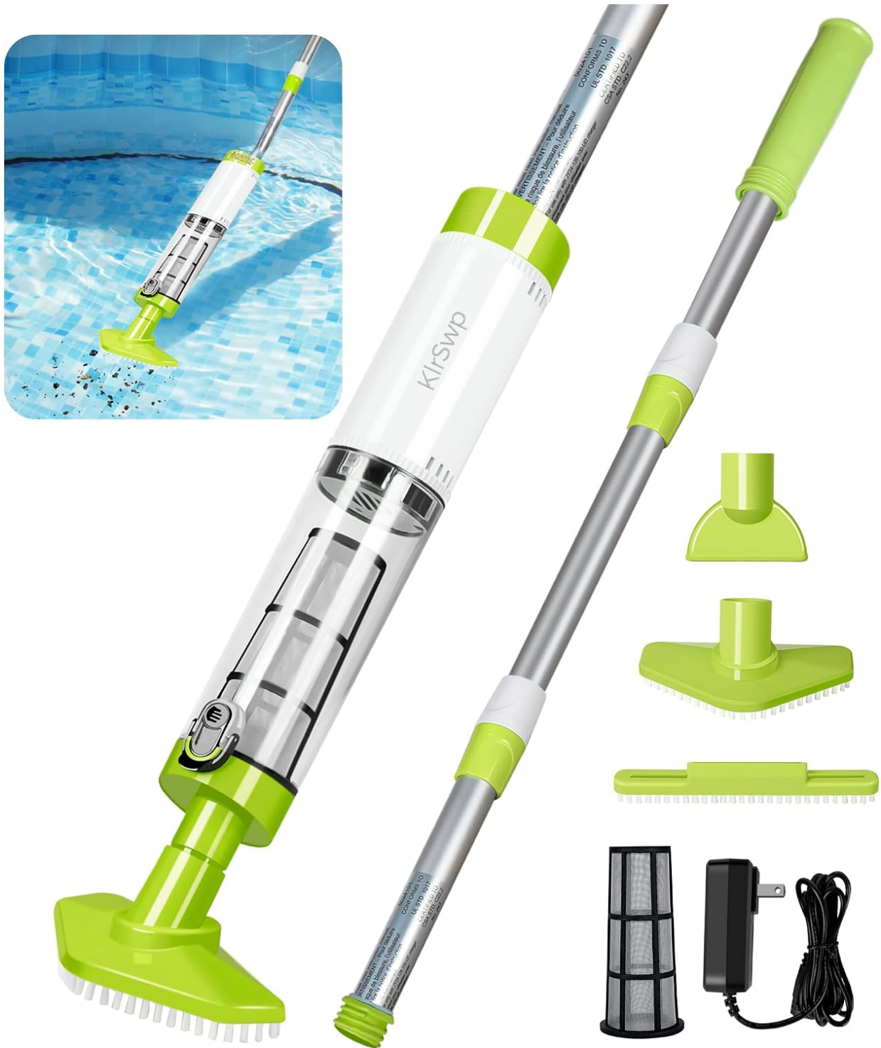
Figure 1: KlrSwp 1822 Handheld Cordless Pool Vacuum and included accessories.