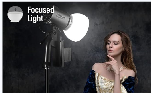
Image: Demonstrates the different lighting effects achievable by manipulating the flexible dome.

The primary function of the CRS6 is to soften direct light and reduce harsh shadows, resulting in more flattering and natural illumination for your subjects.