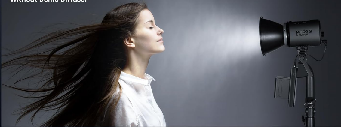
Image: A visual comparison showing the significant difference in light quality when using the diffusion dome versus direct flash.

The CRS6 is suitable for a wide range of photographic applications, from portraiture to product photography, enhancing the quality of light in various settings.