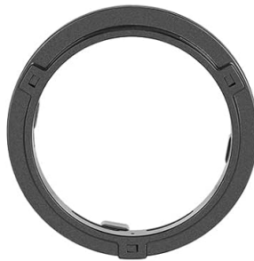
1 x NEEWER Mount Adapter Ring for Video Light