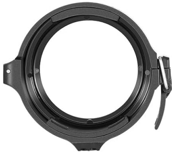
1 x Round Flash Head Adapter Ring