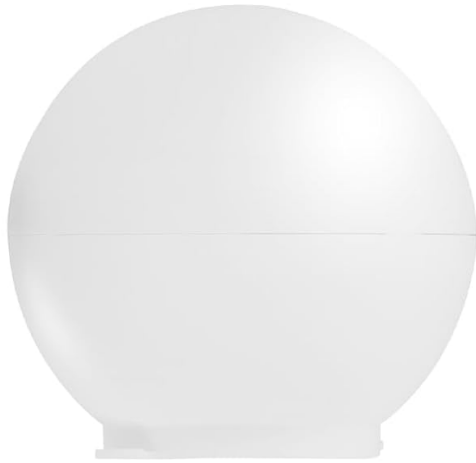
1 x Silicone Diffusion Dome