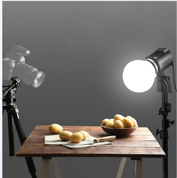
Image: Illustrates diverse scenarios where the CRS6 diffusion dome can be effectively utilized.