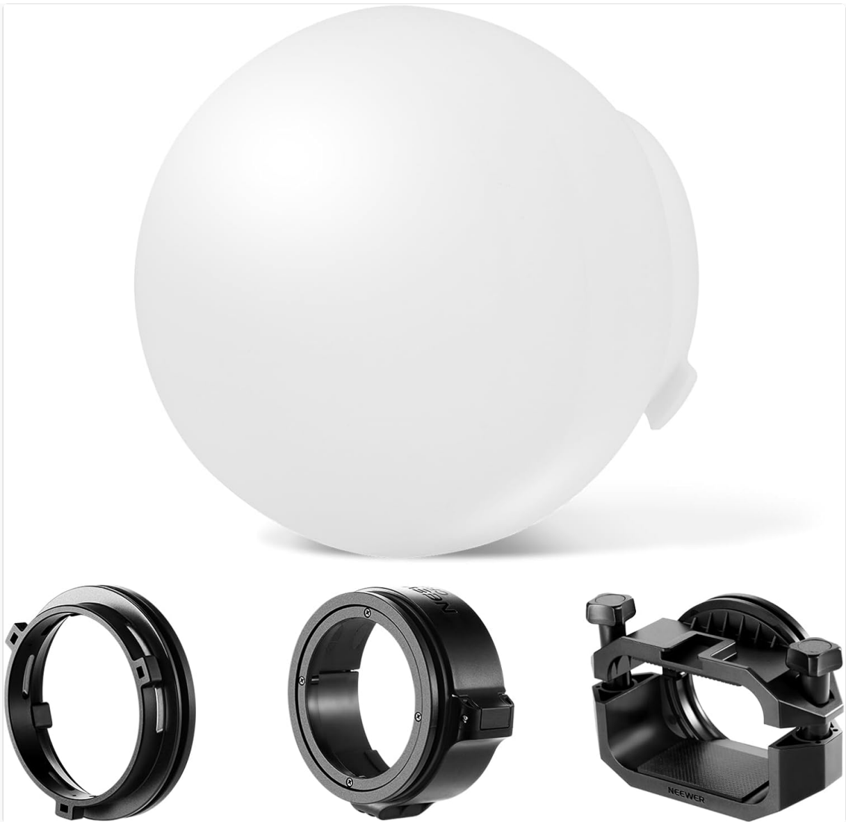
Image: The NEEWER CRS6 Softbox Diffusion Dome shown with its three versatile adapter rings.