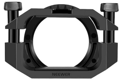
1 x Square Flash Head Adapter Ring

Image: The diffusion dome's soft and flexible material allows for easy folding and compact storage.