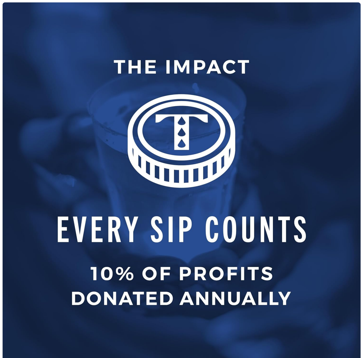
Image: A blue graphic with a white coin-like icon featuring a 'T' and water drops, stating 'THE IMPACT' and 'EVERY SIP COUNTS' with '10% OF PROFITS DONATED ANNUALLY'.

TREVI is committed to making a positive impact; 10% of all profits are donated to non-profit partners annually. Every sip counts towards this mission.