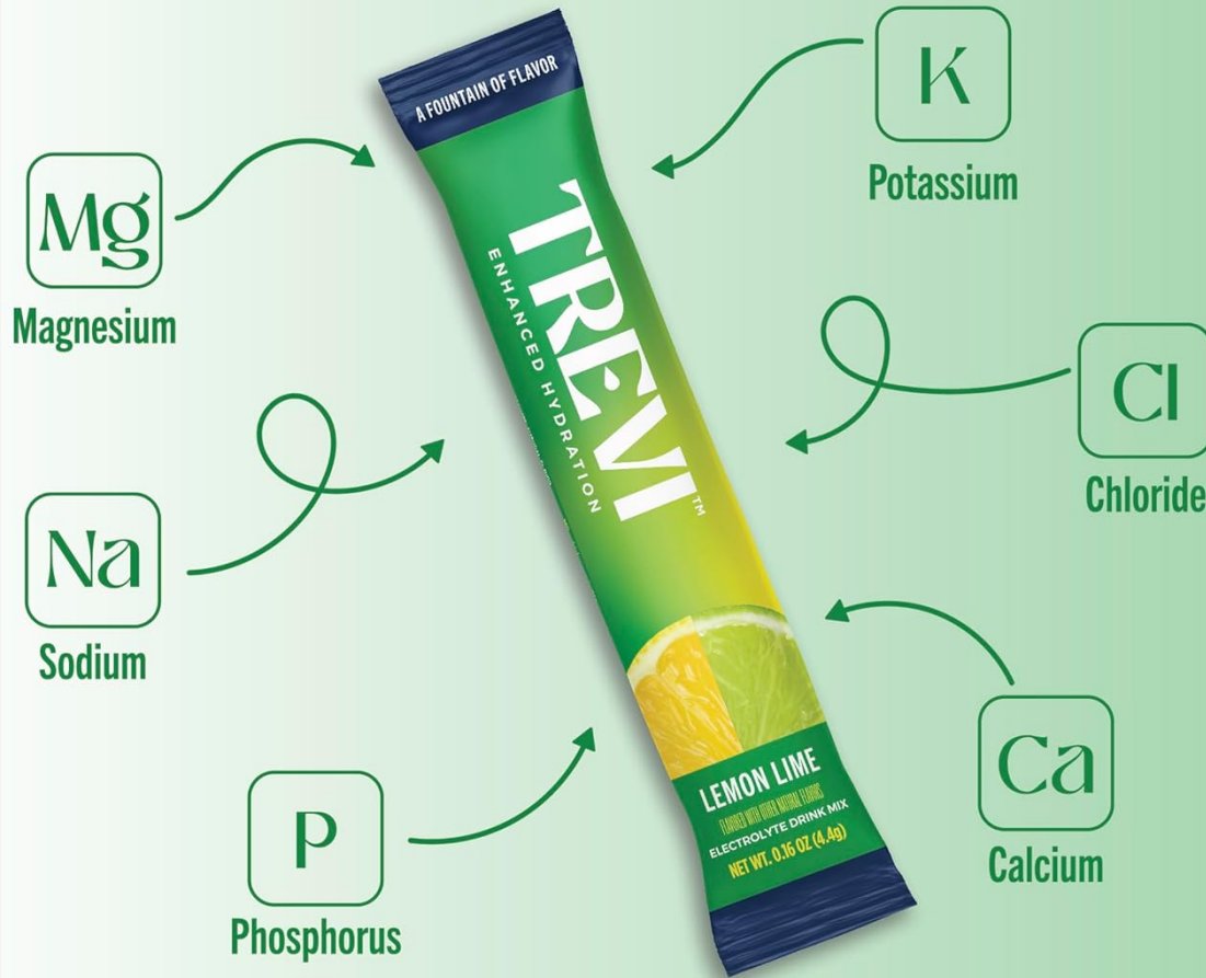
Image: A visual representation highlighting the 6 key electrolytes present in TREVI: Magnesium (Mg), Sodium (Na), Phosphorus (P), Potassium (K), Chloride (Cl), and Calcium (Ca), with a TREVI packet in the center.

Designed for hydration, muscle recovery, and sustained energy.