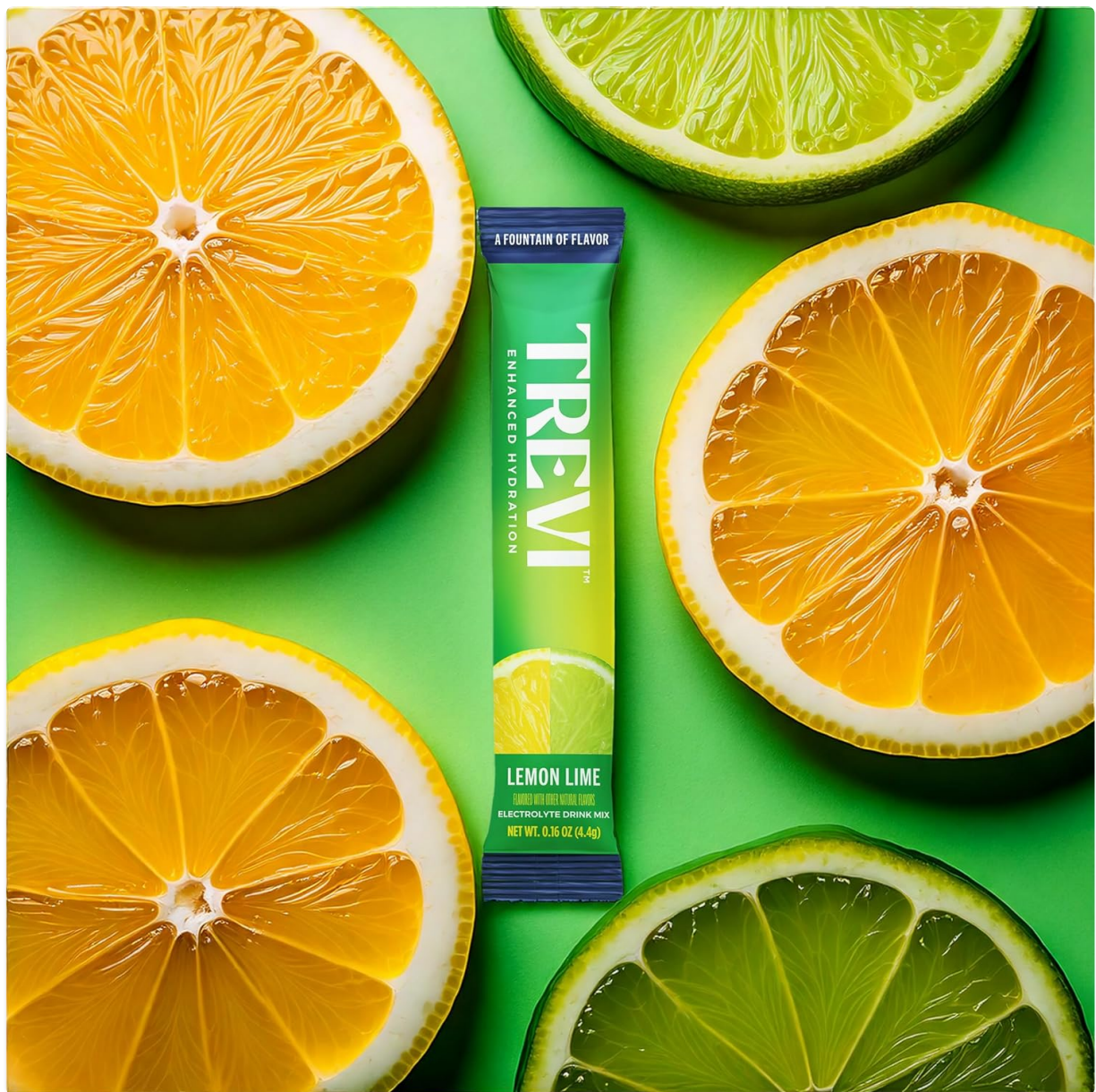
Image: A single TREVI Lemon Lime electrolyte packet positioned centrally, surrounded by vibrant green lime slices and yellow lemon slices on a bright green background.

Each packet contains essential electrolytes such as Sodium, Potassium, and Magnesium, along with Vitamin C and Pink Himalayan Salt. The formula is sugar-free, non-GMO, allergen-free, vegan, and contains no artificial preservatives or coloring.