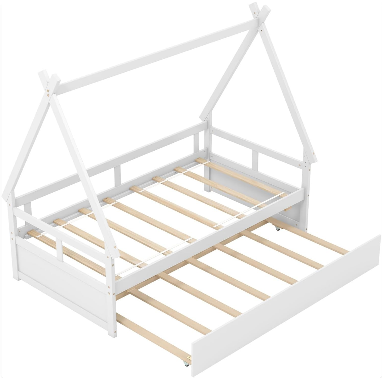
Image 4.1: The bed frame and trundle assembled, ready for mattresses.