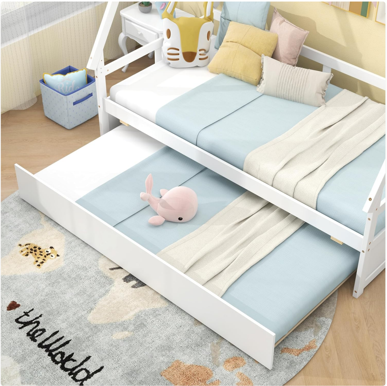
Image 5.2: The trundle bed extended, showing its functionality as an additional sleeping surface.