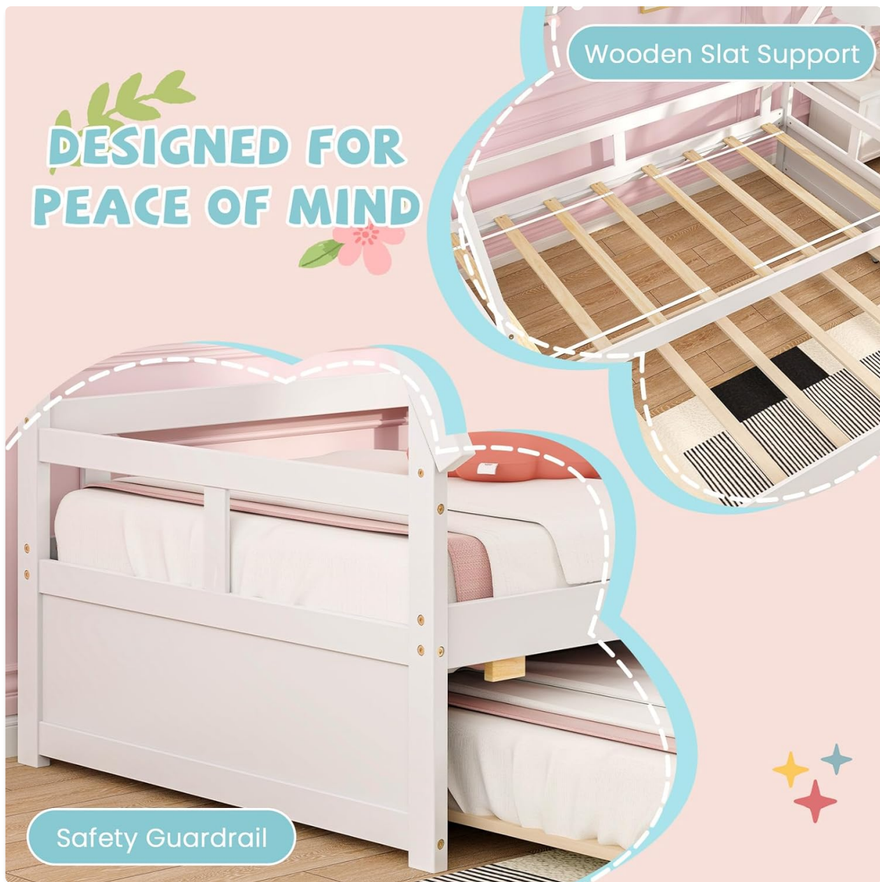
Image 2.1: Detail of the wooden slat support system and the integrated safety guardrail.