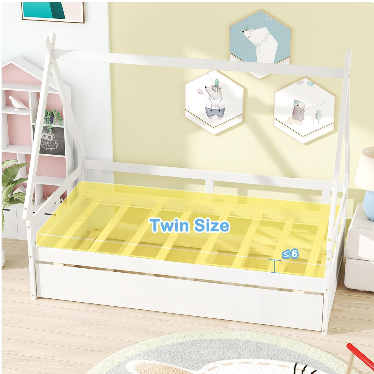
Image 5.3: Visual guide for the twin mattress area, indicating maximum mattress thickness.