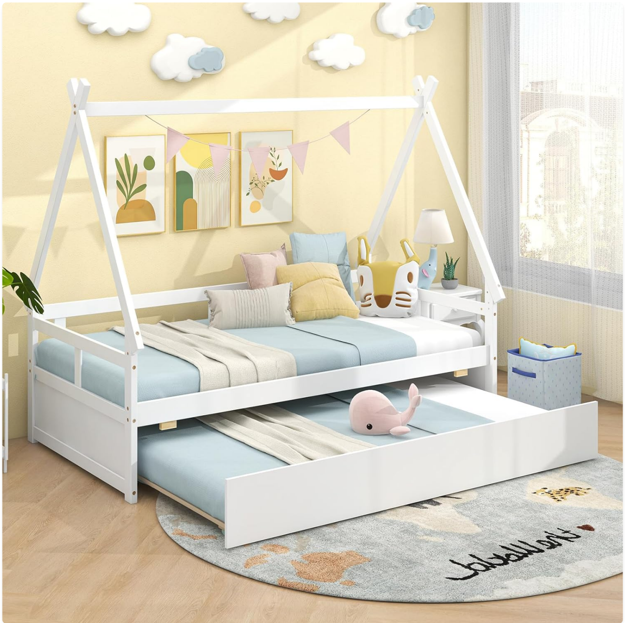
Image 1.1: Fully assembled Giantex Twin House Bed with Trundle, showcasing its design and functionality.