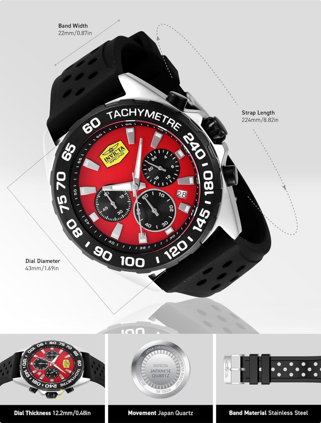
Image: Detailed diagram of the Invicta Racing watch showing key dimensions such as dial diameter, band width, strap length, and dial thickness.