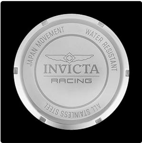
Image: Close-up view of the watch's stainless steel case back, detailing the 'Invicta Racing' engraving and 'Japan Movement' inscription.

service performed by a qualified watch technician to ensure proper sealing and water resistance.