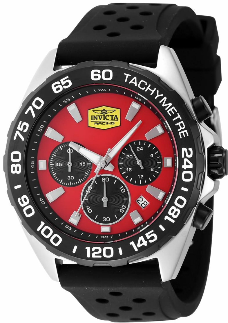
Image: Invicta Racing Men's 43mm VD53 Quartz Watch with a black and red dial, worn on a wrist.