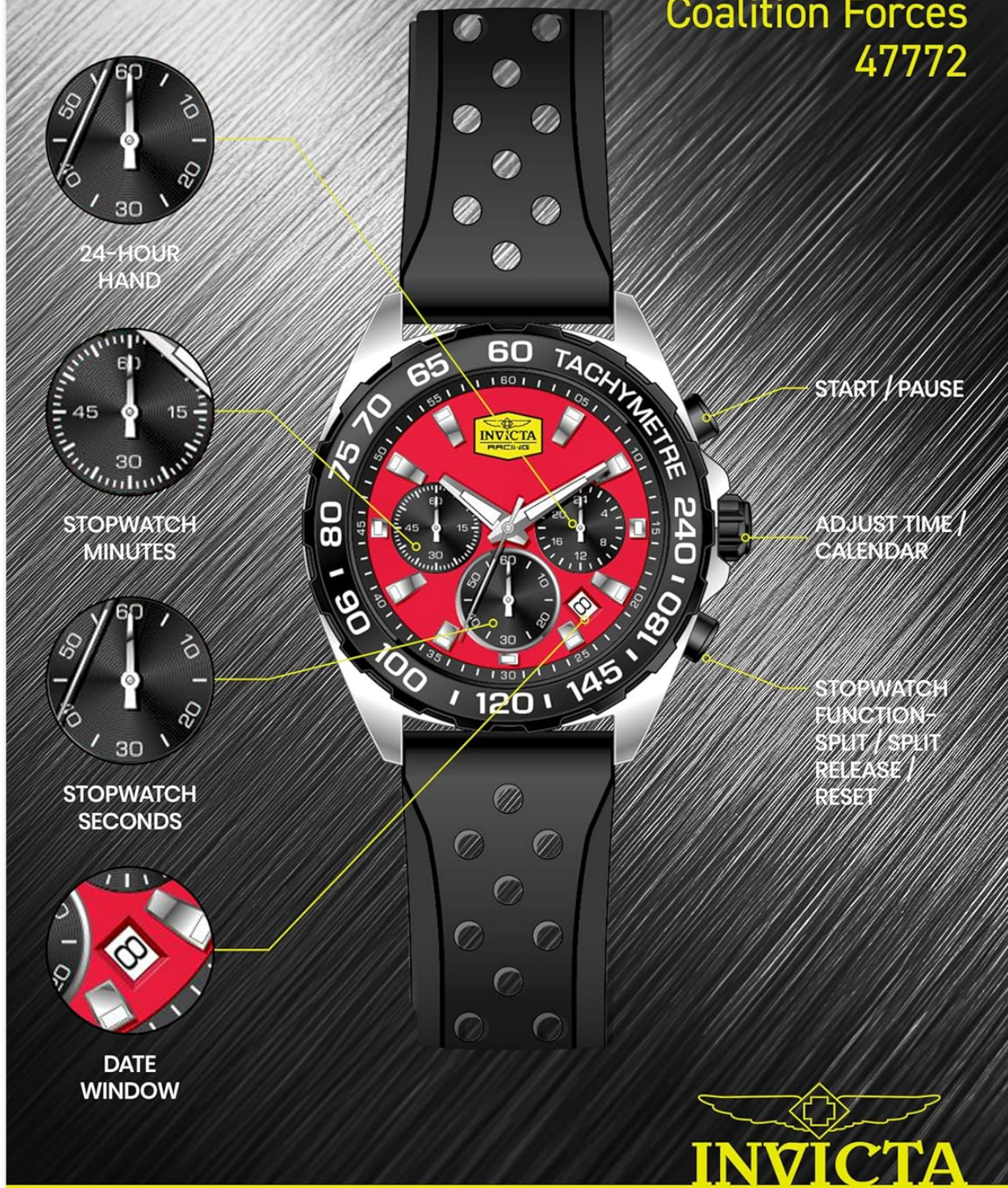
Image: Diagram illustrating the various functions of the Invicta Racing watch, including the start/pause button, adjust time/calendar crown, stopwatch function buttons, 24-hour hand, stopwatch minutes, stopwatch seconds, and date window.