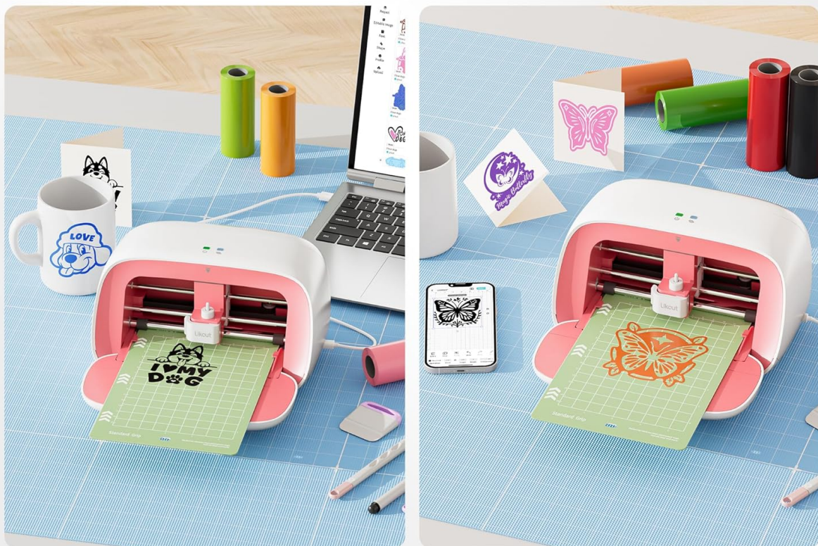
Image: Demonstrates the two connection methods for the LIKCUT Glee S501: via USB to a laptop and wirelessly to a smartphone/tablet.