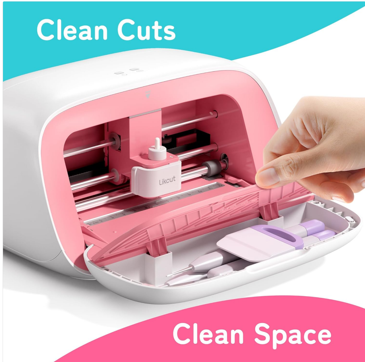
Image: Close-up view of the LIKUT Glee S501's integrated storage compartment, holding small crafting tools.