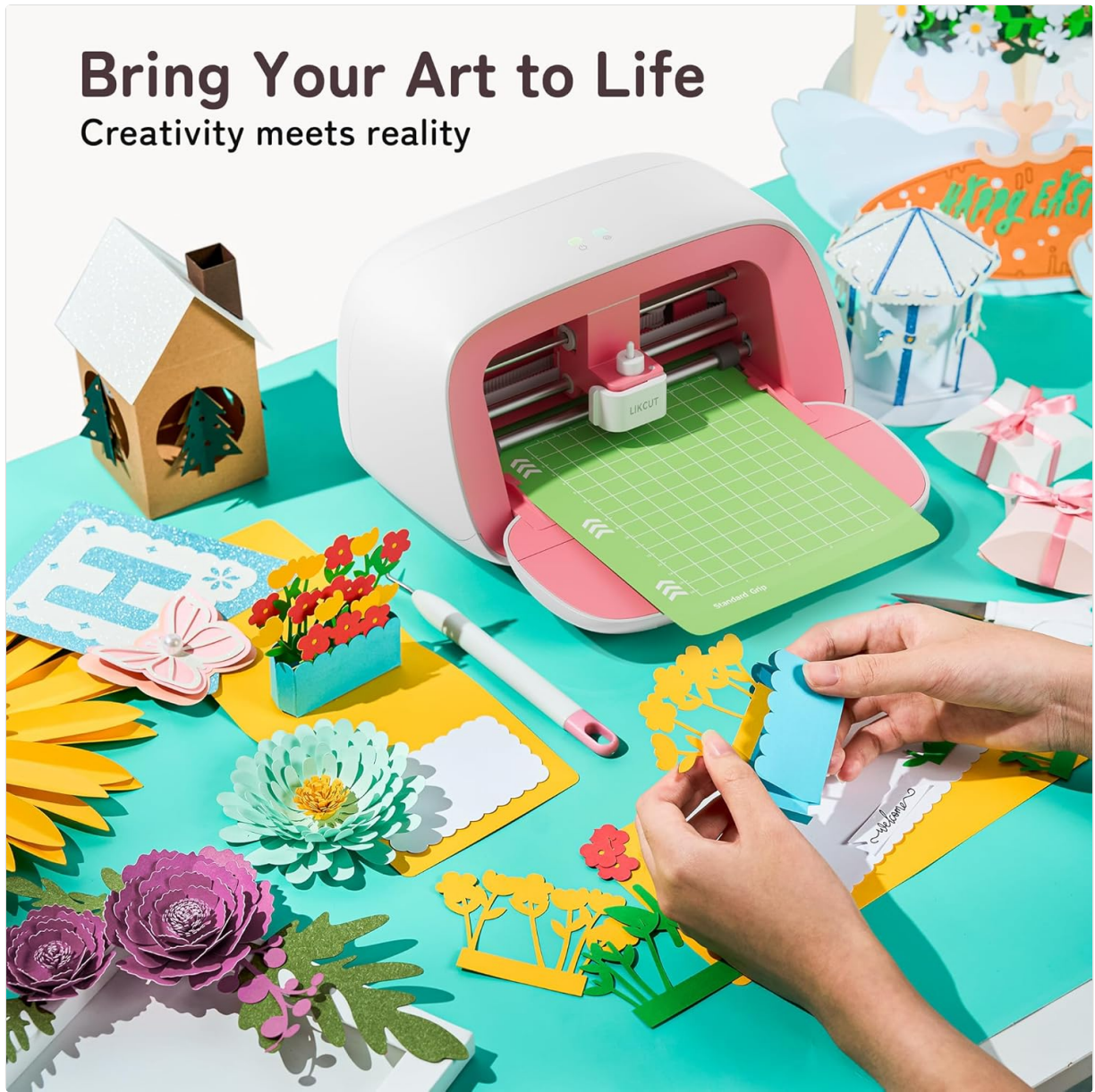
Image: The LIKUT Glee S51 actively cutting a design on a green mat, surrounded by various finished paper crafts, demonstrating its use in creating art.