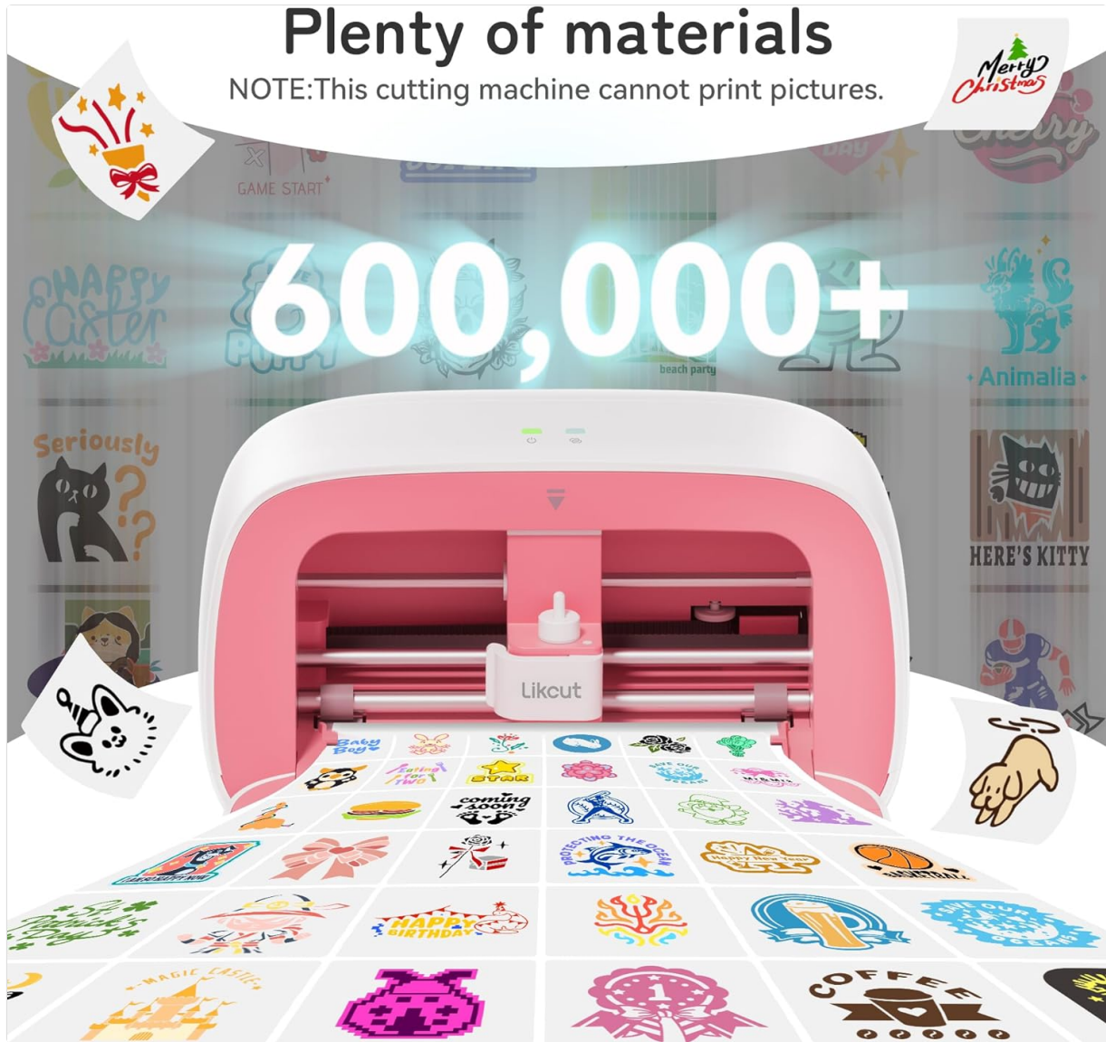
Image: A visual representation of the LIKCUT Design Store application interface, showcasing numerous design options available for cutting.

NOTE: This cutting machine cannot print pictures.