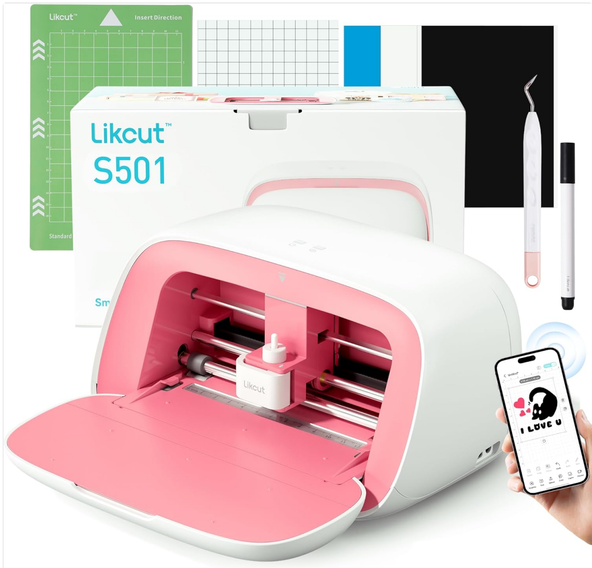
Image: The LIKCUT Glee S501 Vinyl Cutter Machine in pink and white, shown with its accessories and a smartphone

The LIKCUT Glee S501 is a compact and portable smart cutting machine designed for various crafting projects. It features a precise cutting mechanism and a convenient storage compartment for tools.