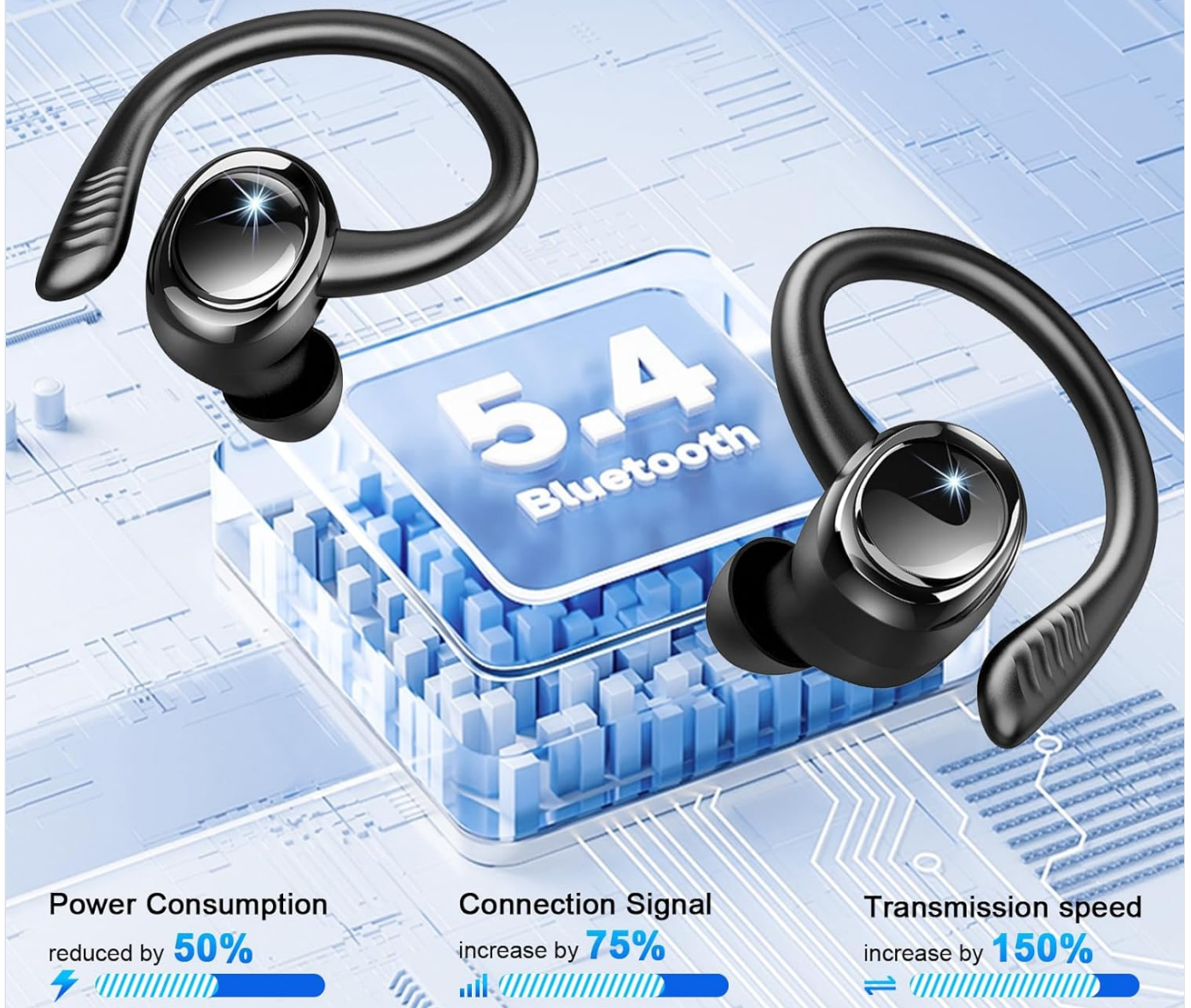
Figure 3: Benefits of upgraded Bluetooth 5.4, including reduced power consumption, increased connection signal, and faster transmission speed.

Bluetooth 5.4 technology enables more stable connections with lower power consumption