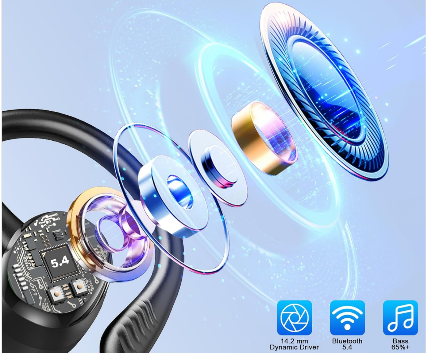
Figure 2: Illustration of the 14.2mm dynamic drivers delivering 3D Hi-Fi stereo sound.

14.2 mm speakers deliver powerful stereo sound to immerse you in an unparalleled listening experience