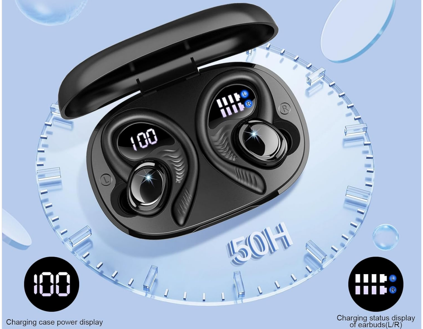
Figure 4: The charging case displaying battery life for both the case and individual earbuds.