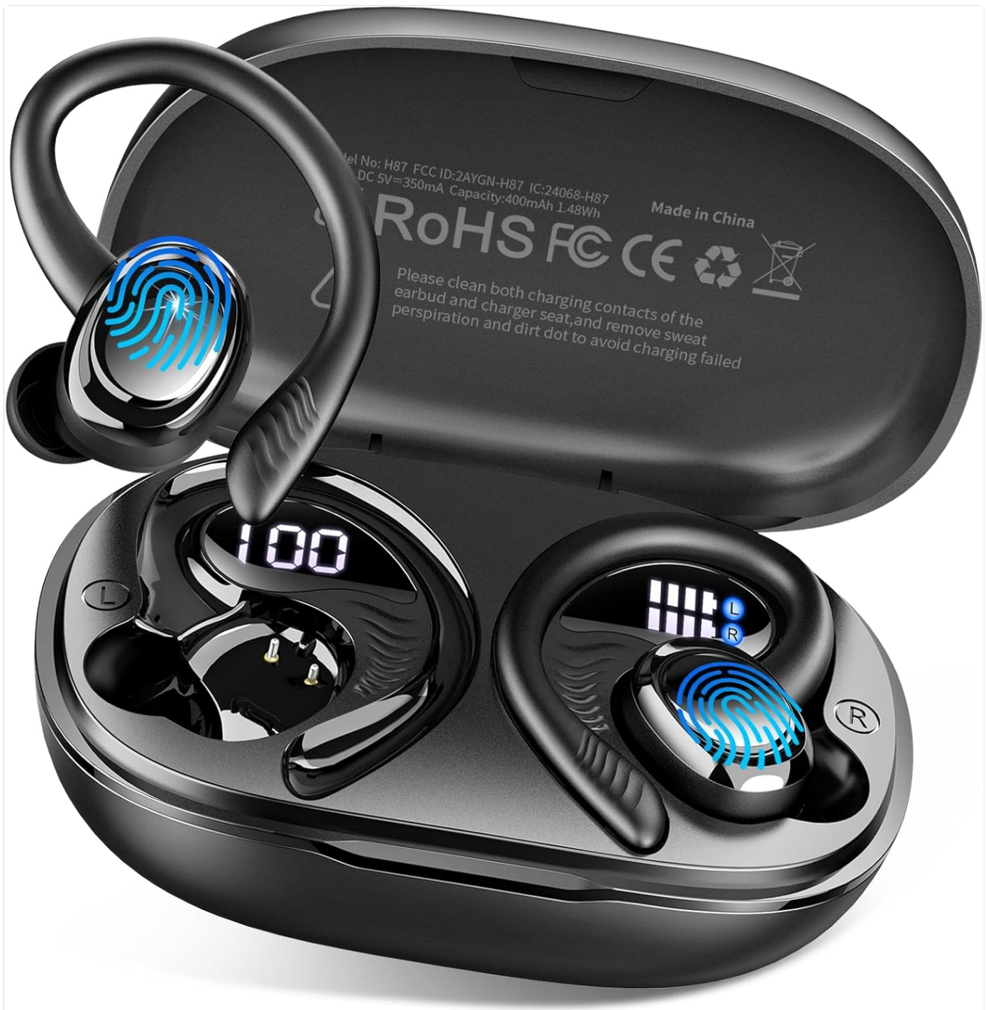
Figure 1: Hupoaf H87 Wireless Earbuds in their charging case, displaying battery levels.