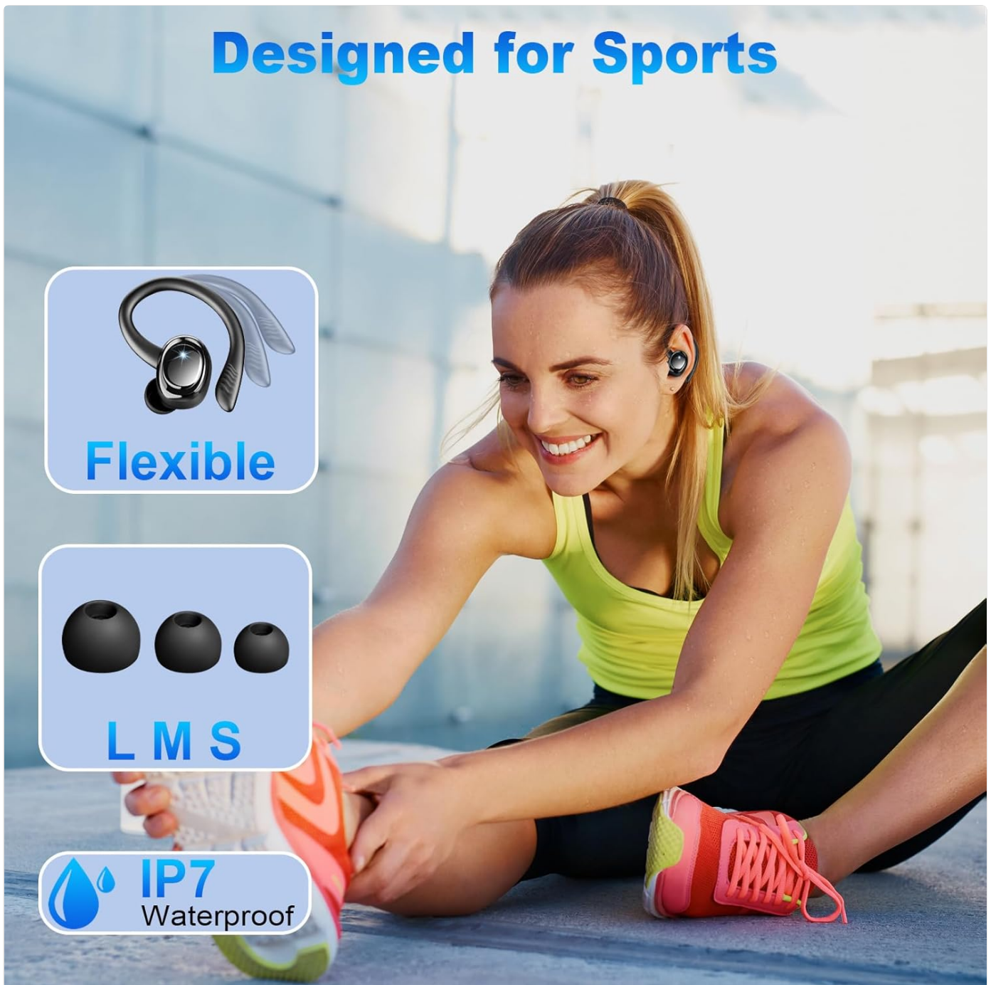
Figure 6: The ergonomic design of the earbuds with flexible earhooks and various ear tip sizes for a secure fit during sports.