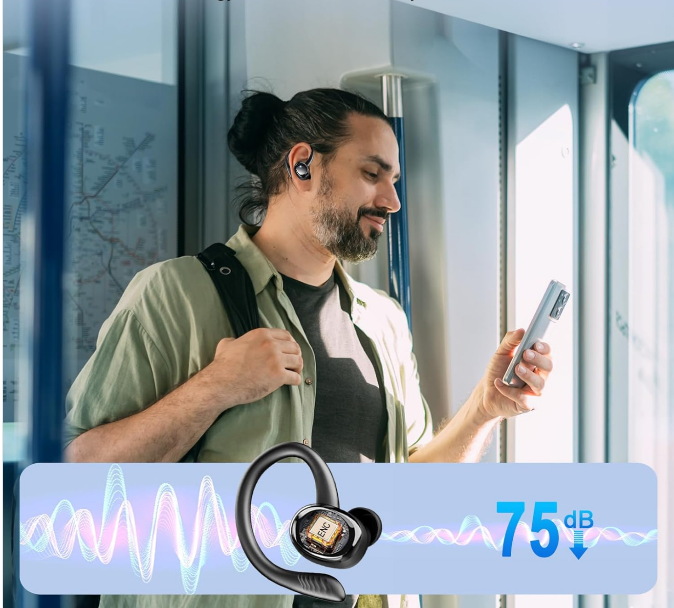
Figure 7: Demonstrating the ENC call noise canceling feature in a noisy environment.

Technology with 4 HD mics for crystal clear calls