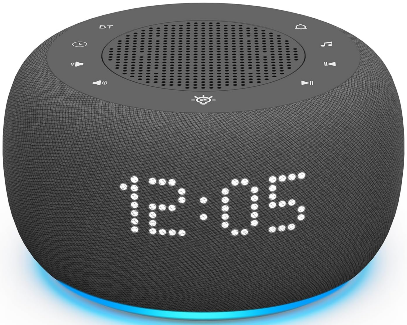
Figure 1: Front view of the Buffbee Pro 2nd Gen, displaying the digital clock and ambient light.