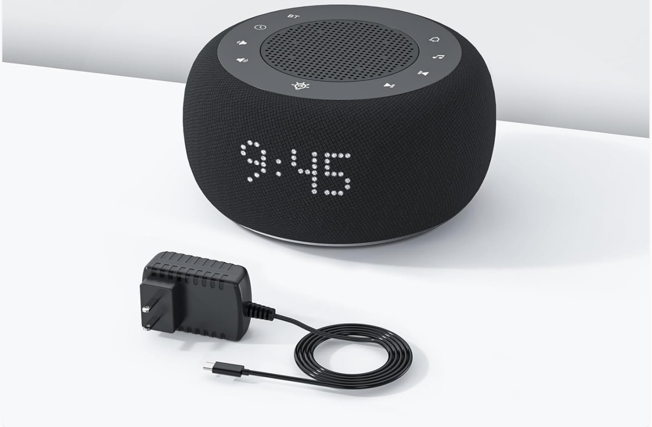
Figure 2: The complete package, including the device, power adapter, and USB-C cable.