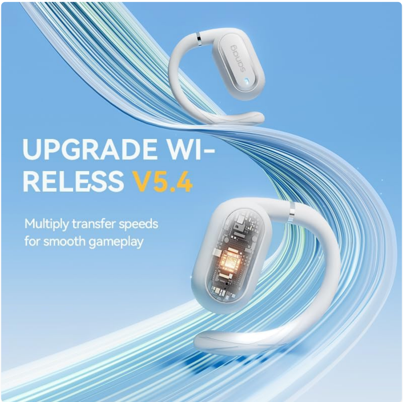
Image: The SANAG G36S earbuds showcasing the upgraded Wireless V5.4 technology, which provides faster transfer speeds for smooth audio and gaming.