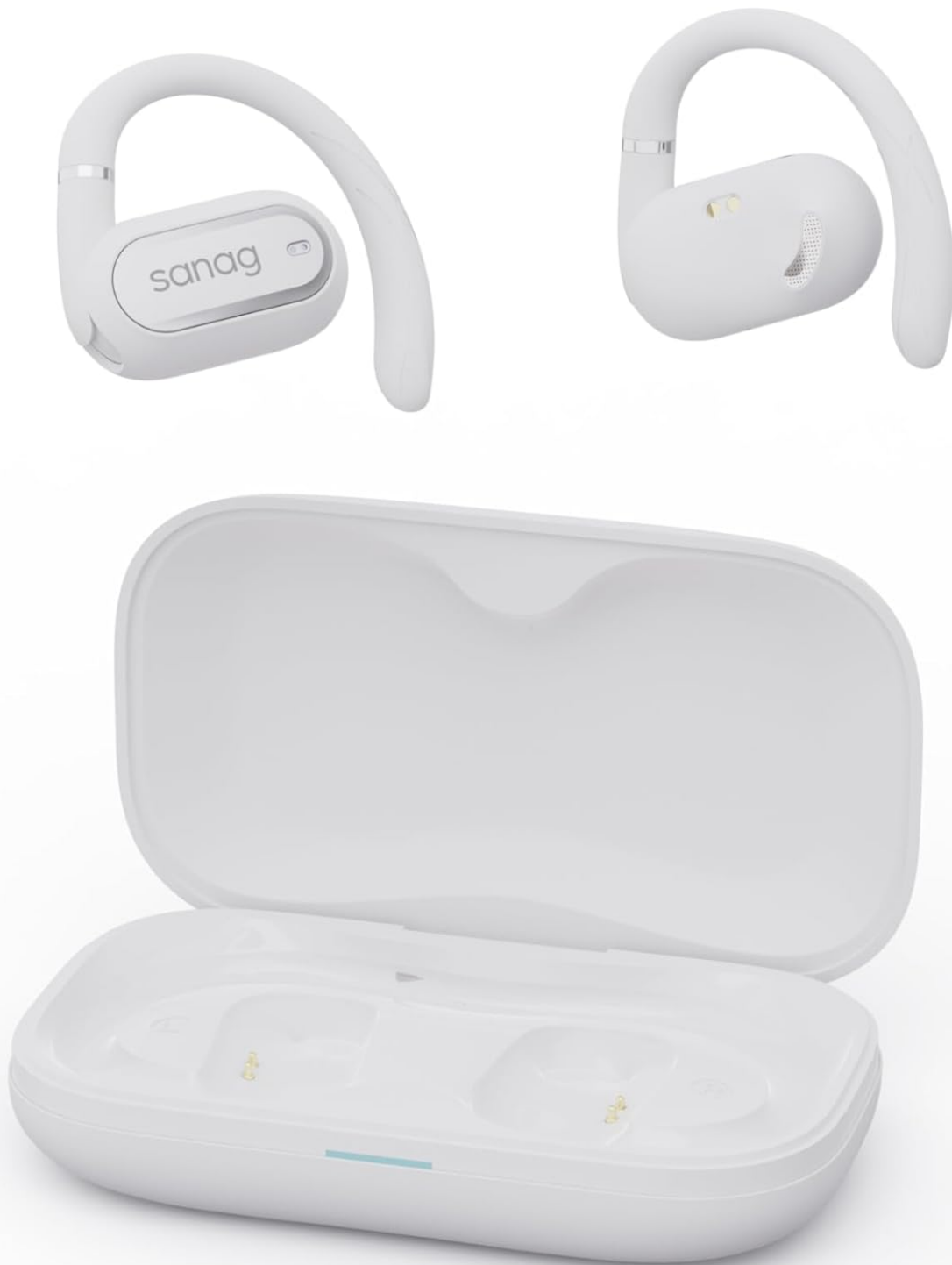
Image: The SANAG G36S Open Ear OWS Wireless Earbuds and their charging case, showing the complete product package contents.