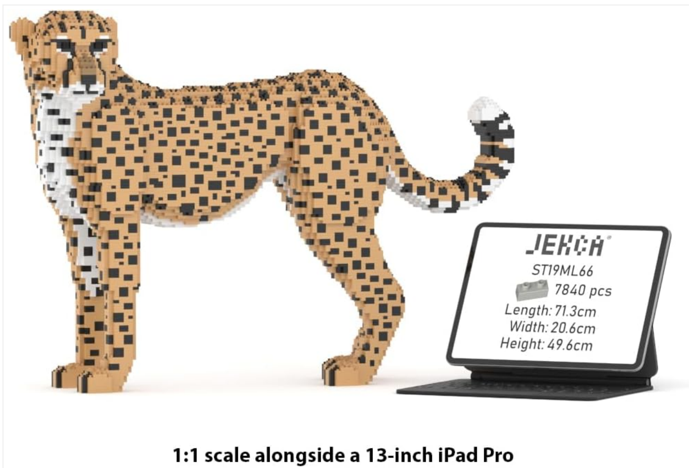
Figure 3: The JEKCA Cheetah 01S model displayed alongside a 13-inch iPad Pro, providing a clear sense of its impressive scale and dimensions.

While the model is robust, avoid excessive force or dropping to prevent potential damage to the bricks or the overall structure. It is not intended as a toy for rough play.