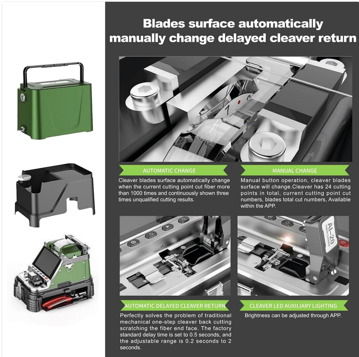
Figure 6.1: Cleaver blade adjustment and automatic delayed return mechanism.

Your browser does not support the video tag.