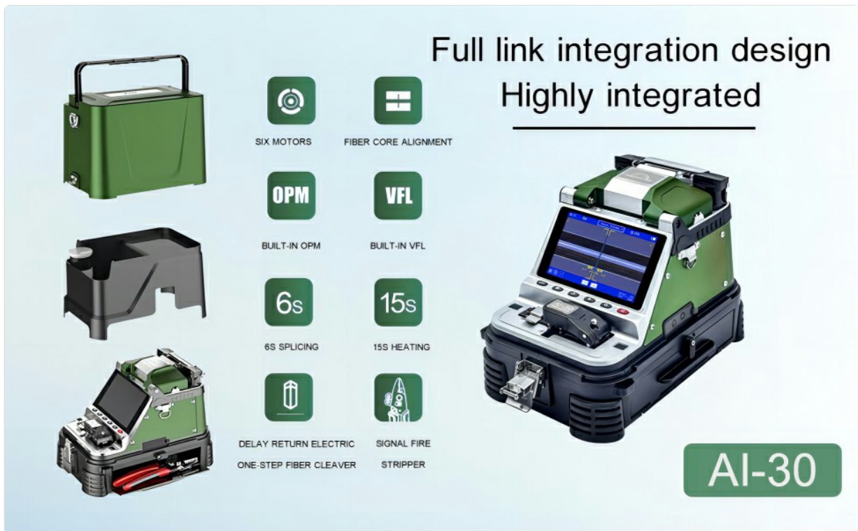
Figure 3.1: Signal fire AI-30 Fusion Splicer with integrated features.

The device also features a 5-inch high-resolution LCD screen for clear fiber core visibility and a 3-in-1 fiber holder for various fiber types.