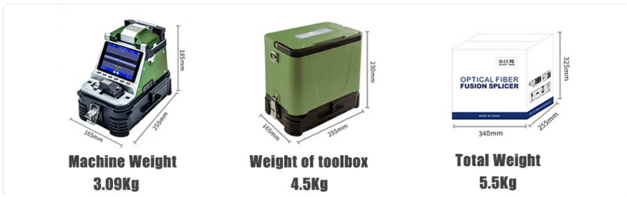
Figure 8.1: Detailed basic parameters of the Signal fire AI-30 Fusion Splicer.