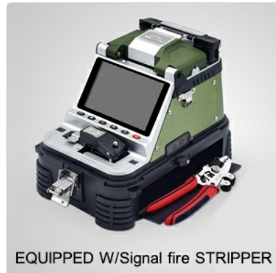
Figure 5.2: Location of the built-in OPM and VFL ports on the splicer.