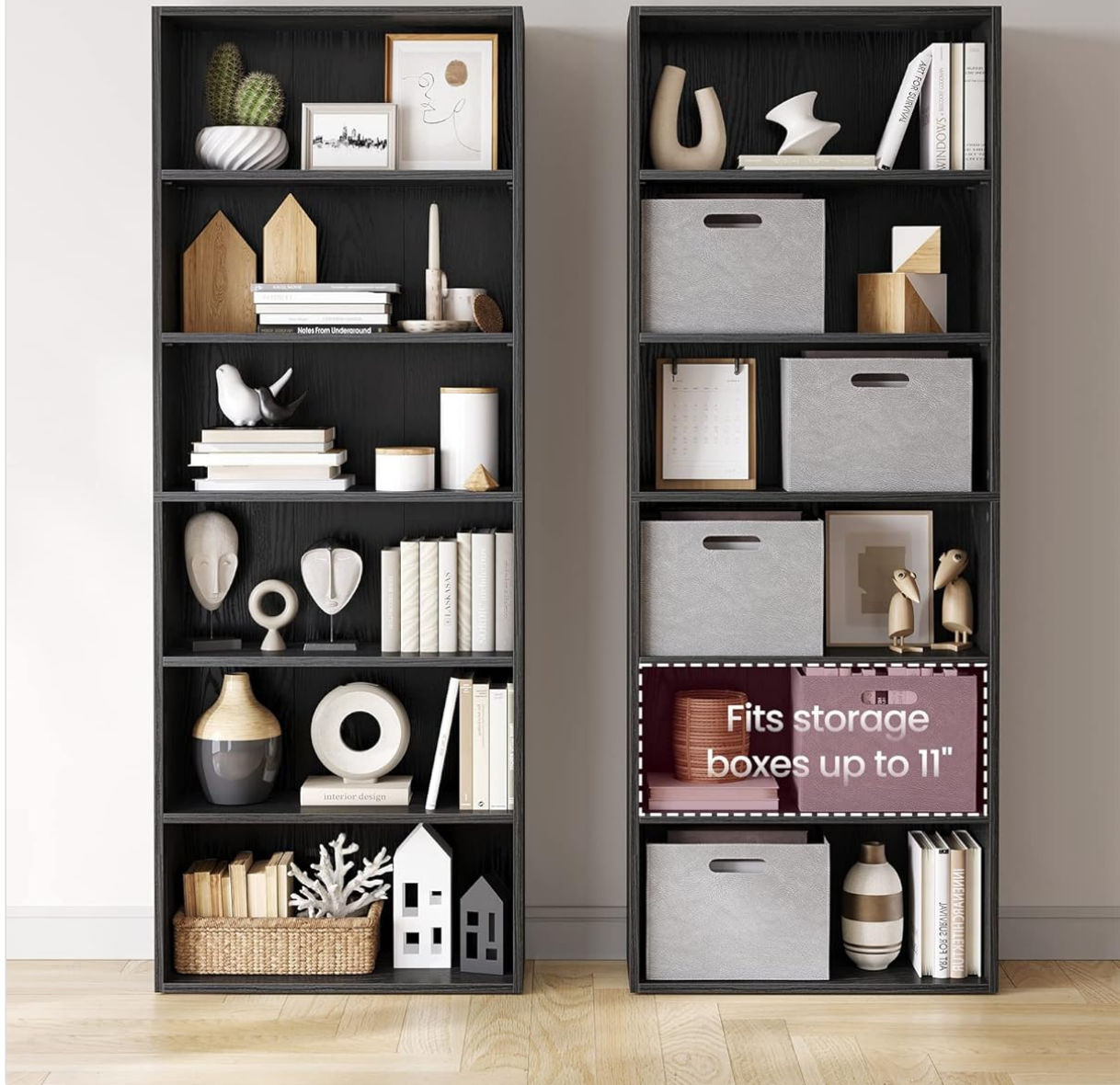
Image 5.1: Bookshelves showcasing versatile storage options, including space for storage boxes up to 11 inches high.