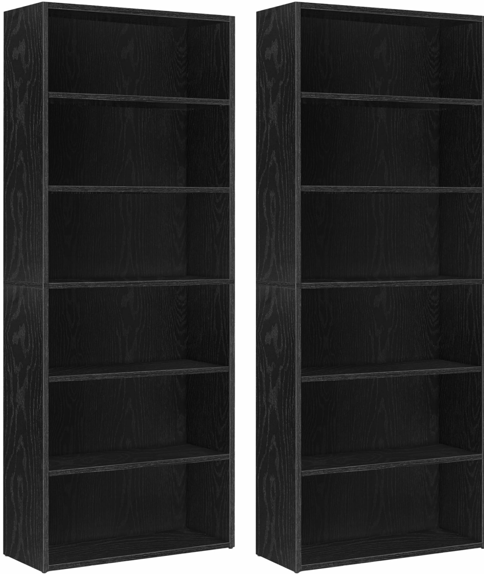
Image 1.1: The VASAGLE ULBC166T56-2 6-Tier Bookshelf, showcasing its design and capacity in a home environment.