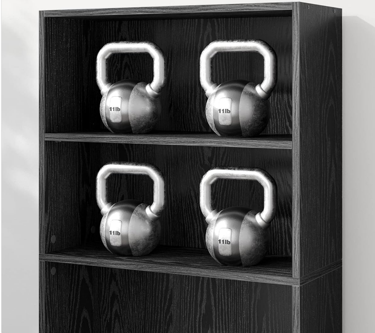
Image 5.2: Demonstration of the high load capacity, with each shelf capable of holding up to 22 lb.