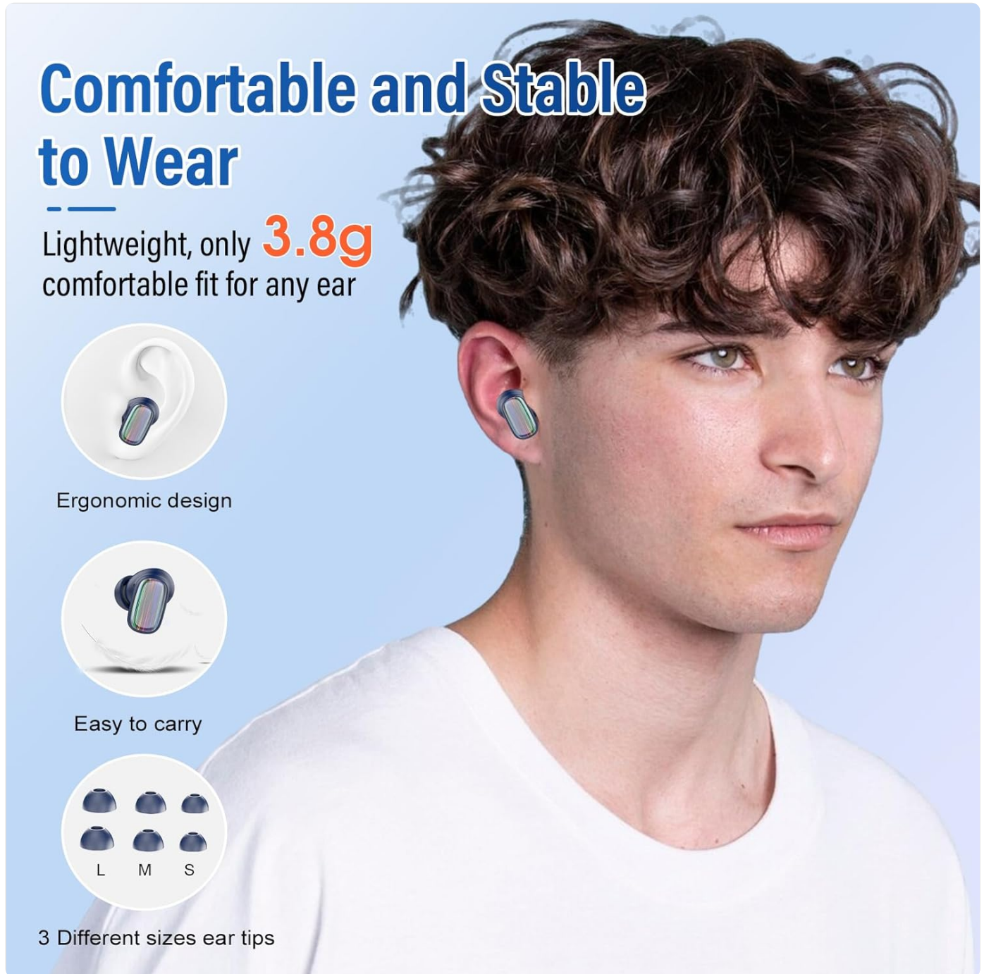
Image: A person demonstrating the comfortable and stable fit of the lightweight (3.8g) earbuds, along with a visual guide for selecting the correct ear tip size.