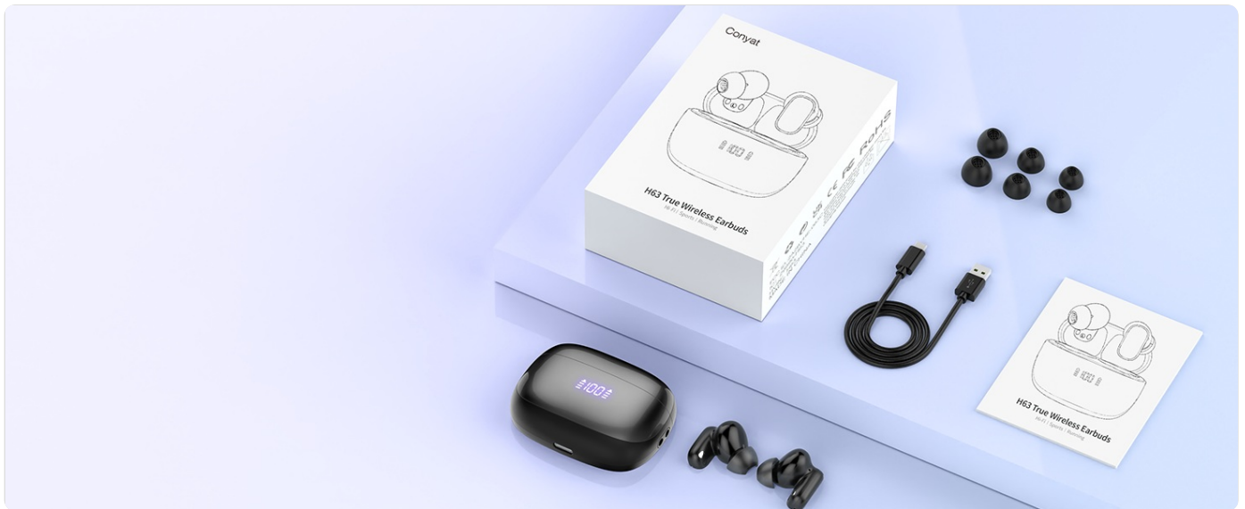
Image: Contents of the Conyat H63 package, showing the earbuds, charging case, USB-C cable, and user manual.