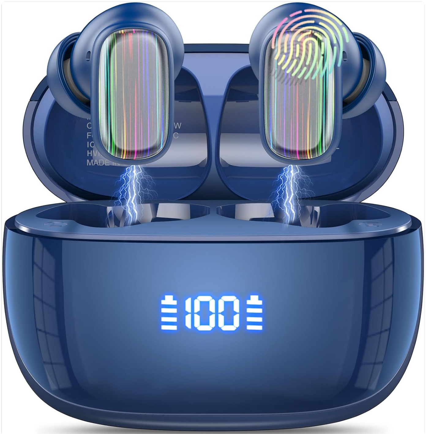
Image: Conyat H63 Wireless Earbuds in their navy blue charging case, displaying a 100% charge on the LED screen.