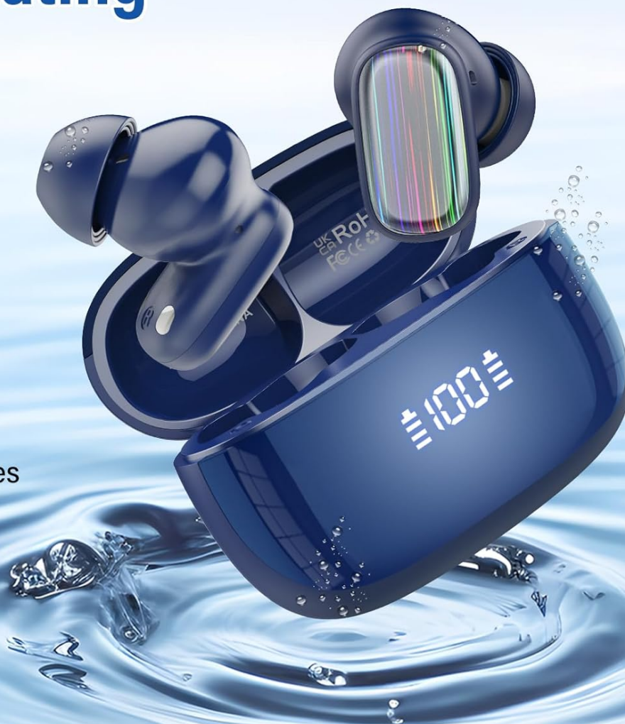
Image: Visual representation of the IPX7 waterproof rating, showing the earbuds resisting water from light rain, splashes, and sweat.