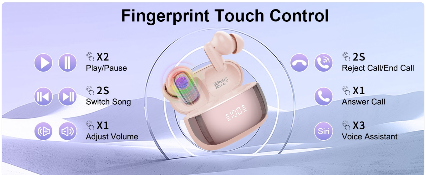
Image: A visual guide detailing the various touch control gestures and their corresponding functions on the earbuds.