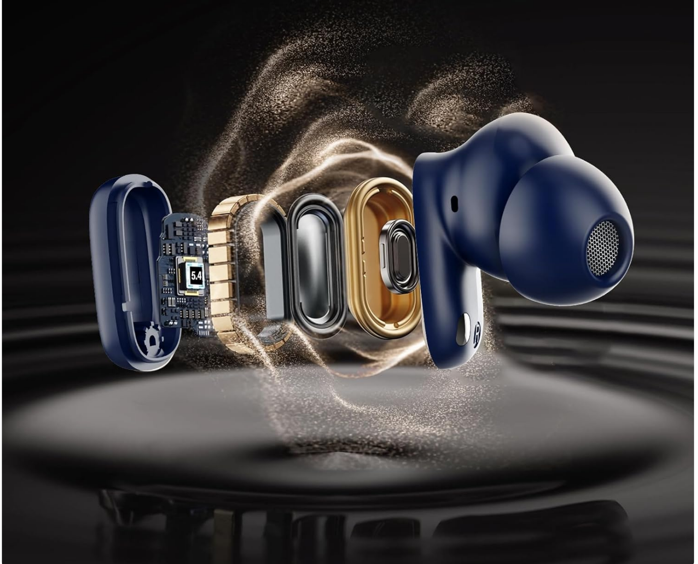
Image: Exploded view diagram of an earbud, illustrating its internal structure for Hi-Fi stereo and deep bass sound.

Enjoy a surround sound experience that lets you feel every note like you're there