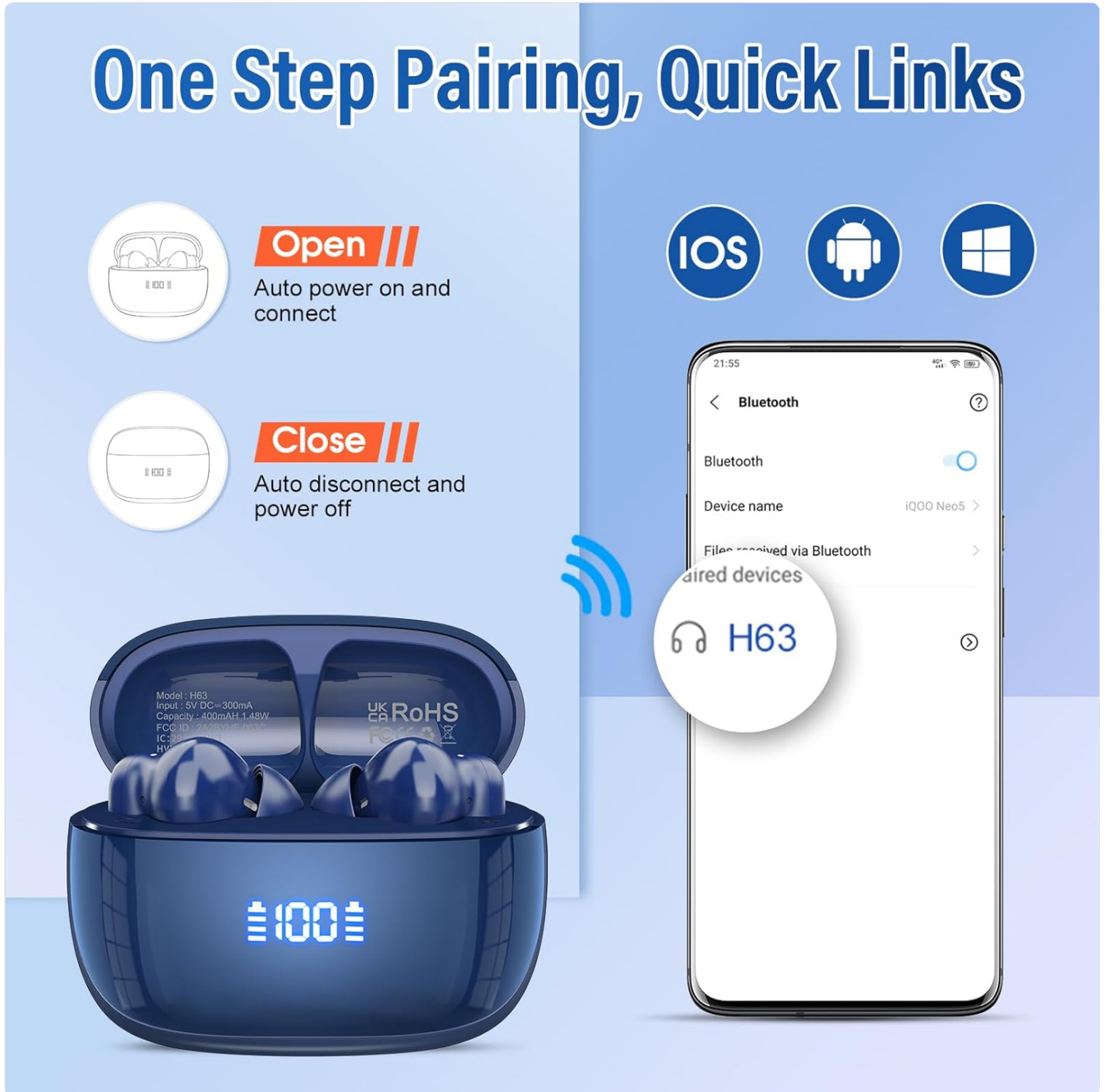
Image: Visual guide for one-step pairing, demonstrating how opening the case initiates connection and closing it powers off, with a phone's Bluetooth menu displaying the "H63" device.