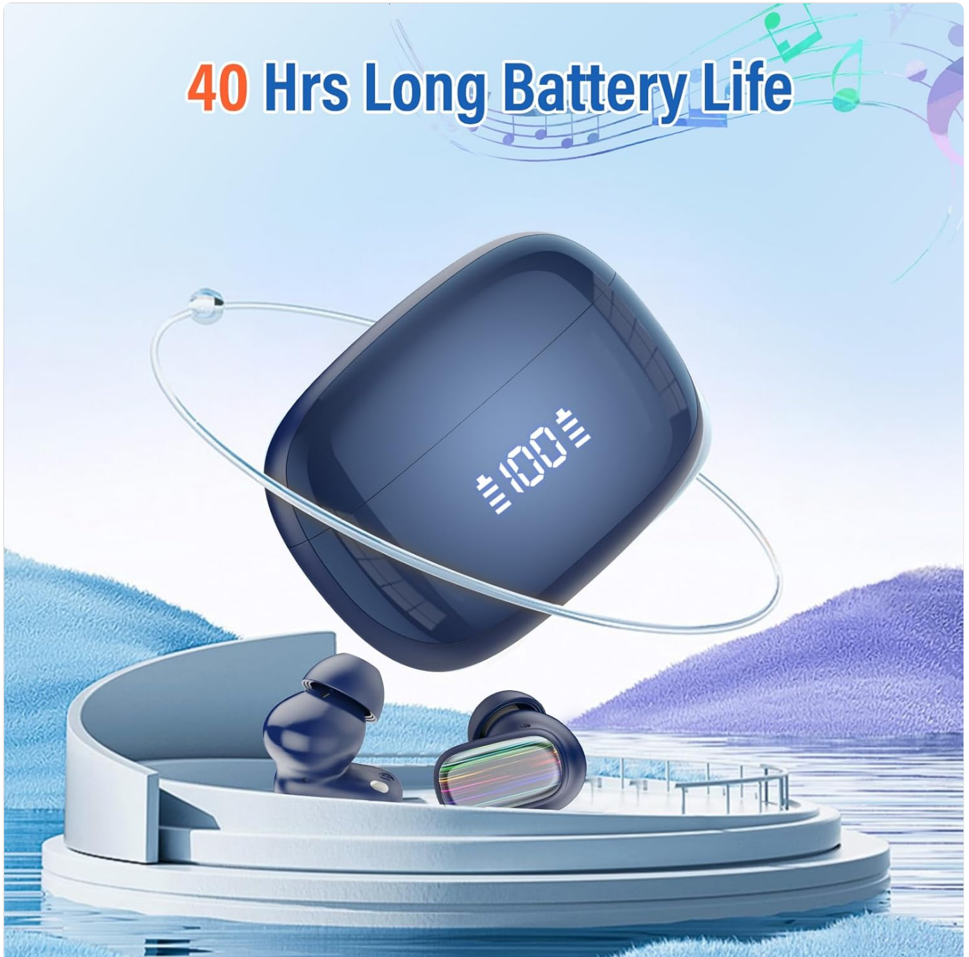
Image: The charging case with its digital LED display indicating a full charge, representing the extended 40-hour battery life.