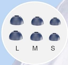
3 Different sizes ear tips