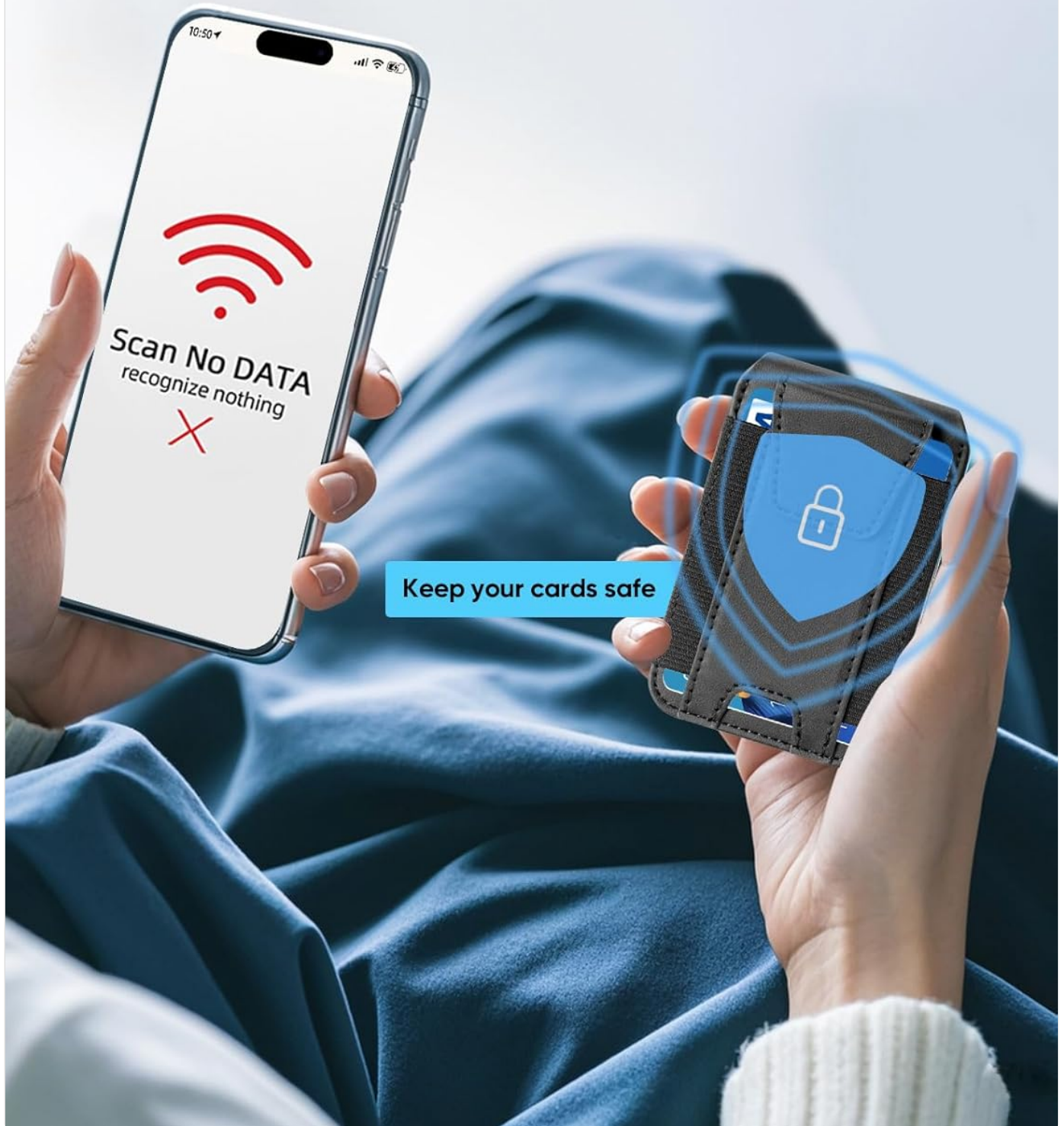
Image: An illustration demonstrating the RFID blocking functionality, preventing unauthorized data scanning from cards stored in the wallet.

Special lining protects your magnetic-stripe cards