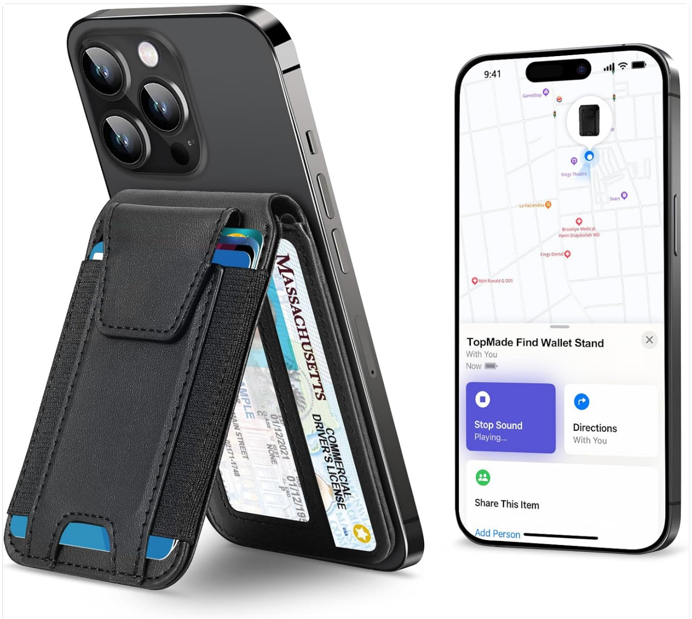
Image: TopMade MagSafe Wallet attached to an iPhone, displaying the Apple Find My interface with location and sound options.