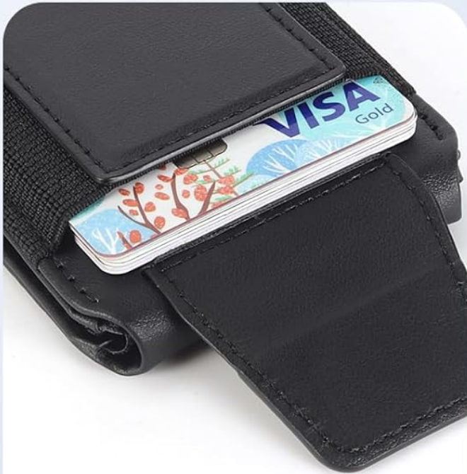
Max 6 Cards

Easily to hold 9 cards without any bulk.