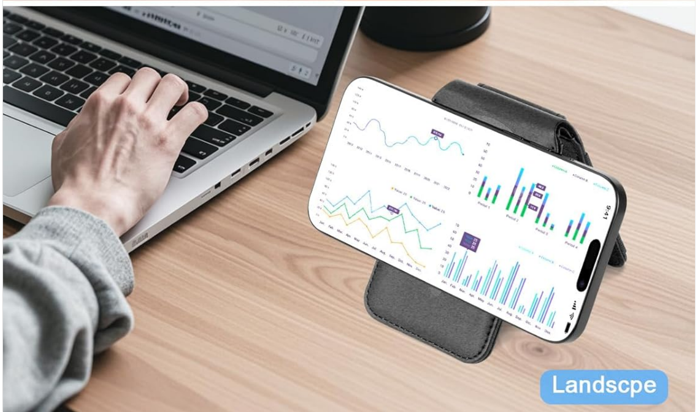
Image: The wallet used as an adjustable stand, supporting an iPhone in both portrait and landscape orientations.