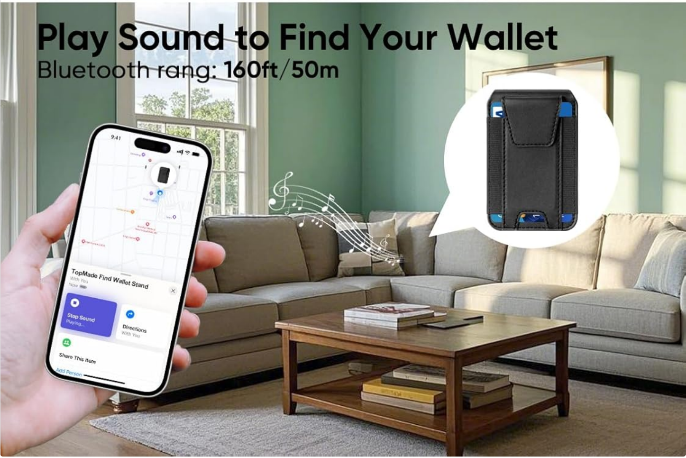
Image: Visual representation of the 'Left-Behind Remind' notification and the 'Play Sound' function within the Find My application.