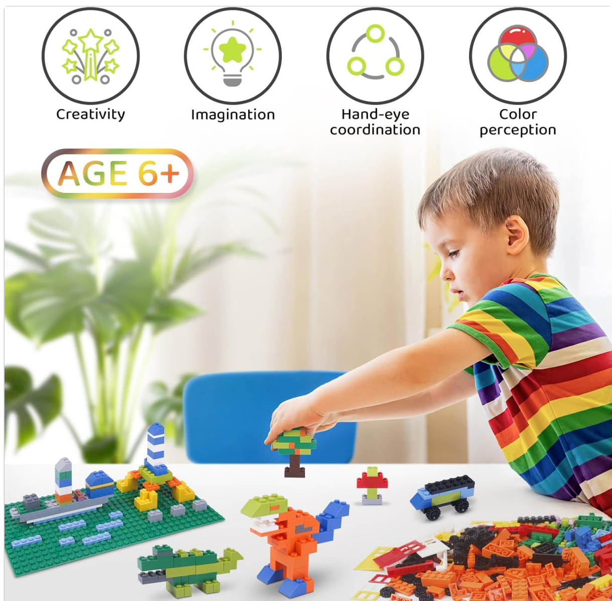
Image 4.1: A child engaged in creative play, demonstrating the developmental benefits of building with these blocks.

Your browser does not support the video tag.