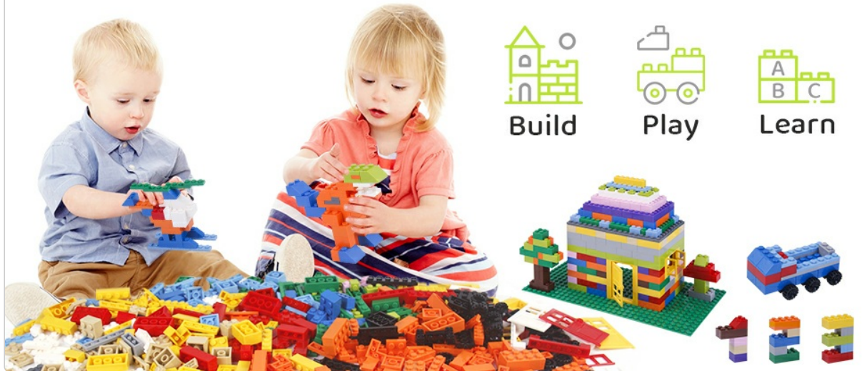
Image 2.1: Overview of the Tcamgoi building brick set contents, including the total piece count and main accessories.

1100 PCS Building Bricks + 2 PCS 16x32 Baseplates + Door and window accessories + wheel accessories