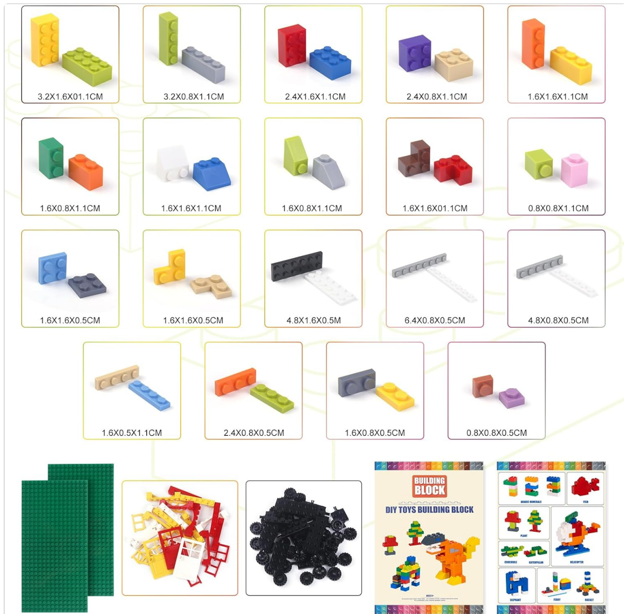
Image 3.1: A visual guide to the different shapes and sizes of individual building bricks included in the set.