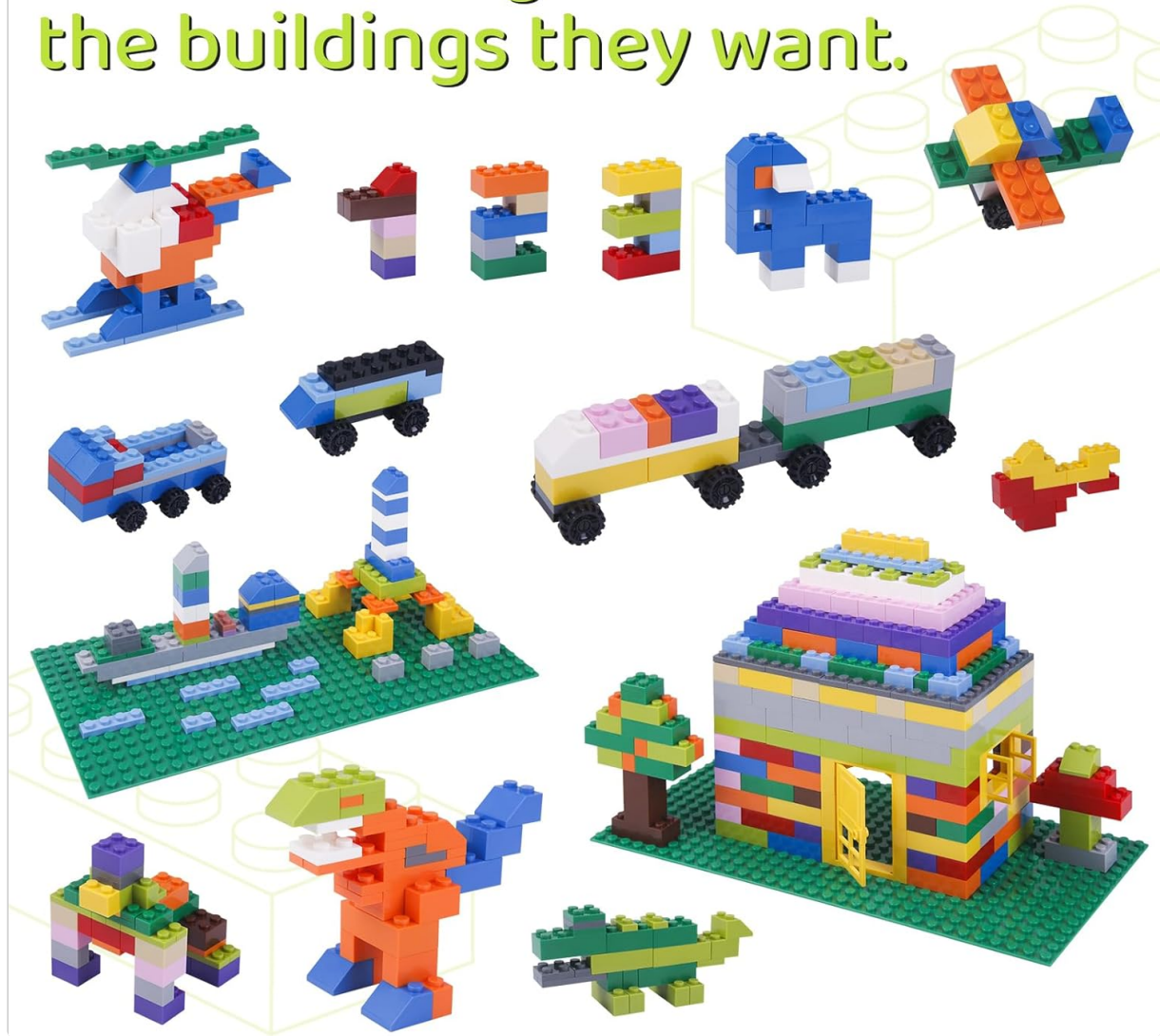
Image 1.1: Examples of creations built with Tcamgoi building bricks, showcasing the versatility of the set.