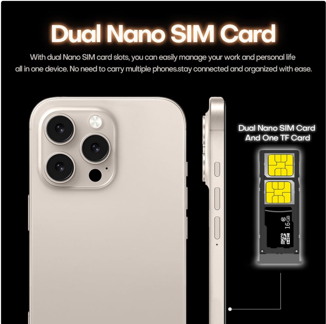
Image: Close-up view of the dual Nano SIM card and TF card tray, illustrating how to correctly insert the cards.