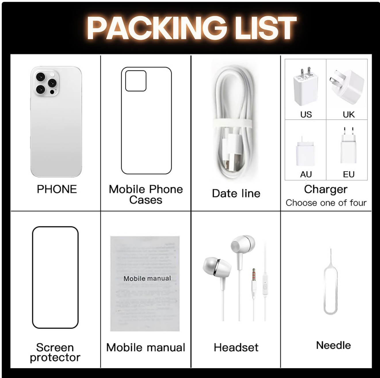
Image: Visual representation of the items included in the SANSHREUNI A16 Pro phone package, such as the phone, charger, earphones, screen protector, case, and manual.