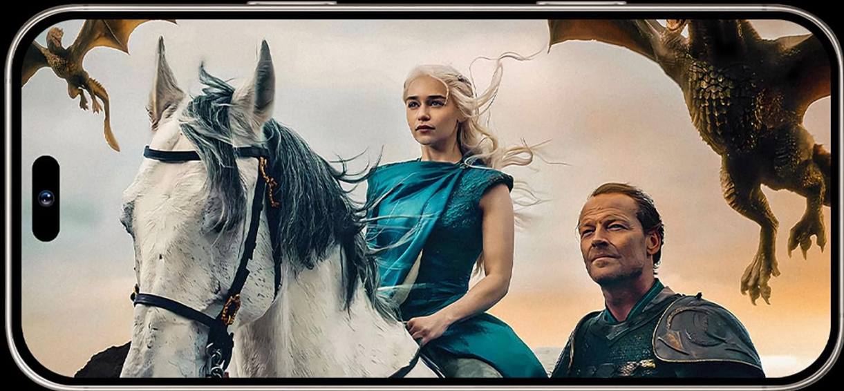
Image: The phone displaying a high-definition image on its 6.73-inch full-screen, emphasizing the visual quality.