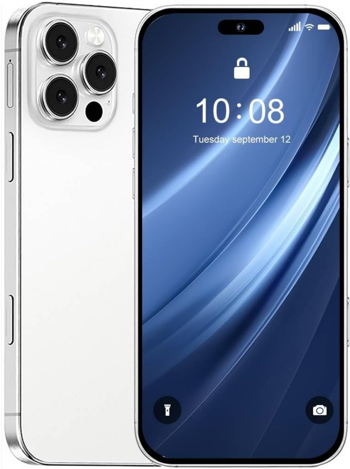
Image: Front and back view of the SANSHREUNI A16 Pro Unlocked Phone, showcasing its sleek design and camera module.