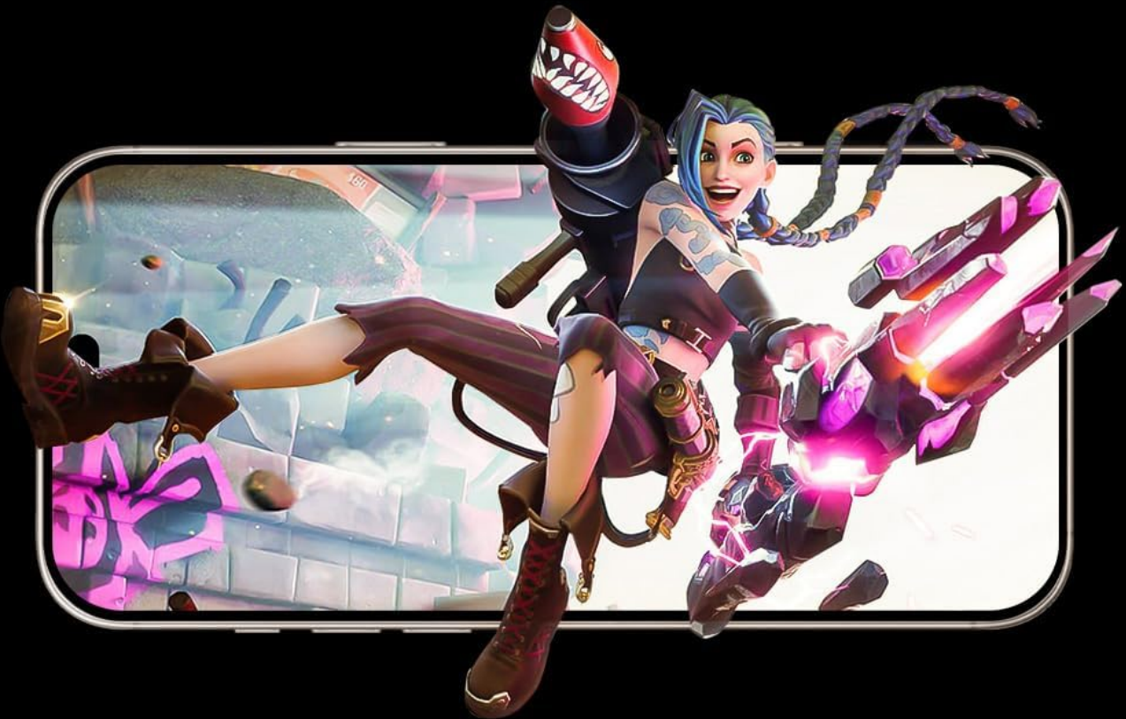
Image: An illustration showing the phone's large memory capacity, indicating 8GB RAM and 256GB ROM, with a graphic of a game running smoothly.