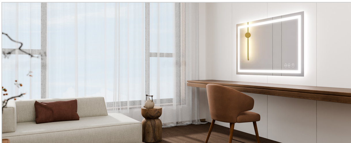
Image: The memory function ensures your preferred light settings are retained.