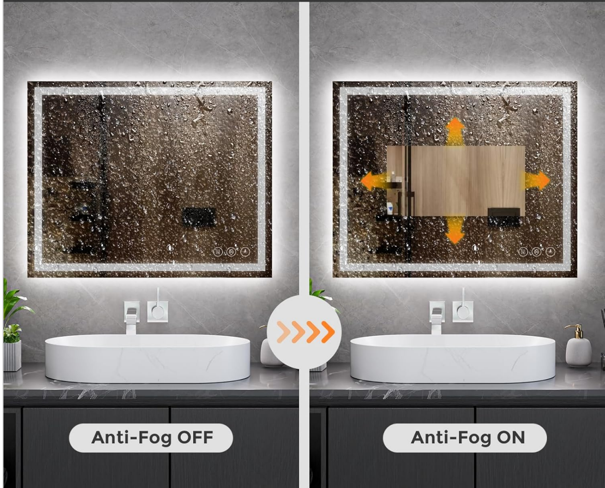
Image: Comparison of the mirror with anti-fog off (foggy) and anti-fog on (clear).

The defogging function turns on with the switch and turns off automatically after one hour of operation