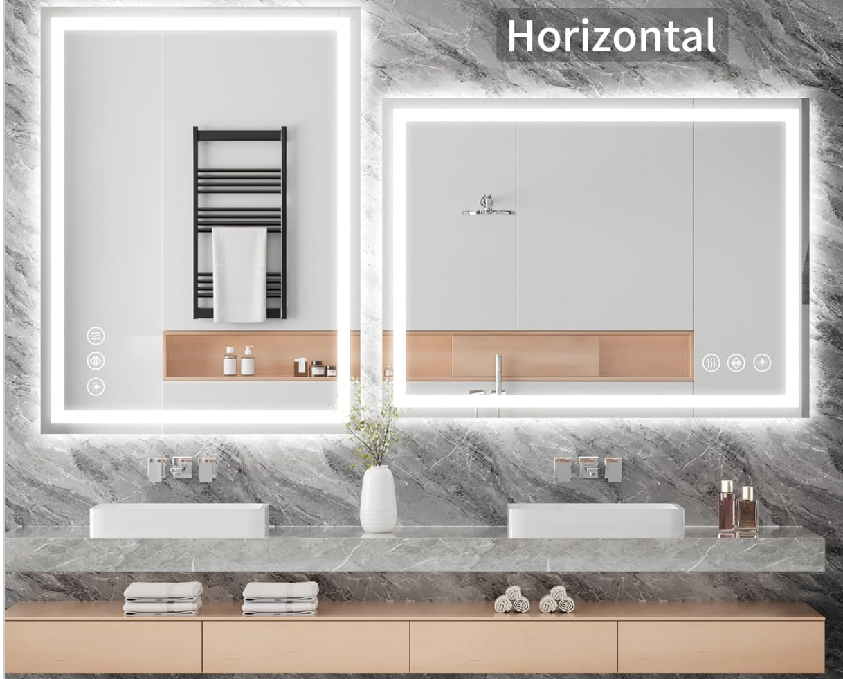
Image: Visual guide for vertical and horizontal mounting of the mirror.