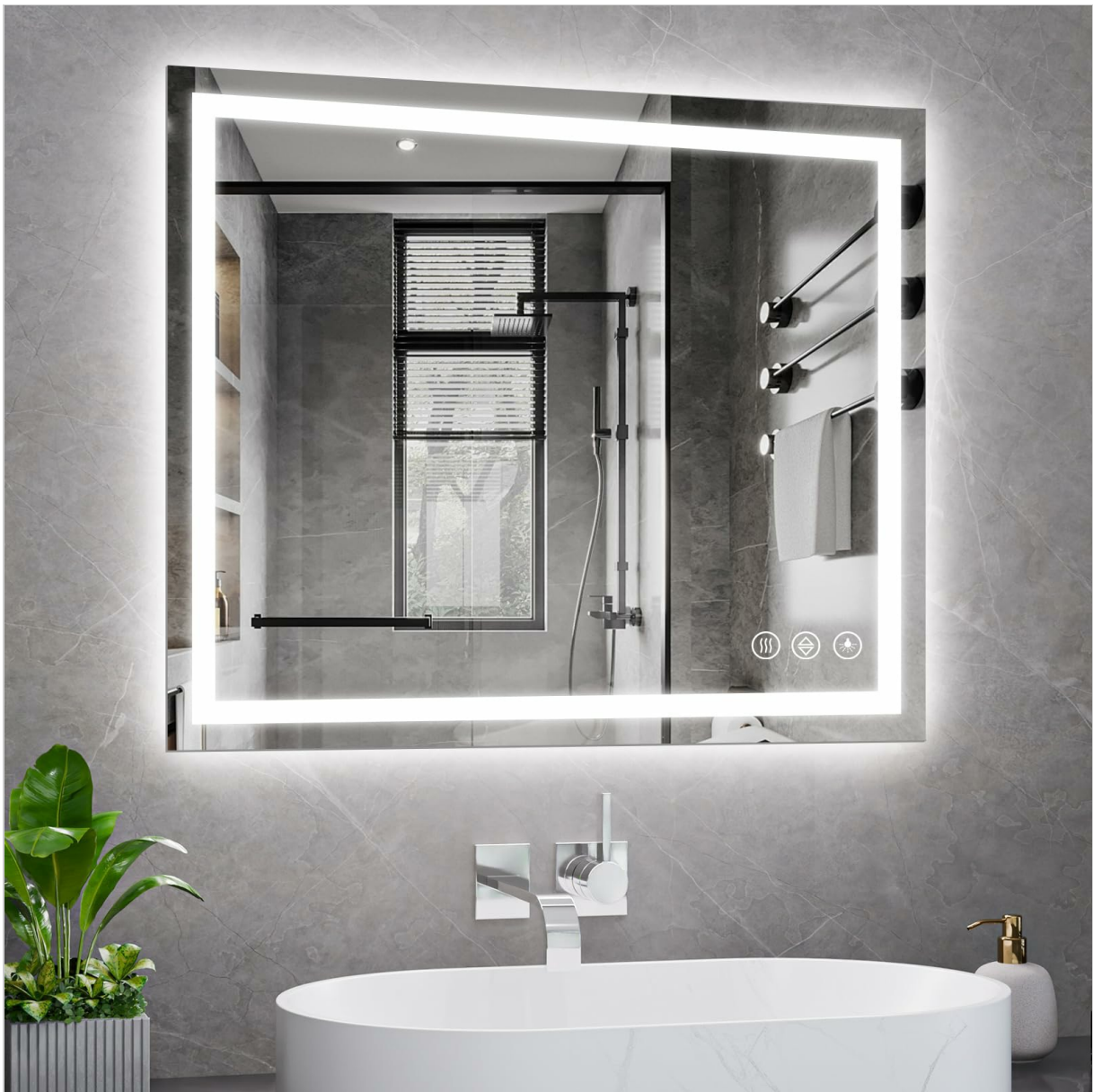
Image: The Koonmi 30x36 LED Bathroom Mirror showcasing its illuminated design.