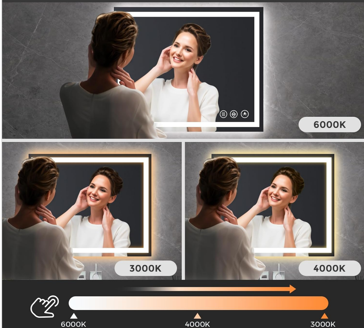
Image: Visual representation of the three color temperature options available on the mirror.