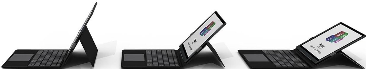
Image: The keyboard case shown from the side, illustrating how the tablet can be propped up at different angles using the built-in grooves and flip design.

Choose the angle that works best for you