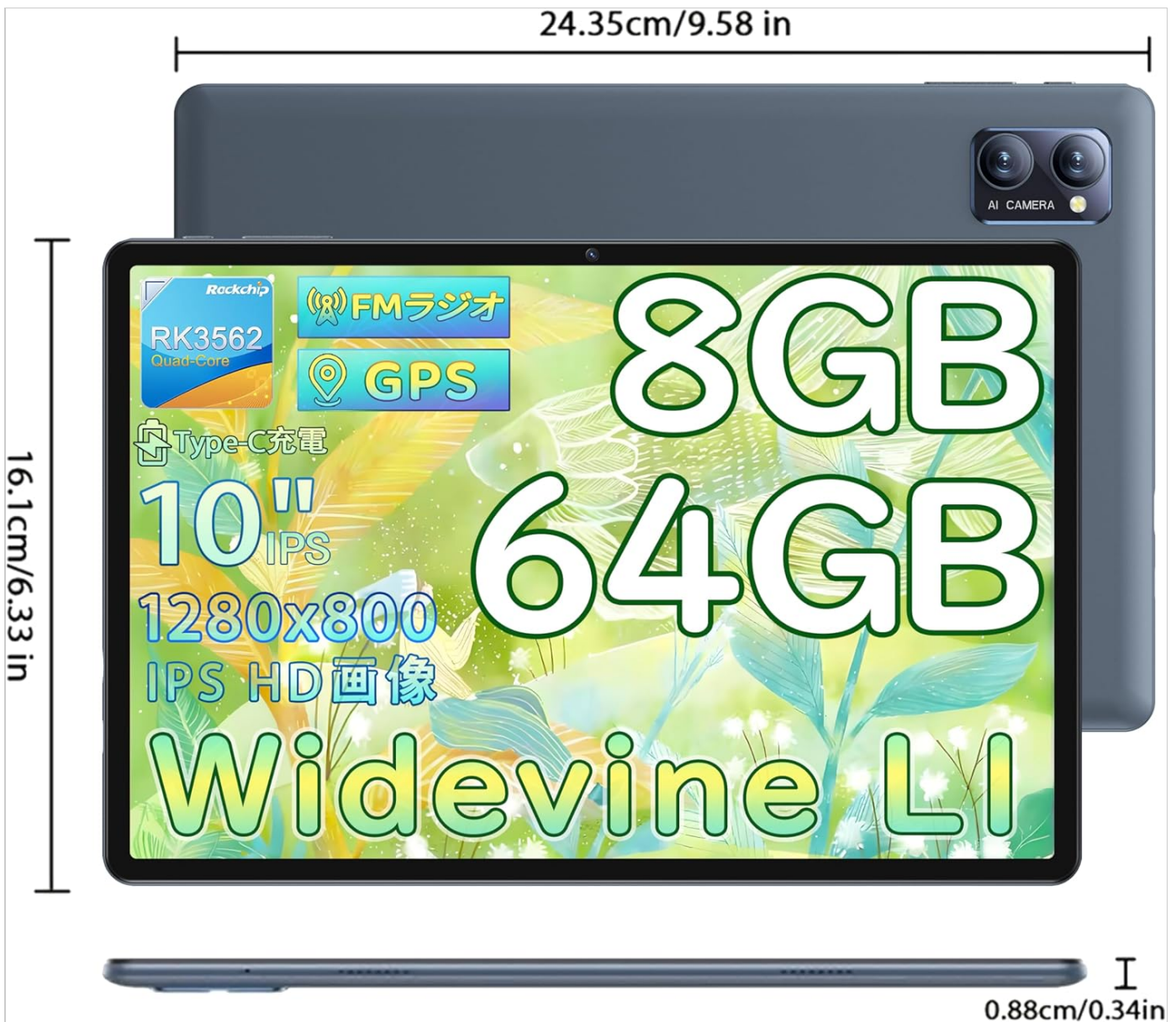
Figure 4: Overview of the N-one Npad Y1 tablet's physical features and dimensions.