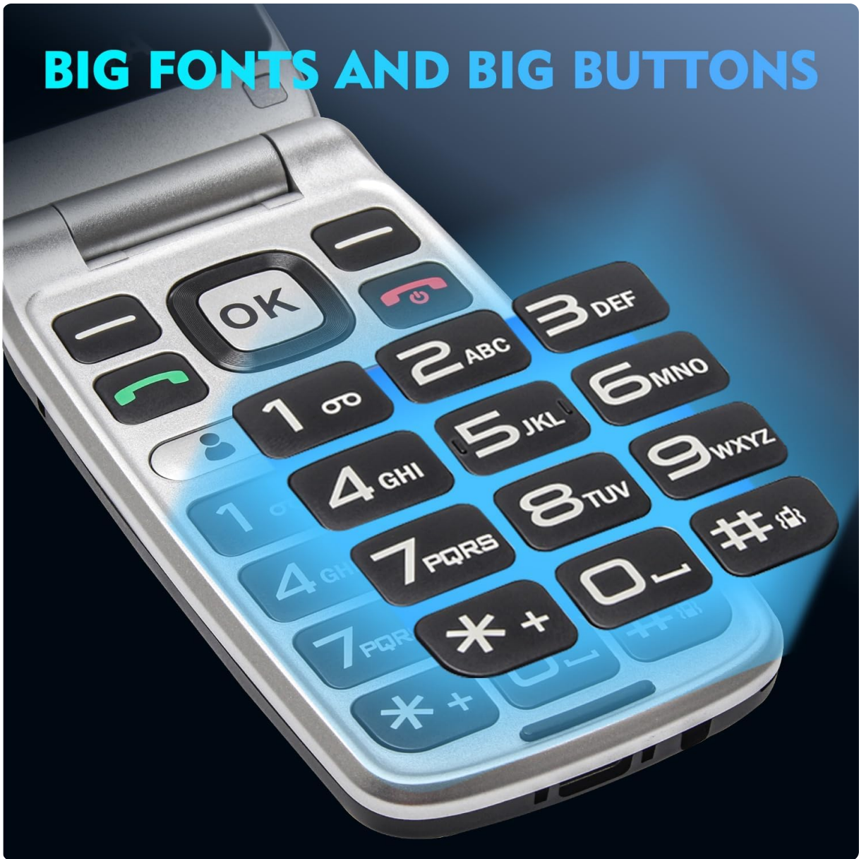
Image: The Mosthink flip phone in an open position, showcasing its large internal display and user-friendly keypad.

The speaking keypad feature, which announces each button press, is off by default. You can enable it in the phone's settings for enhanced accessibility.