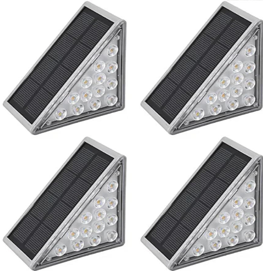
Image: Four Nordikhome Solar Stair Lights, showcasing their design and cool light output on a set of outdoor stairs.