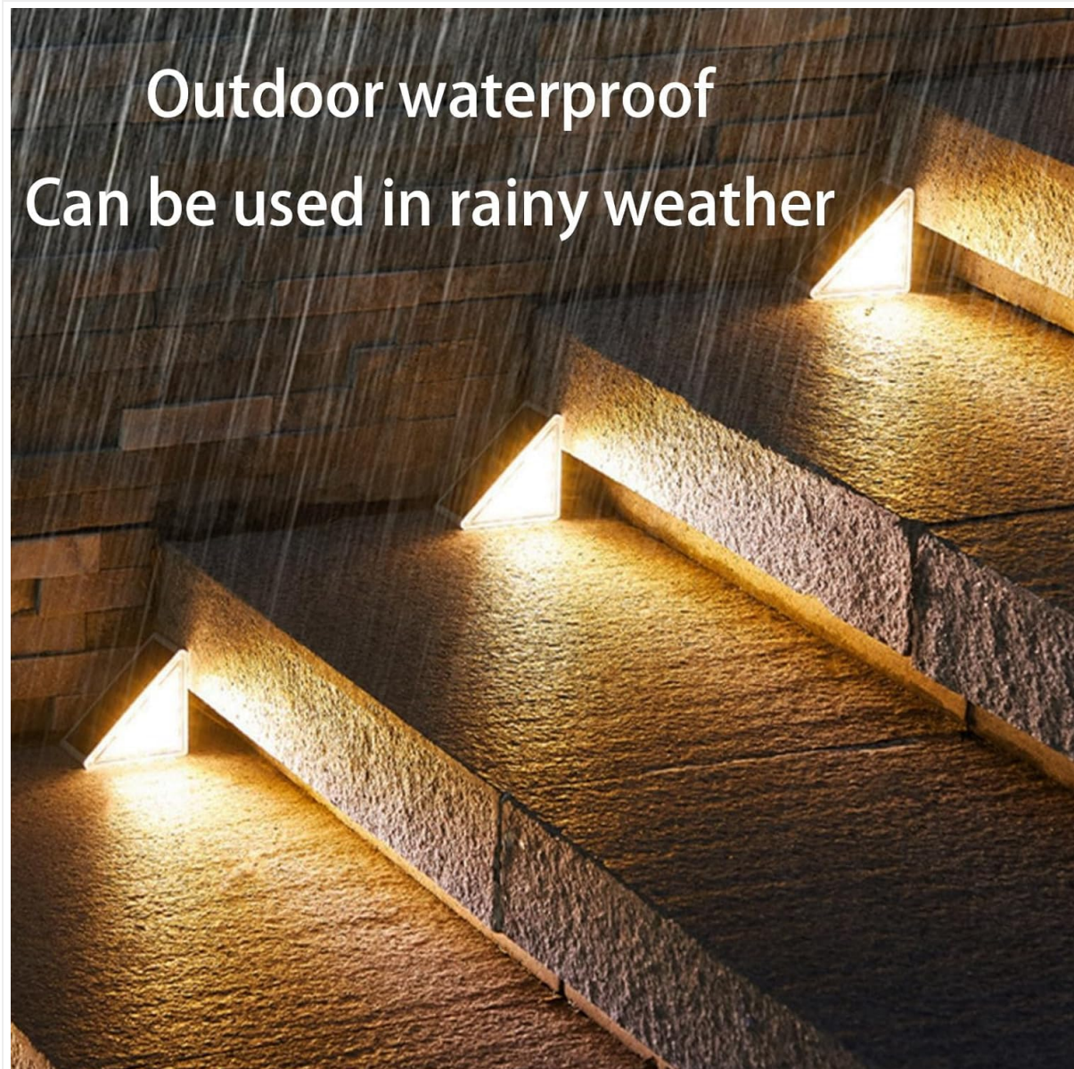
Image: Solar lights illuminating steps during rainfall, highlighting their outdoor waterproof design and durability in various weather conditions.