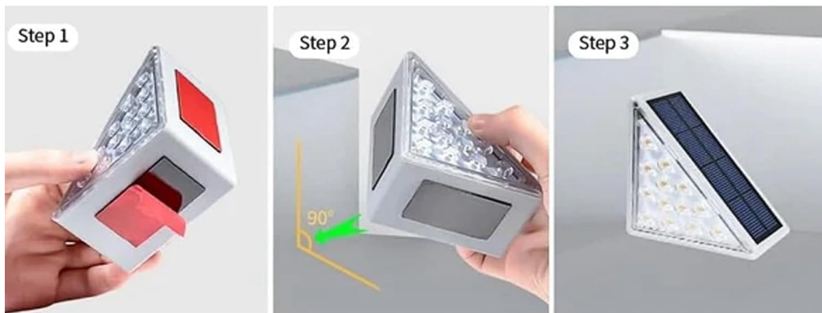
Image: A visual guide detailing the two easy installation methods: securing with screws and anchors, and attaching with adhesive tapes.