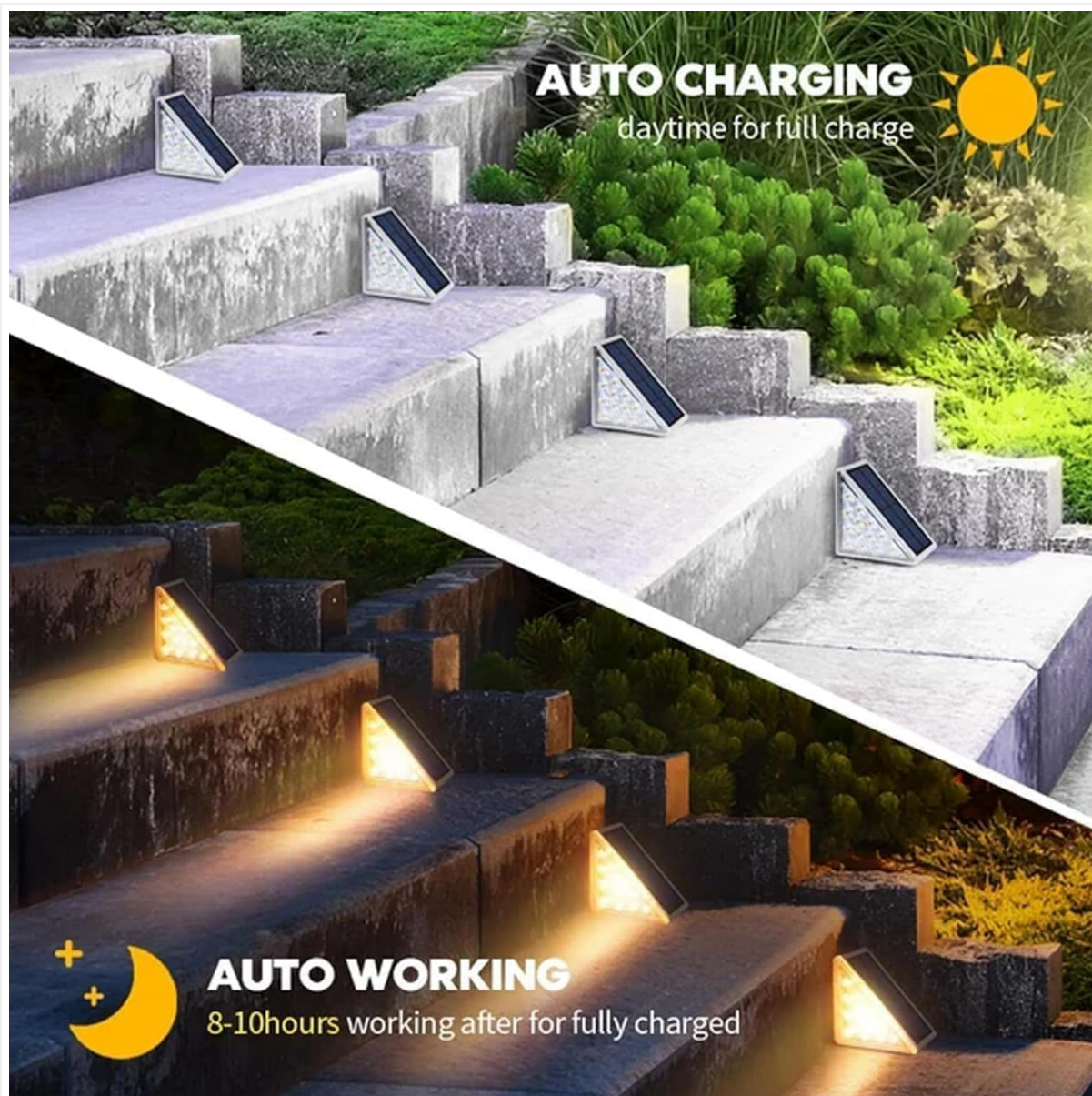
Image: Illustration demonstrating the automatic charging of the solar lights during the day and their automatic illumination for 8-10 hours at night after being fully charged.