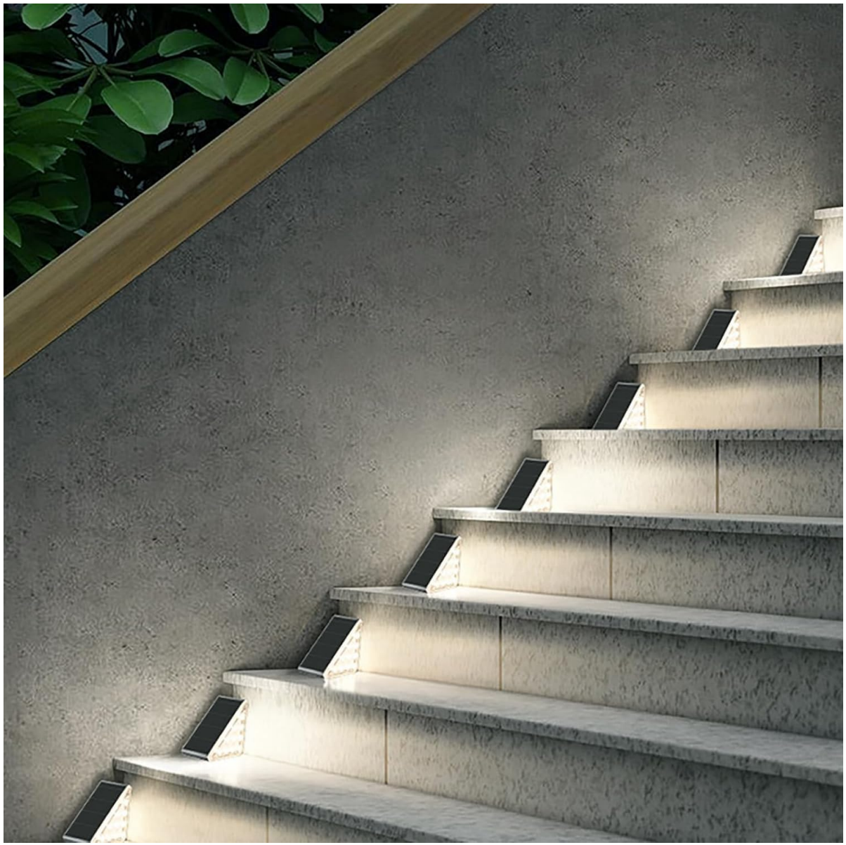
Image: Multiple Nordikhome Solar Stair Lights, emitting cool light, installed along a set of outdoor steps, providing clear illumination.