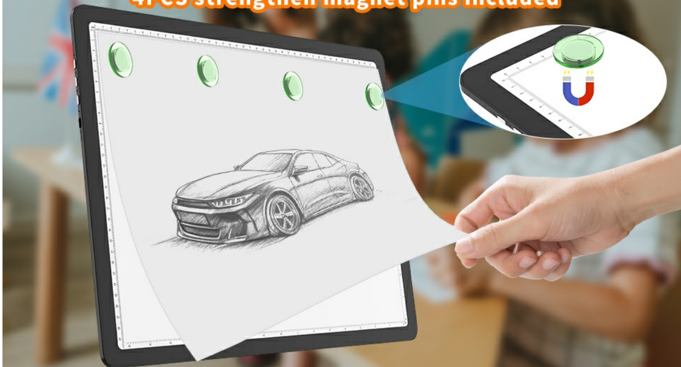
Image: Overview of the TOHETO A4 Light Pad highlighting its eye-caring, battery, dimming, color modes, and physical button features.

Magnetic attractable, hold the paper on the Lightpad easily. 4PCS strengthen magnet pins included