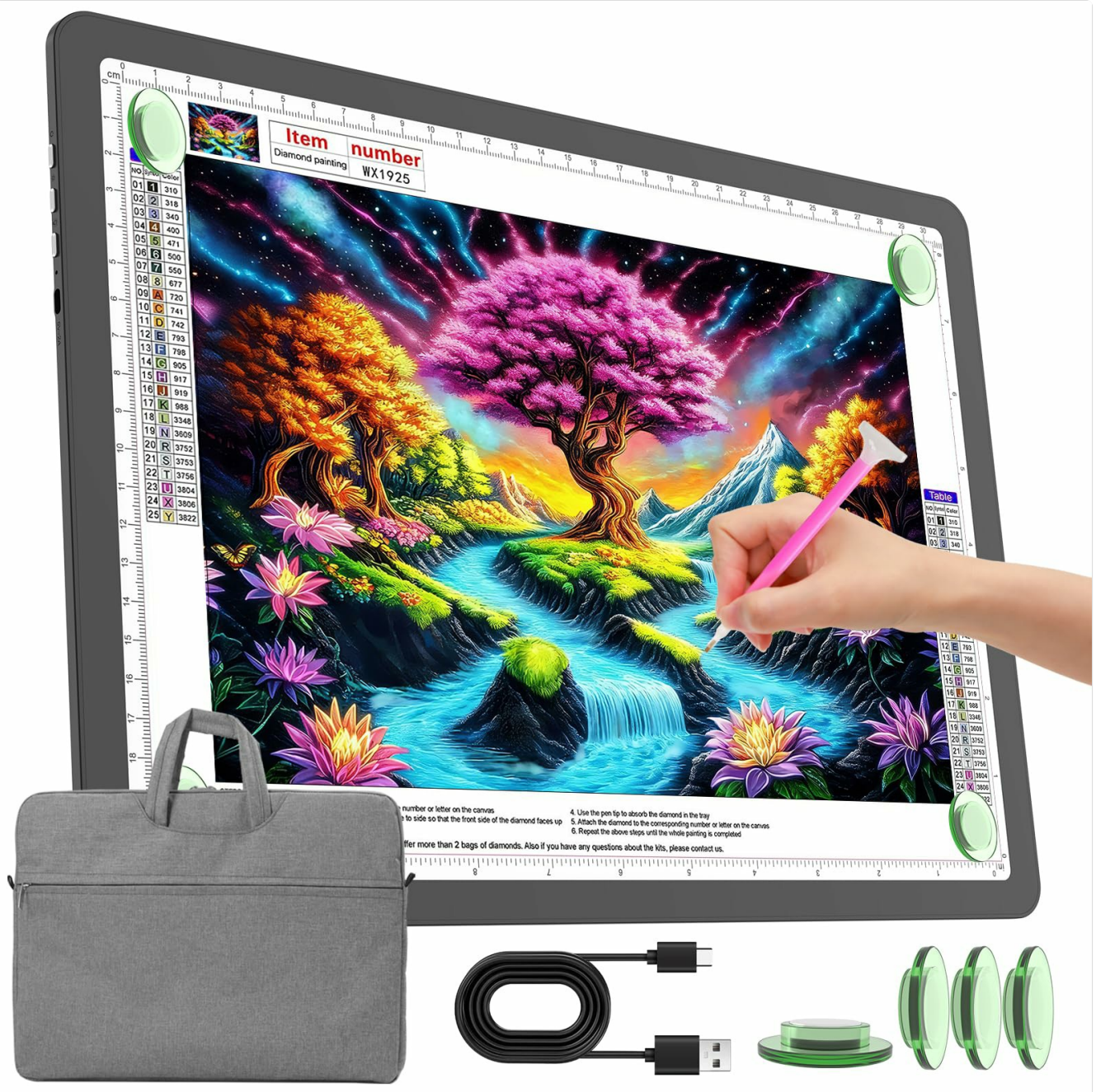
Image: The TOHETO Rechargeable A4 Light Pad, shown with its protective carry bag.