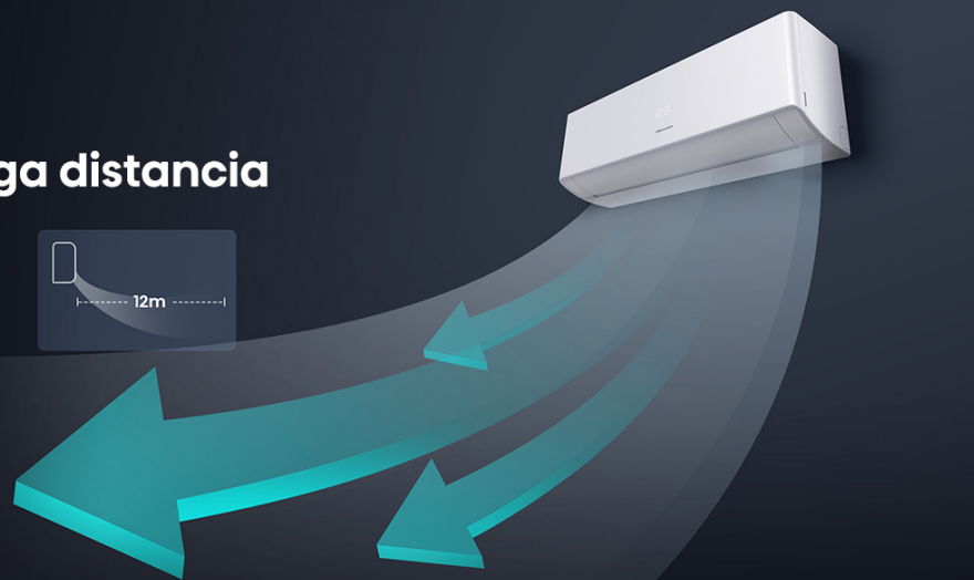
Image: Long-distance air throw capability.