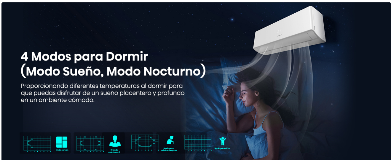
Image: Visual representation of the 4 Sleep Modes.

The unit offers four distinct sleep modes, providing different temperature adjustments throughout the night to ensure a pleasant and deep sleep in a comfortable environment.