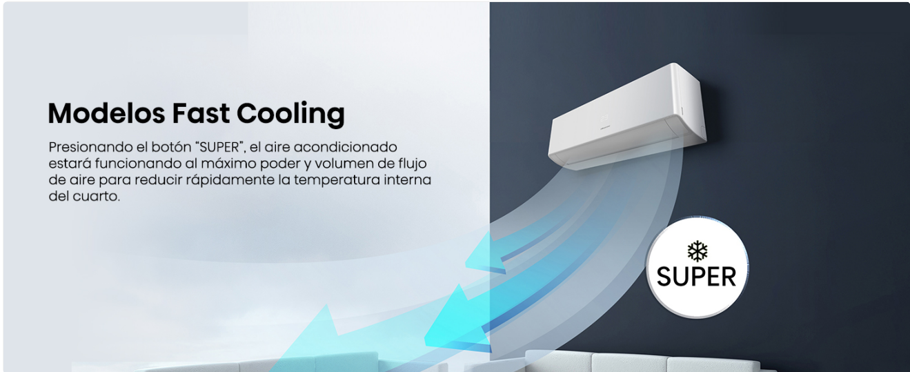
Image: Airflow illustration for Super Cooling mode.

Pressing the "SUPER" button on your remote activates fast cooling. The air conditioner will operate at maximum power and airflow volume to quickly reduce the internal room temperature.