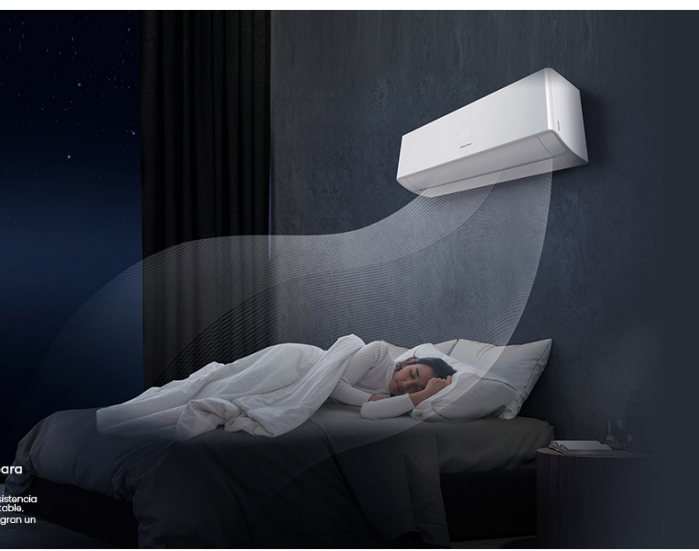
Image: Quiet Mode operation for undisturbed sleep.

A. El serpentín gradual mejora la resistencia al flujo del aire y la mantiene estable. B. Los grandes embudos radiales logran un gran flujo de aire silencioso.