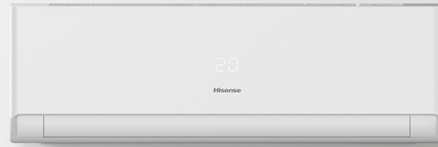
Image: Hisense ART121KA indoor unit, part of the KA Series.