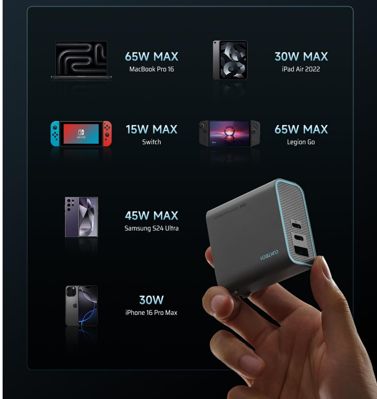
Image 3.3: The CUKTECH combo offers universal compatibility, charging a wide range of devices from phones to laptops.