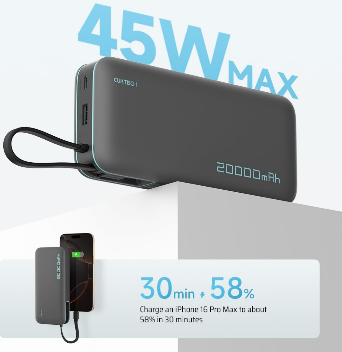
Image 2.1: The power bank supports 45W MAX fast charging, which also applies to its self-charging capability.