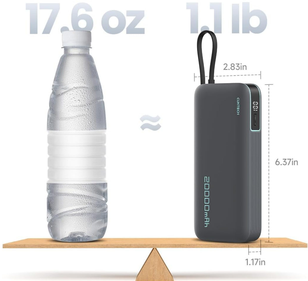
Image 6.1: The power bank's weight is comparable to a standard bottle of water, highlighting its portability.