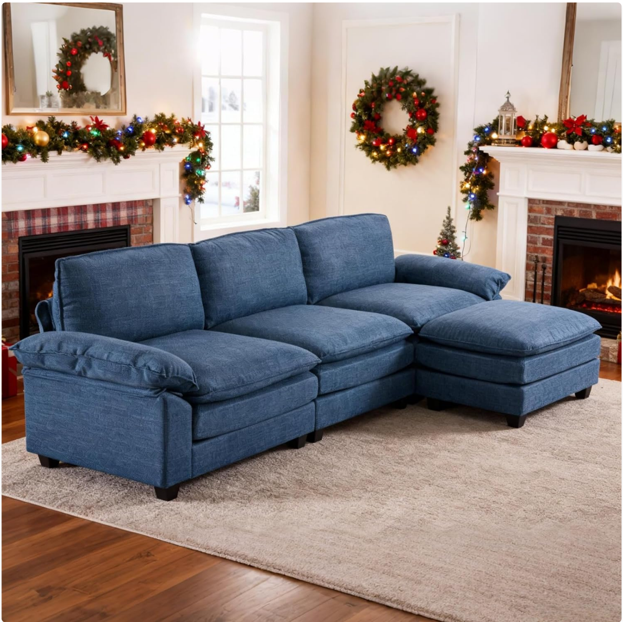
Image 1.1: Karl home Modular Sectional Sofa with Ottoman in Dusty-Blue.