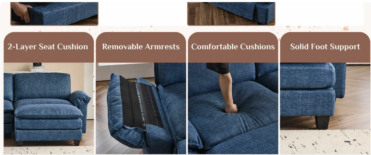
Image 5.1: Detailed features of the sofa including cushions, armrests, and legs.