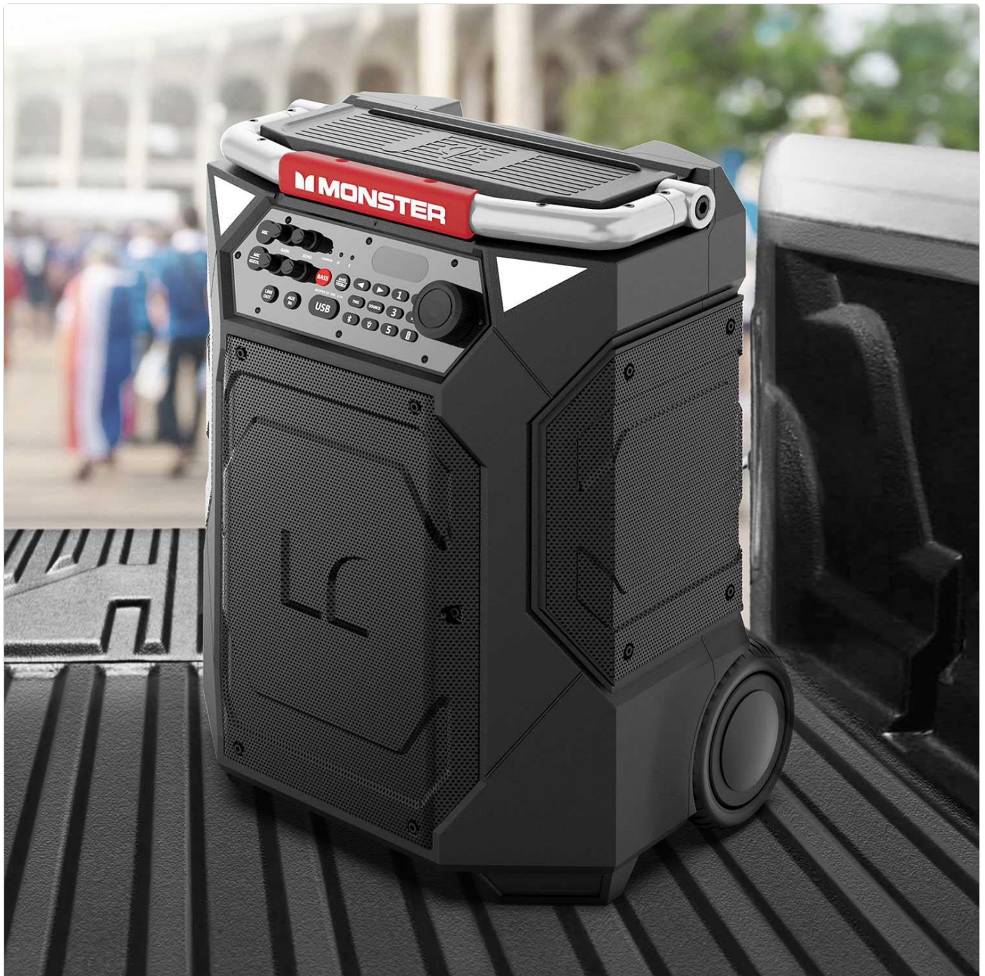
Image: The speaker positioned in the back of a truck, showcasing its suitability for outdoor and mobile use.