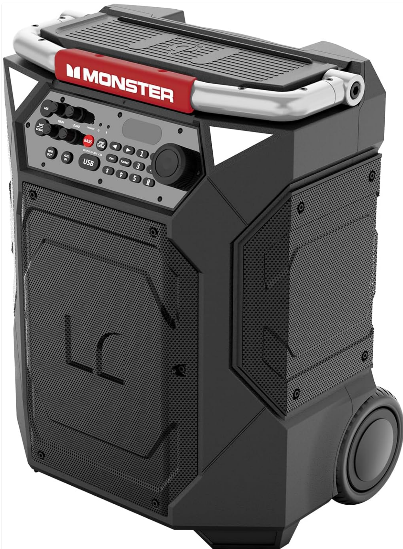
Image: Side view of the speaker, illustrating its large wheels and the extended telescoping handle for easy transport.