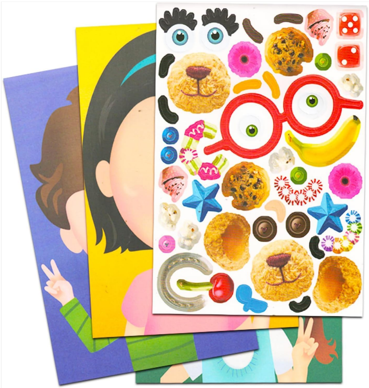
Image: The Create-a-Face sticker book, included as a bonus item.