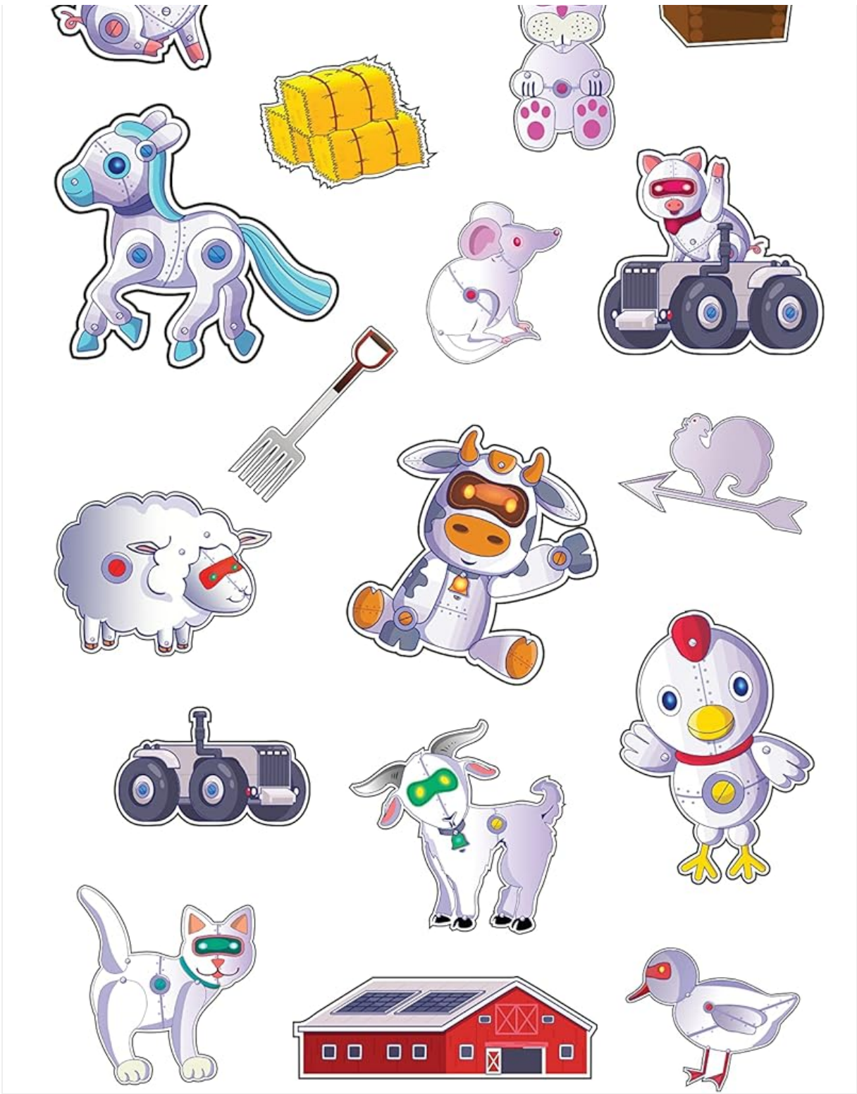
Image: A sheet of Barn Bots bonus stickers.