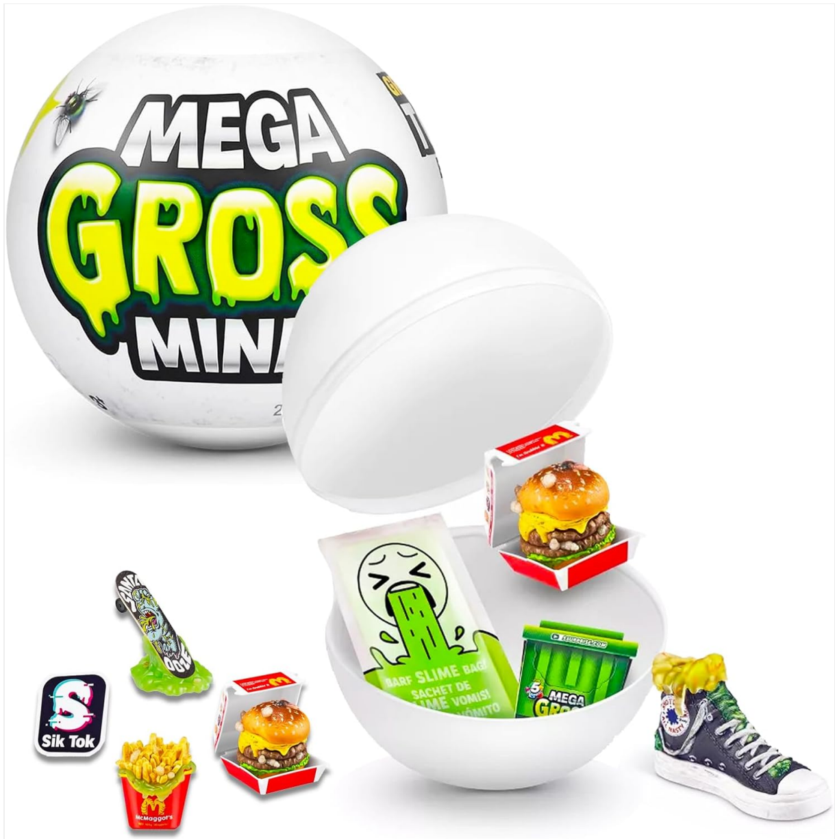
Image: The mystery ball opened, showcasing some of the collectible gross mini toys and a slime bag.