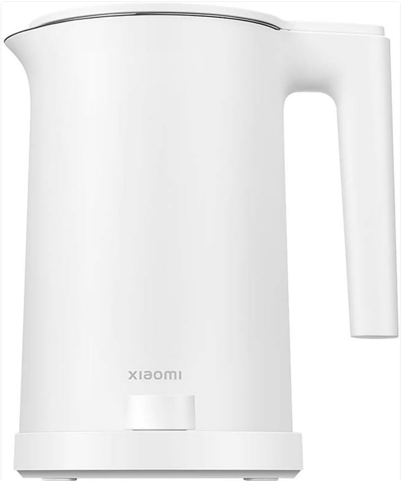
Figure 1: Xiaomi Smart Kettle 2 Pro EU. This image shows the kettle in its upright position, highlighting its minimalist white design, integrated handle, and the power base connection point. The Xiaomi logo is visible on the front.

The Xiaomi Smart Kettle 2 Pro EU features a sleek, minimalist design with a durable alloy steel interior. Key components include: