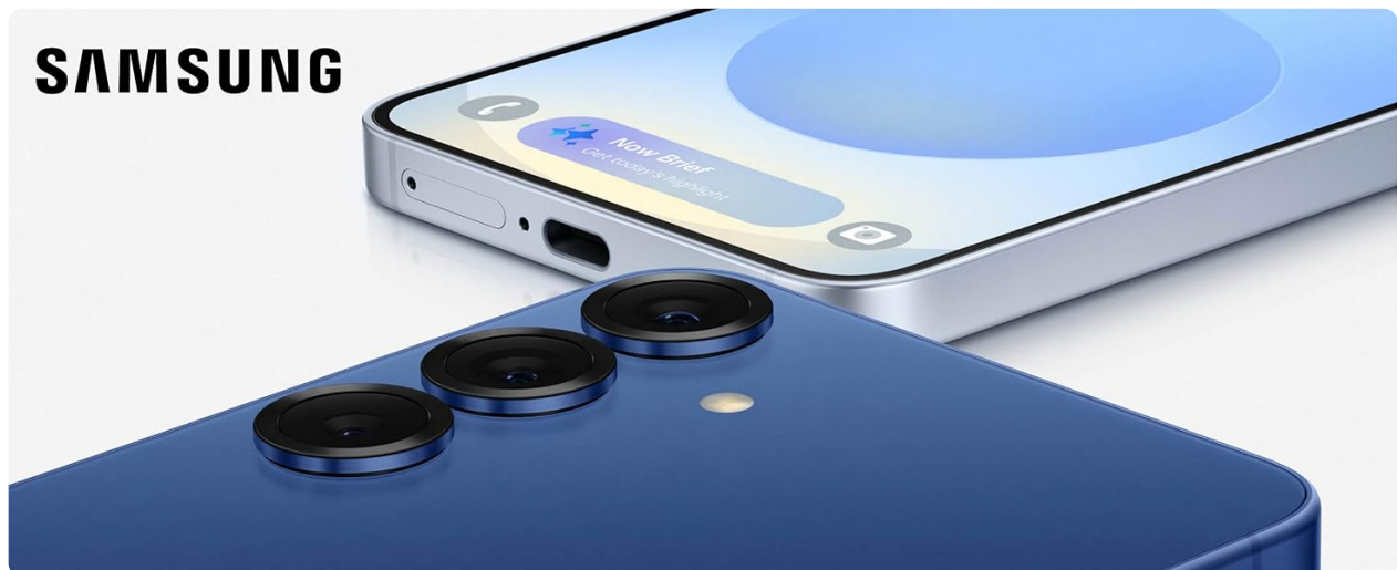
Image: Samsung Galaxy S25 with prominent 'Galaxy AI' branding, showcasing the device's core innovation.

The Samsung Galaxy S25 is a powerful smartphone designed to streamline your daily tasks with advanced AI features, a high-performance processor, and an exceptional camera system. This manual provides essential information for setting up, operating, maintaining, and troubleshooting your device.