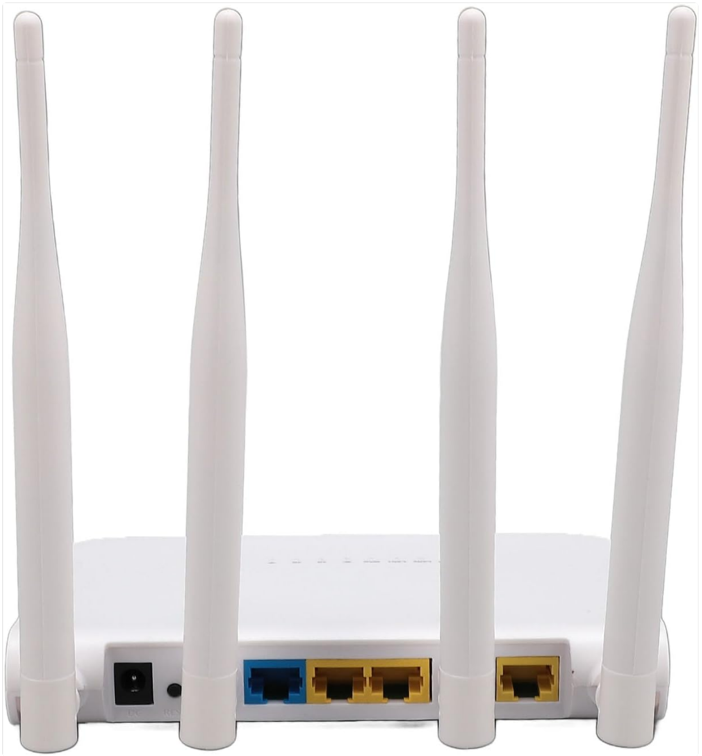
Image: Rear view of the GOWENIC CPE210T router, detailing the DC power input, multiple LAN ports, and a WAN port for wired connections.