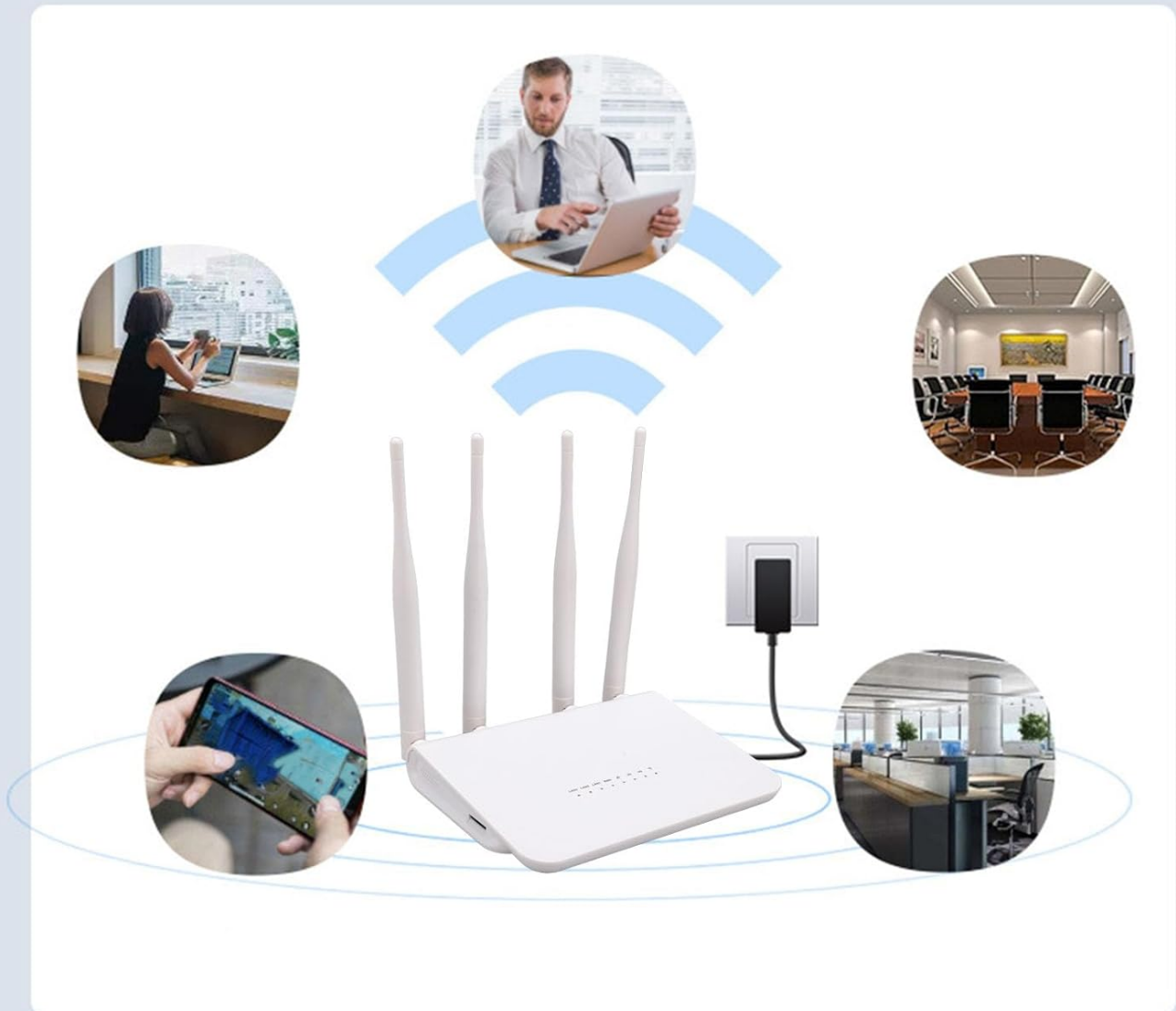
Image: A visual representation of the GOWENIC CPE210T router's function as a 4G to Wi-Fi hotspot converter, supporting up to 32 devices simultaneously.

Can cover 20-30 metres / 65.6-98.4ft and connect up to 32 devices simultaneously