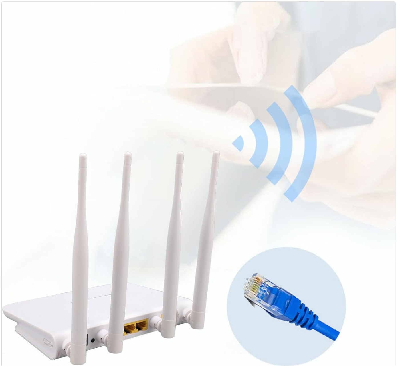
Image: The GOWENIC CPE210T router demonstrating both wireless Wi-Fi signal and wired Ethernet cable connection capabilities.