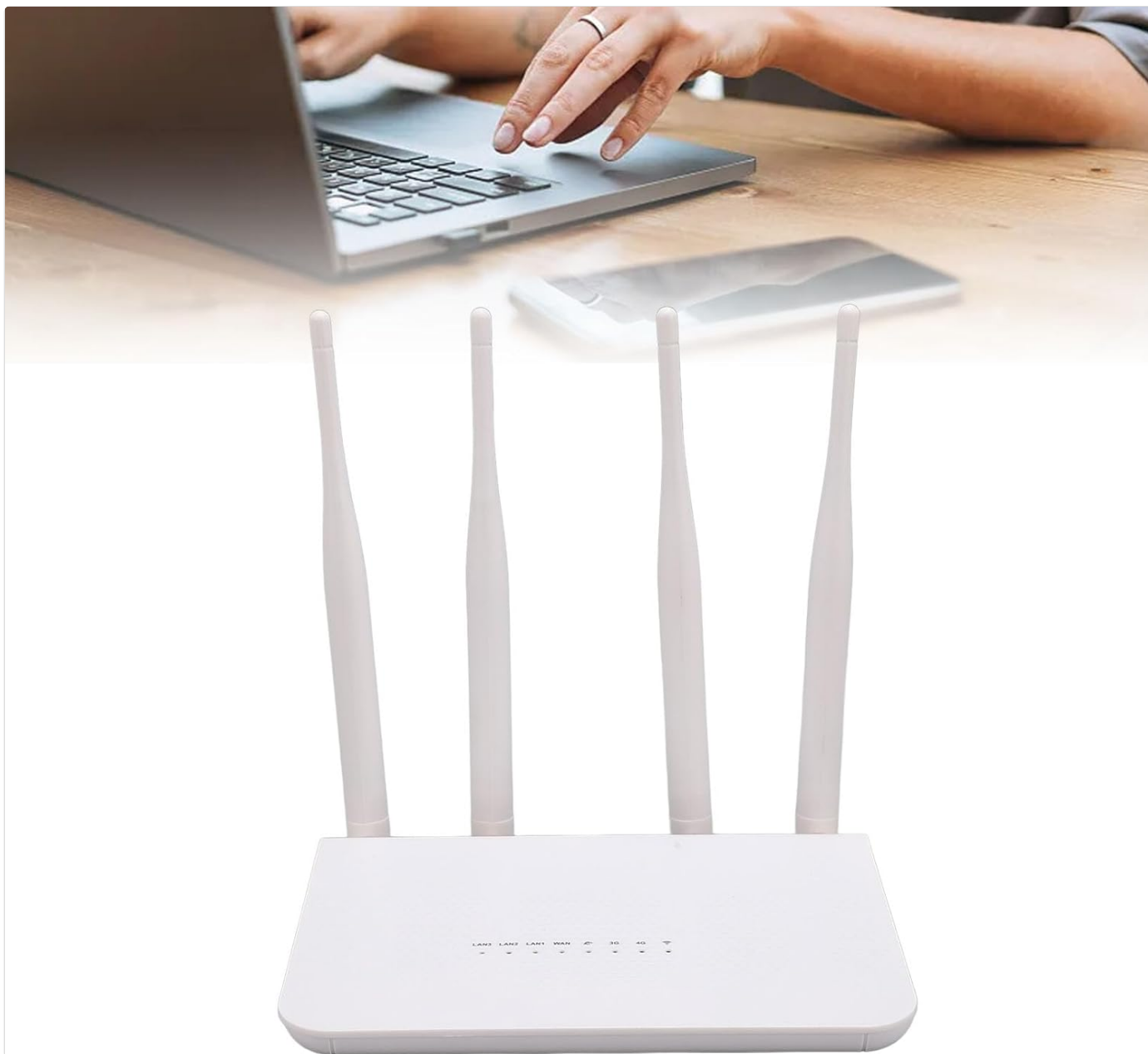
Image: The GOWENIC CPE210T router positioned on a desk, illustrating its role in providing internet connectivity to devices like laptops and smartphones.