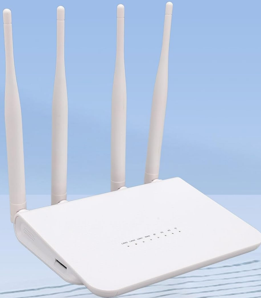
Image: Front view of the GOWENIC CPE210T router, illustrating its 4G LTE wireless capabilities and speed specifications.