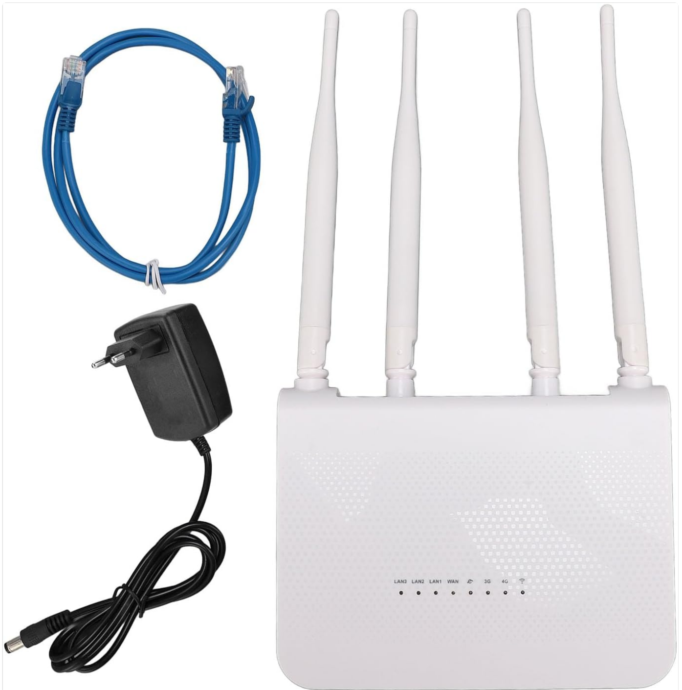
Image: Contents of the GOWENIC CPE210T package, including the router, power adapter, and an Ethernet cable.