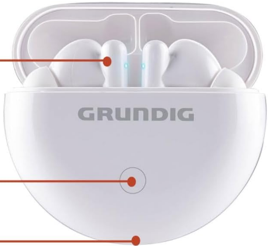
Image: The charging case showing the connection button and USB Type-C charging port.