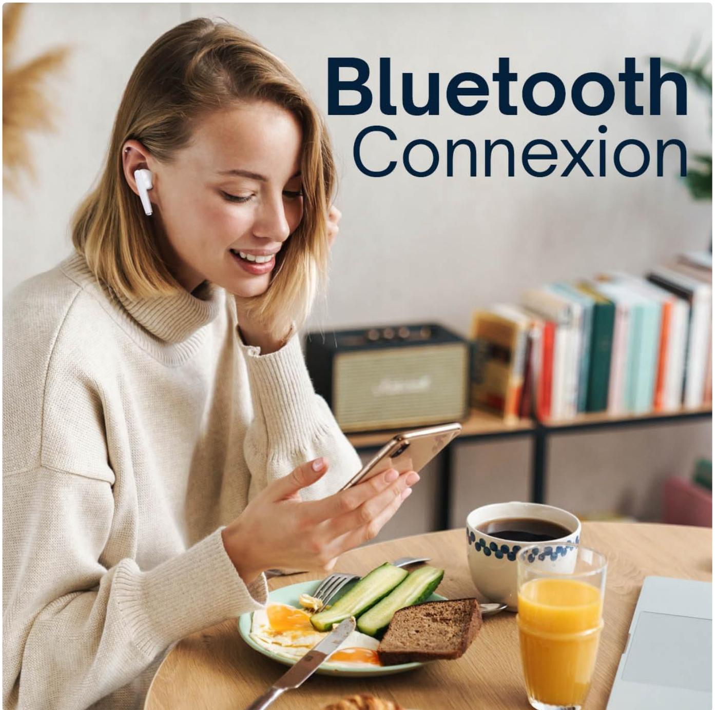
Image: A person enjoying music with Grundig earbuds, demonstrating Bluetooth connectivity.