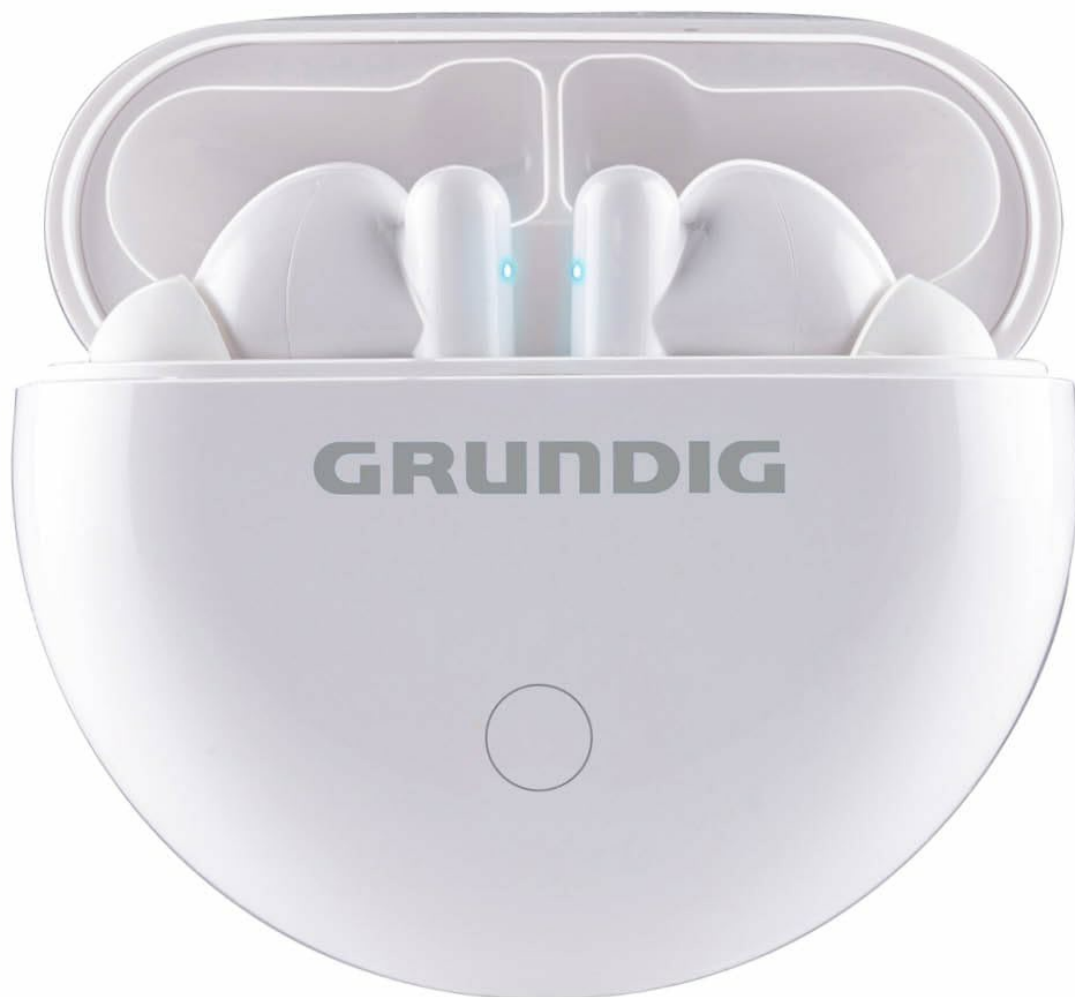
Image: The Grundig True Wireless Bluetooth Earbuds shown with their charging case.