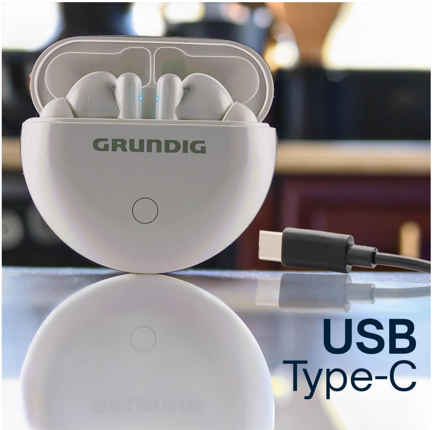
Image: The charging case with a USB Type-C cable connected for charging.