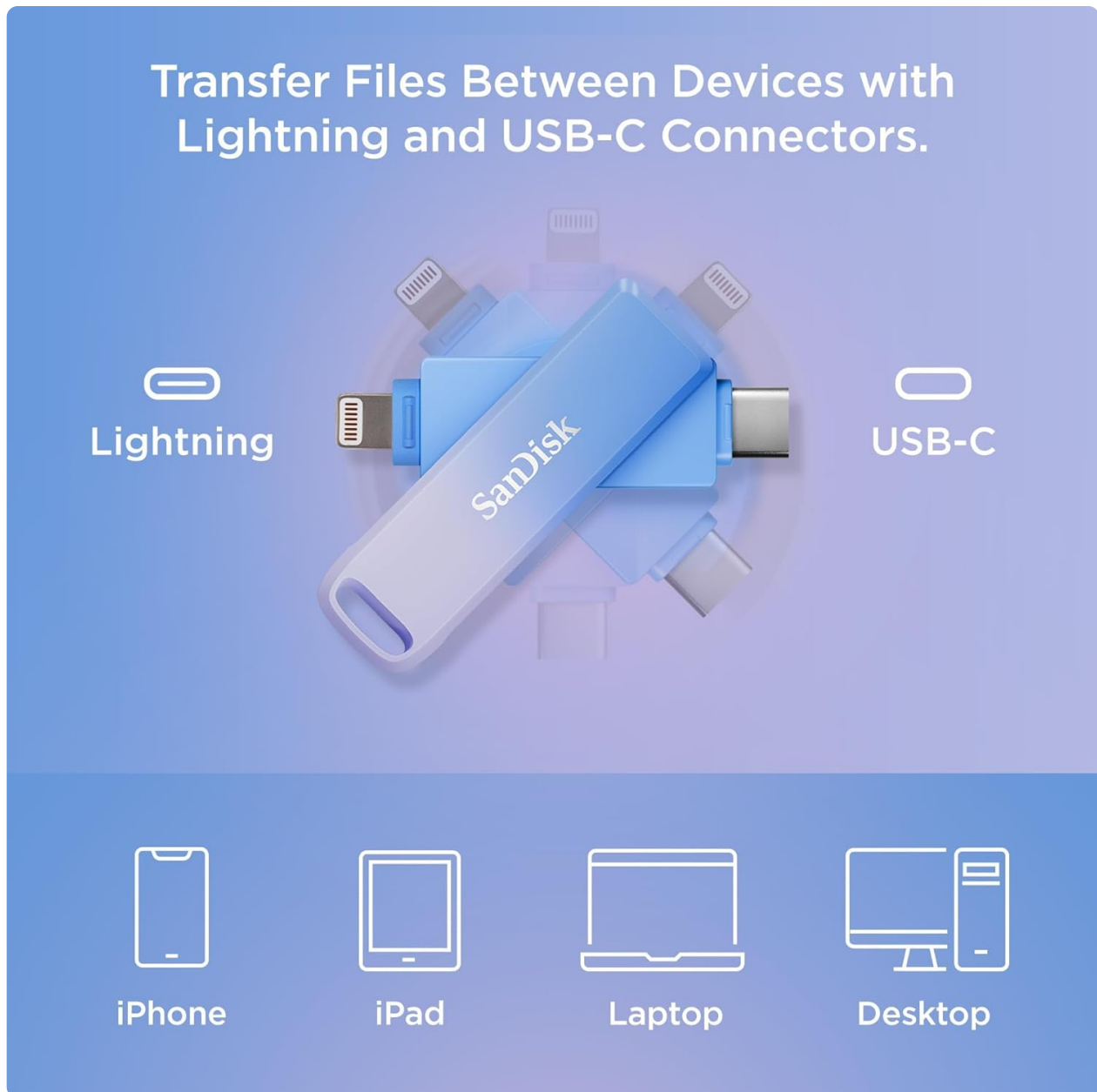
Image 4: A visual guide demonstrating the drive's compatibility with various devices through its dual Lightning and USB-C connectors.

5. Initial Recognition: Your device should recognize the drive automatically. For iOS devices, the SanDisk Memory Zone app will prompt you to connect the drive. For computers, the drive will appear as an external storage device.