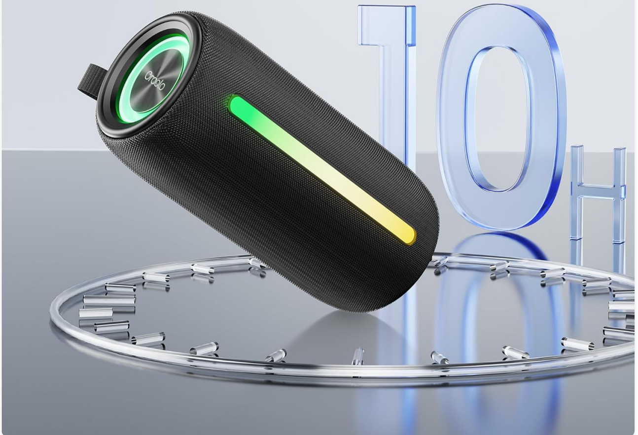
Image: The Oraolo speaker with a large '10H' graphic, indicating its extended playtime capability.

Provides up to 10 hours of playtime at 50% volume off-light