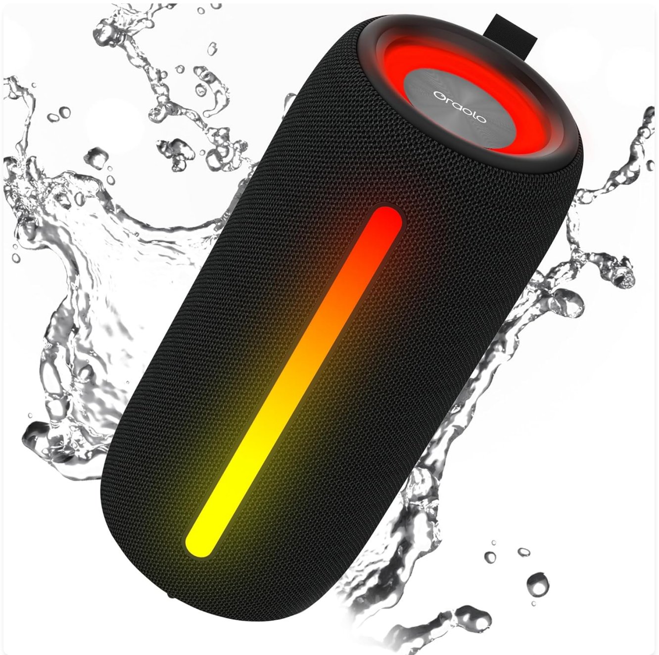
Image: The Oraolo Portable Bluetooth Speaker, black in color, with dynamic RGB lighting and water splashes, highlighting its waterproof design.