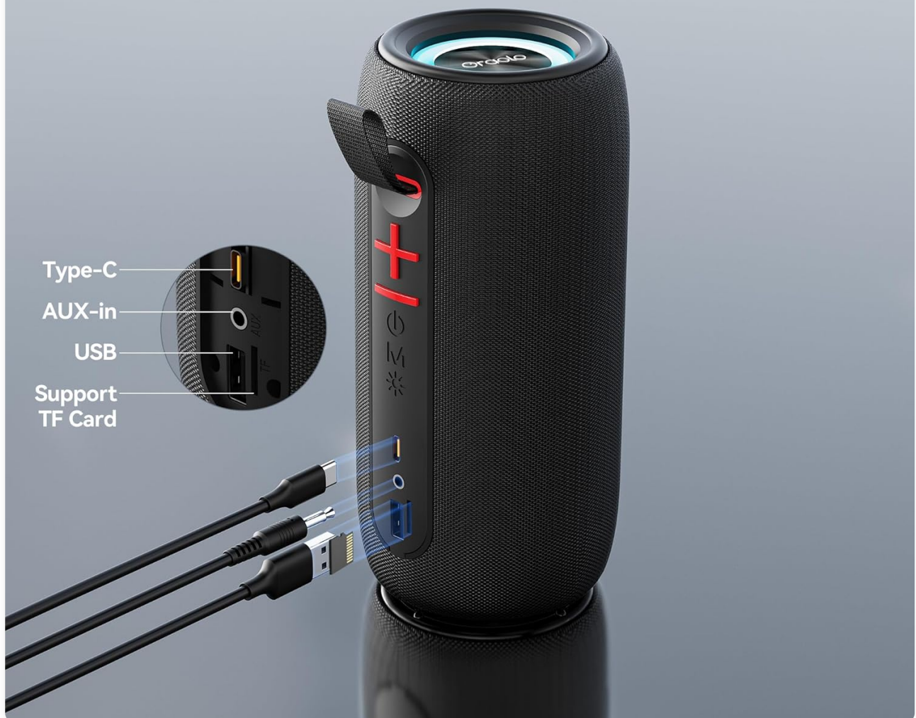
Image: A close-up view of the Oraolo speaker's side panel, clearly labeling the Type-C, AUX-in, and USB ports, along with TF Card support, highlighting its multiple input options.