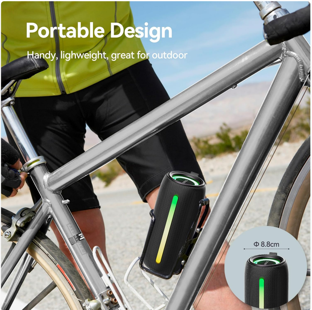
Image: The Oraolo speaker attached to a bicycle frame, demonstrating its portable design and suitability for outdoor activities.