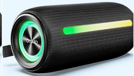
Image: The Oraolo speaker on a beach, showcasing different RGB light modes such as Solid Color, Breath Gradient, and Lights Blink, demonstrating its party light feature.