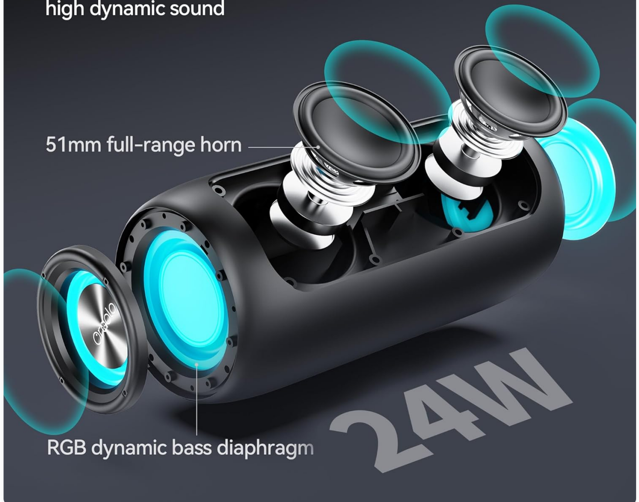
Image: An exploded view diagram of the Oraolo speaker, highlighting its 51mm full-range horn and RGB dynamic bass diaphragm, illustrating its 24W stereo sound capability.

Immersive sound with rich deep bass high dynamic sound