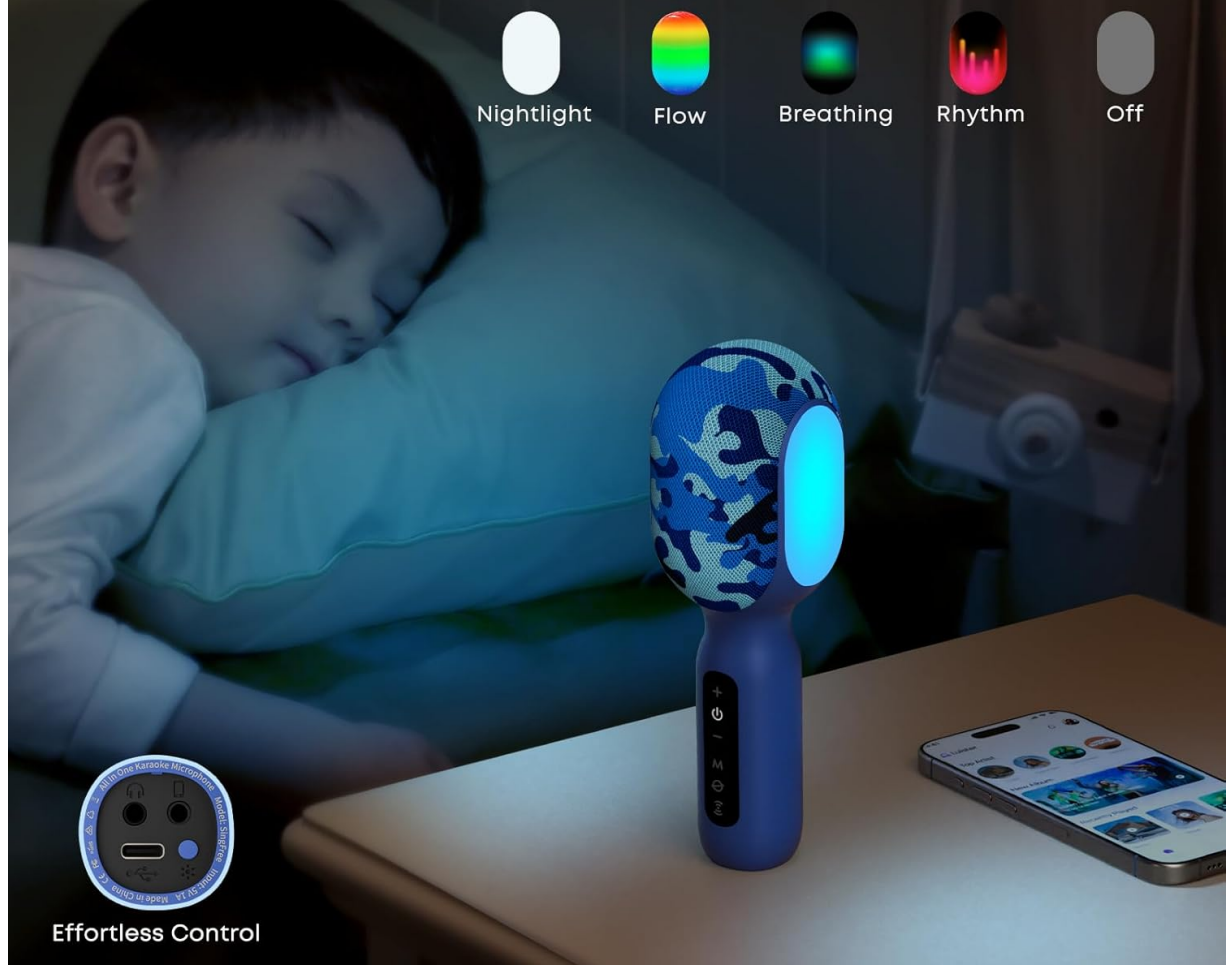
Image: The microphone displaying its LED light features, including a nightlight mode and other dynamic effects.

With a gentle night light to keep you company in all-night comfort.