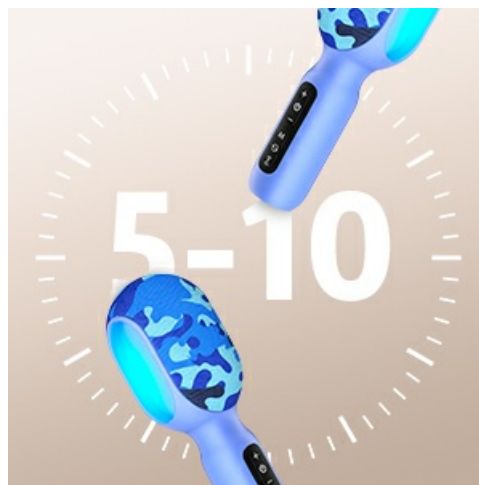
Image: Visual representation of the microphone's battery life, indicating 5-10 hours of playtime.