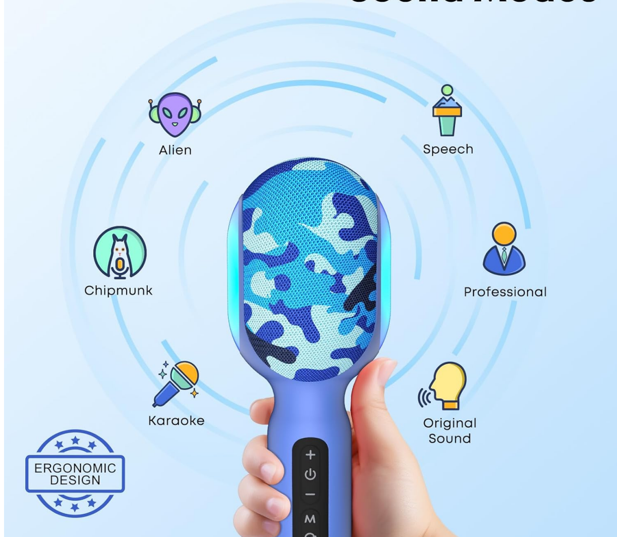
Image: The SONDTUO KM10 microphone showing its ergonomic design and control panel on the handle. Buttons include Power, Volume Up/Down, Mode, and LED light control.