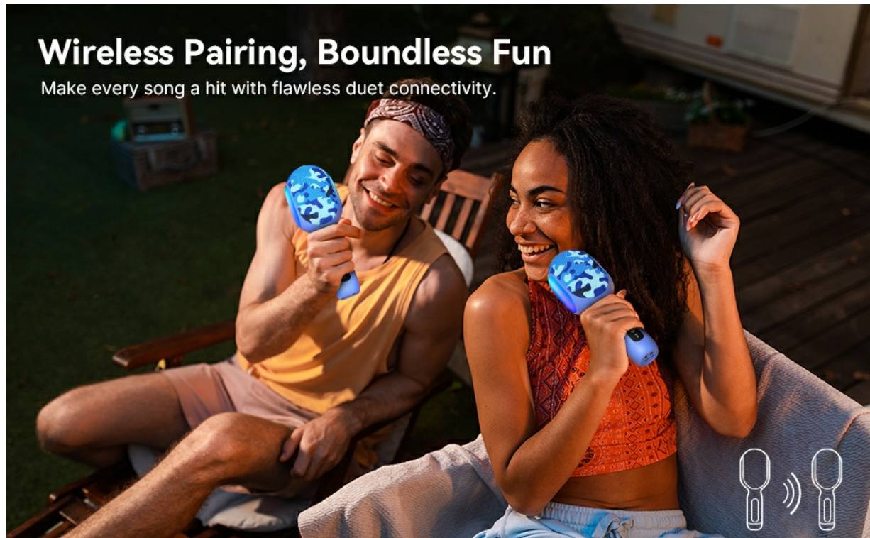
Image: Two individuals using separate KM10 microphones, demonstrating the wireless stereo pairing for duet singing.