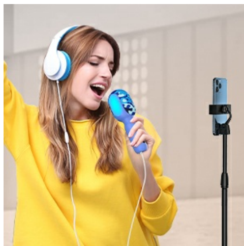
Image: A user recording their singing performance with the microphone and headphones.

The KM10 microphone supports voice recording. Connect the microphone to your device via Bluetooth or AUX, and use a compatible recording application on your device to capture your performances.