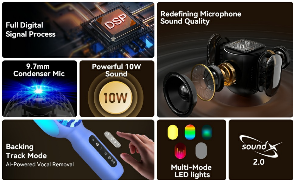
Image: An illustration detailing the internal components of the microphone, emphasizing the 10W speaker and DSP chip for high-fidelity audio.