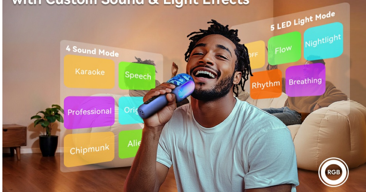
Image: Visual representation of the microphone's multi-sound effects, showing different voice modes.