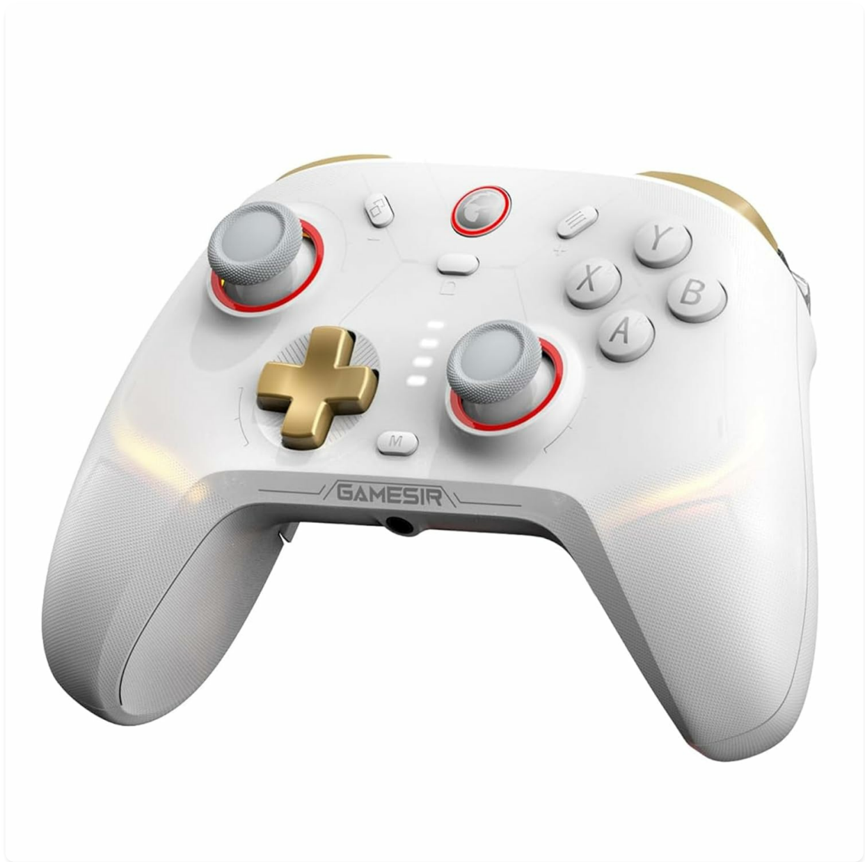
Figure 1: GameSir Cyclone 2 Multiplatform Wireless Controller (Phantom White)

The controller is compatible with PC, Steam, Nintendo Switch, iOS, and Android platforms, offering flexible connectivity options including Bluetooth, 2.4G wireless, and wired USB connection.