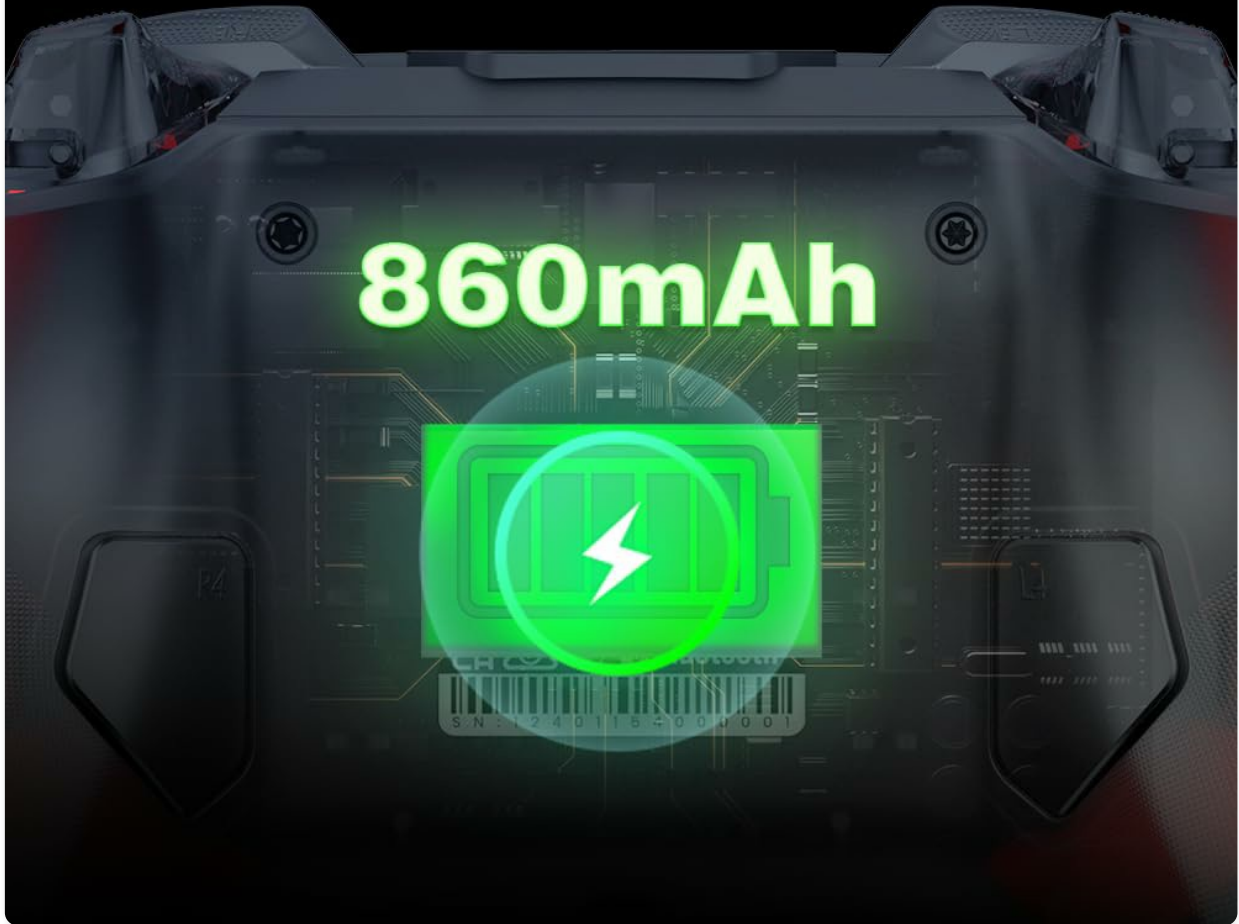
Figure 2: 860mAh Battery for Extended Play